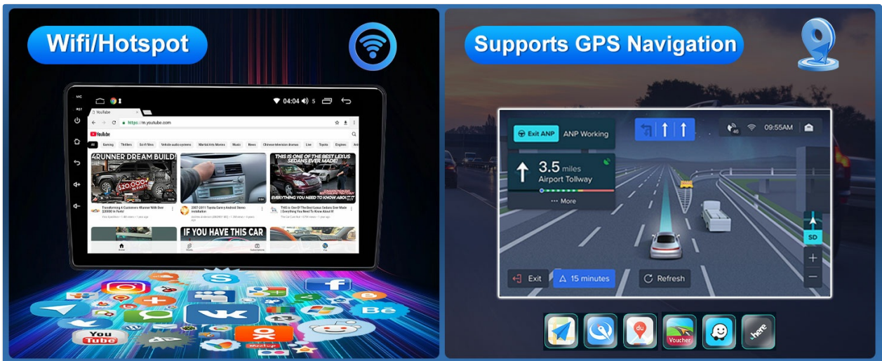
Image: The car stereo displaying GPS navigation and Wi-Fi connectivity options, highlighting the ability to use various online applications.

Utilize online or offline maps for navigation. The built-in Wi-Fi allows for internet access, app downloads, and real-time traffic updates. You can also use your phone's hotspot for connectivity.