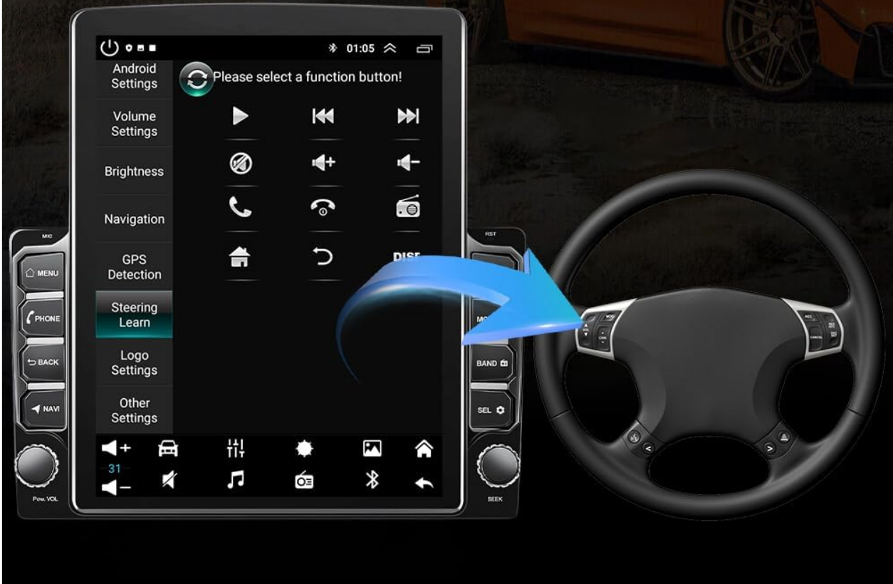
Image: Illustration of the steering wheel control learning interface, showing how to map vehicle steering wheel buttons to car stereo functions.

Your original car's steering wheel control will still work after installation of this all-in-one