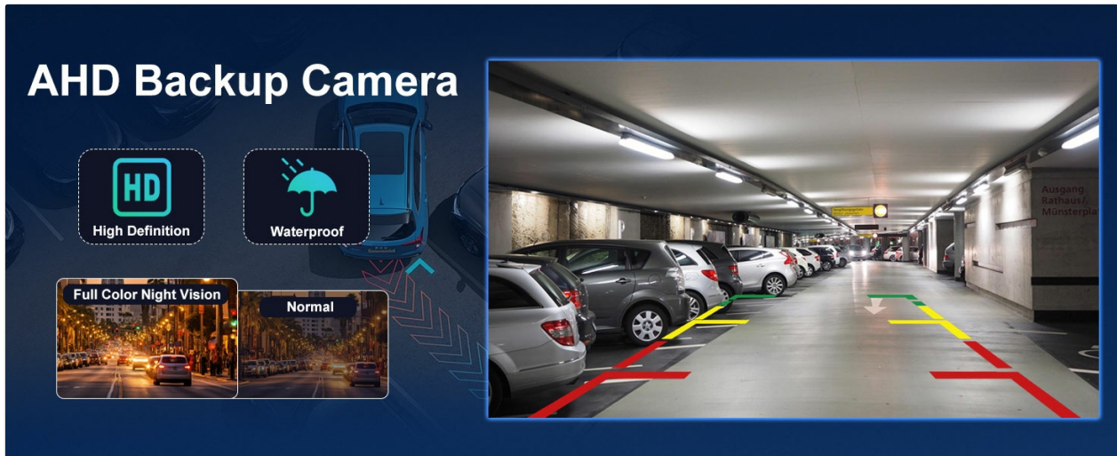
Image: Features of the AHD Backup Camera, including HD resolution, waterproofing, and full-color night vision for optimal visibility.

If the issue persists after these steps, please contact customer support.