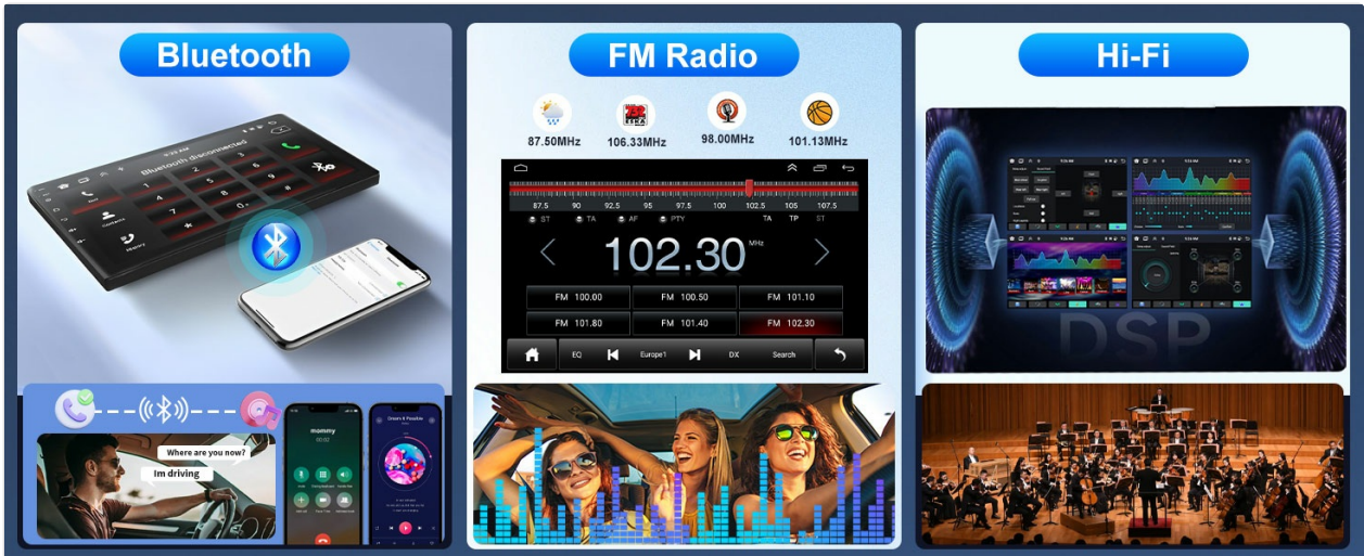
Image: Overview of Bluetooth connectivity for calls and music, FM radio interface, and Hi-Fi audio settings for an enhanced sound experience.

Connect your phone via Bluetooth for hands-free calling and audio streaming. The FM/RDS radio provides access to local radio stations with station information display.