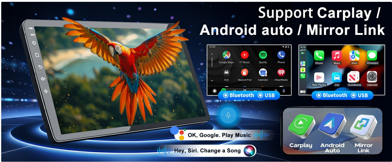
Image: Display of the CarPlay and Android Auto interfaces on the car stereo, showing integrated apps and controls.