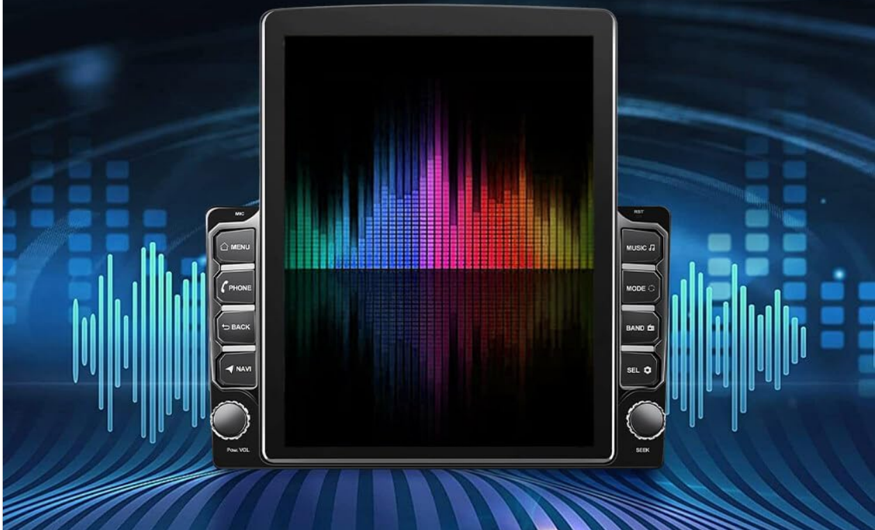
Image: The car stereo displaying the Hi-Fi Audio and EQ Sound Effect interface, allowing users to customize audio settings for a live concert-like experience.

Hi-Fi Audio create the sound effects like a live concert and enjoy this sound in the car, support subwoofer