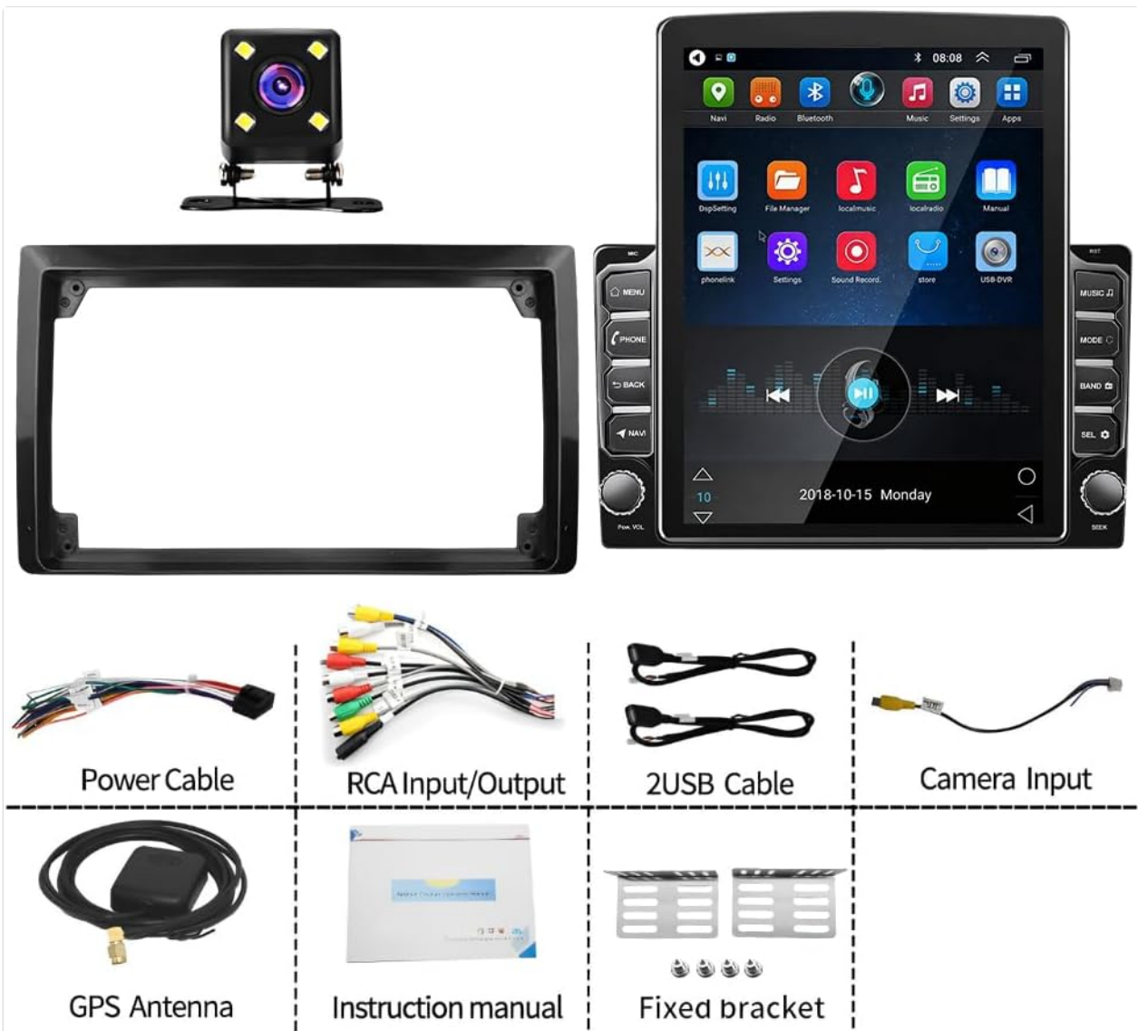
Image: Detailed view of the various wiring harnesses and connectors for the car stereo, including power, RCA, USB, and camera inputs.