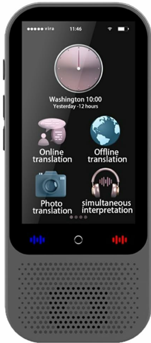
Image 1.1: Overview of the S80 Pro AI Translation Device's main features.