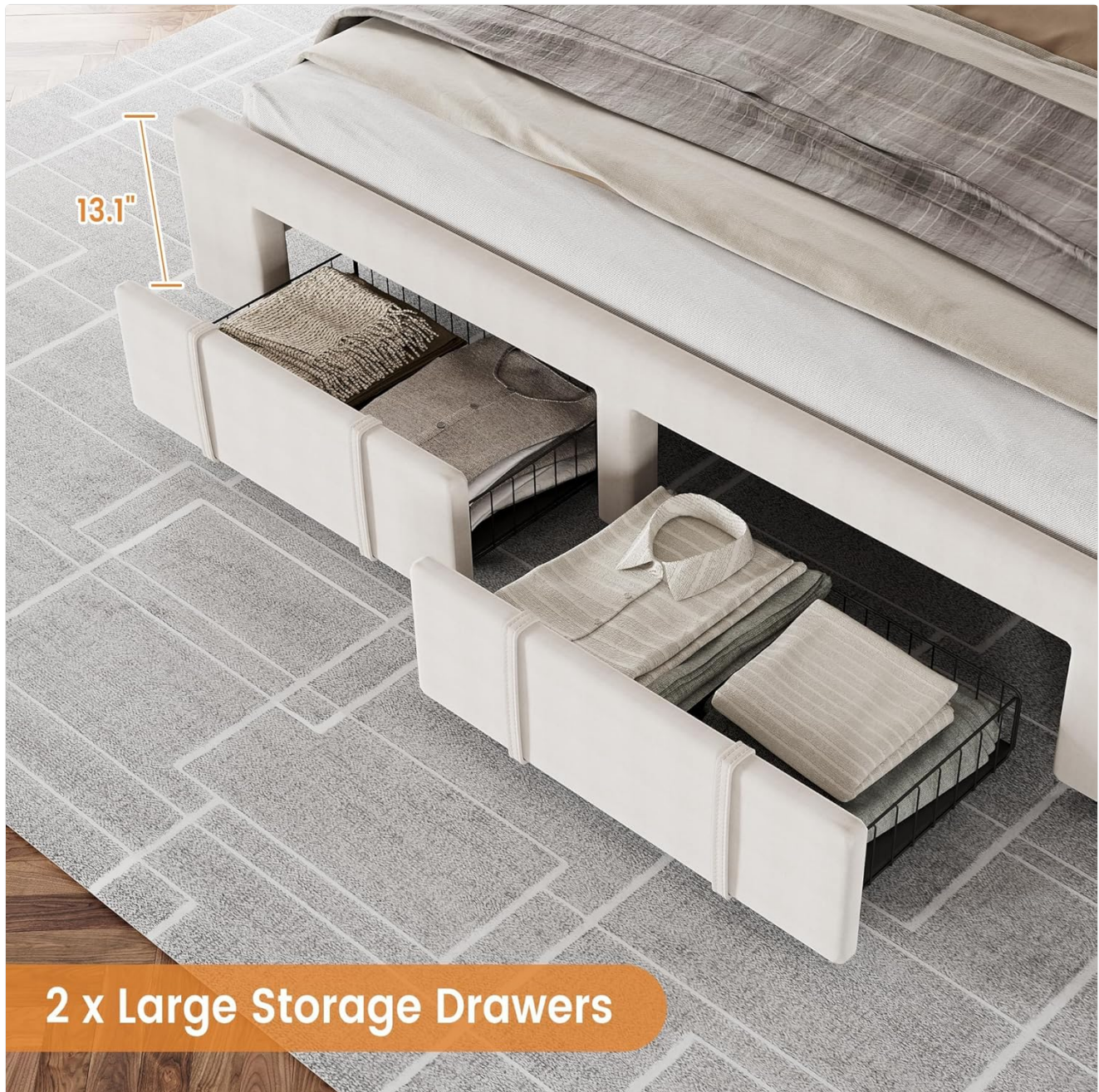
Figure 5.1: Two large storage drawers in use.