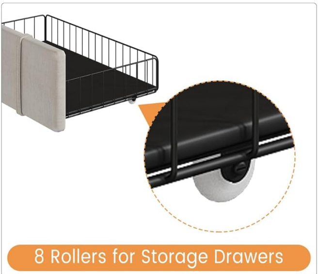
Figure 3.2: Detailed view of structural components including metal frame, wooden slats, support feet, and drawer rollers.