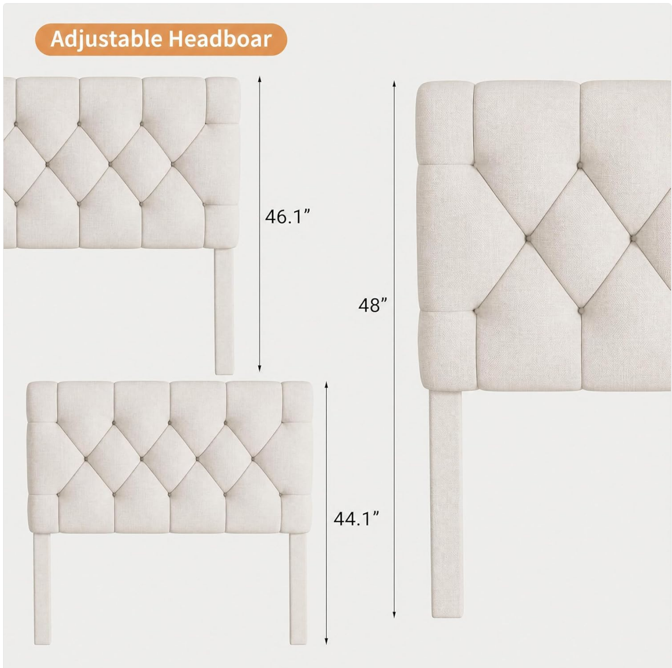
Figure 4.1: Adjustable headboard height options.