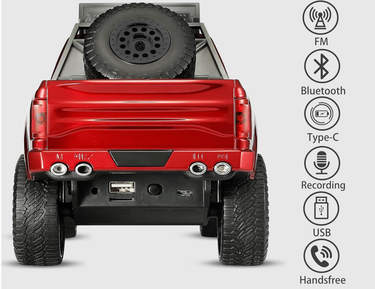
Figure 4.4: Rear view of the speaker, indicating ports for AUX, TF card, USB, and Type-C charging, along with power and control buttons.

Bluetooth / TF card / USB drive, listen whenever you want