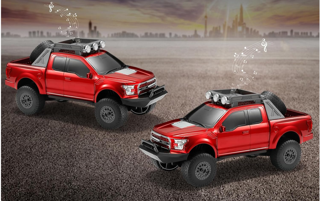
Figure 6.2: Two WS-589 speakers connected via TWS for an immersive stereo audio experience.

Pairing two units instantly transforms them into a surround sound system