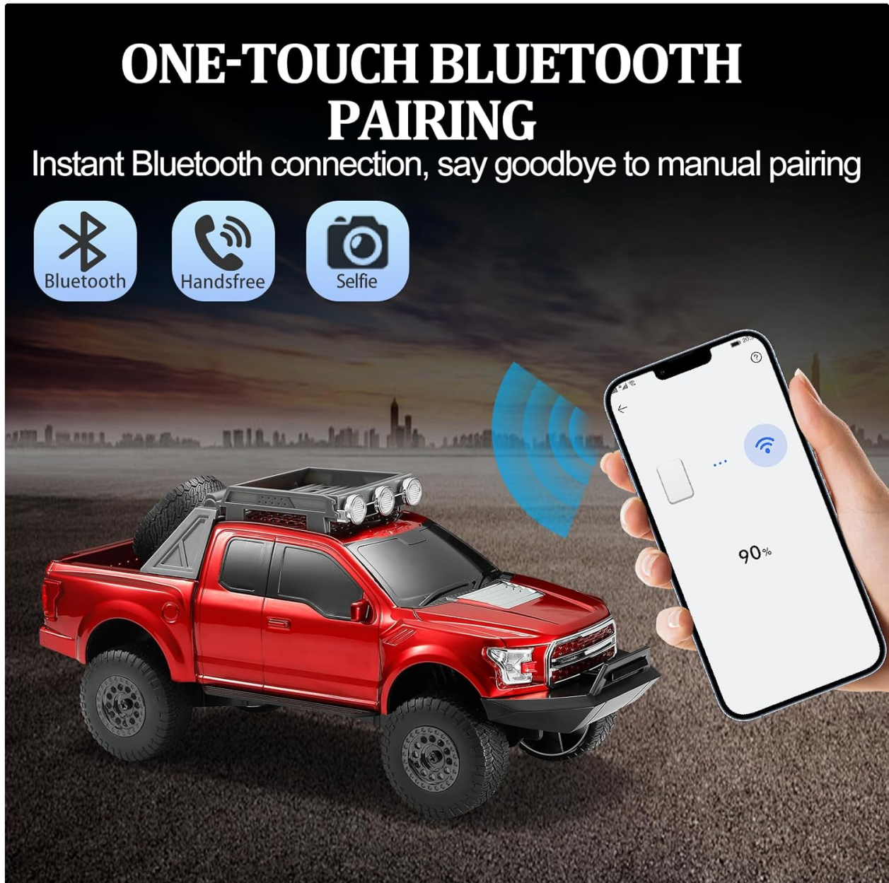
Figure 4.1: Front-side view of the WSTER WS-589 Off-Road Pickup Truck Bluetooth Speaker.

The WSTER WS-589 is a portable Bluetooth speaker designed in the shape of an off-road pickup truck. It features LED roof lights, a rear tire design, and multiple playback options.