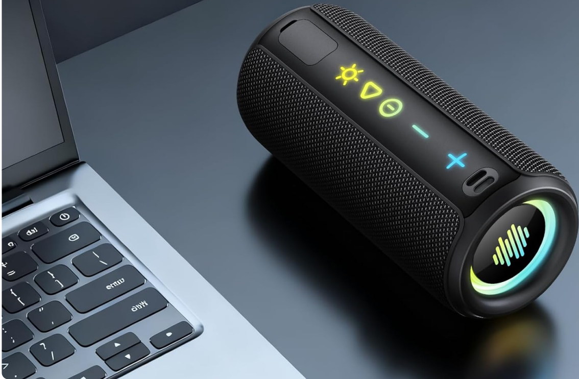
Image: TIMU S11-2 Speaker showing Type-C, AUX, and TF card ports under a protective flap.