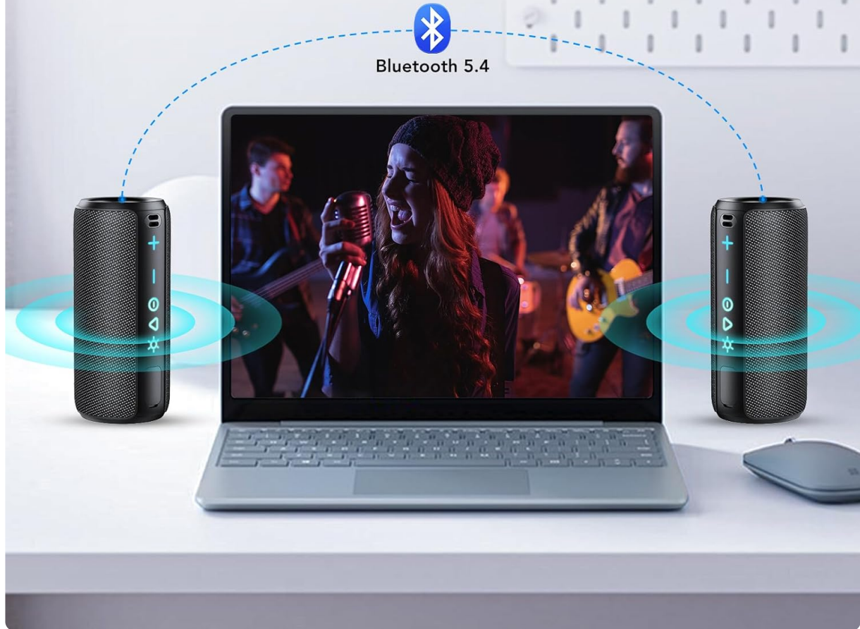
Image: Two TIMU S11-2 speakers wirelessly paired to a laptop for stereo sound.

Connect two speakers together to get stereo sound and enjoy fully immersive audio