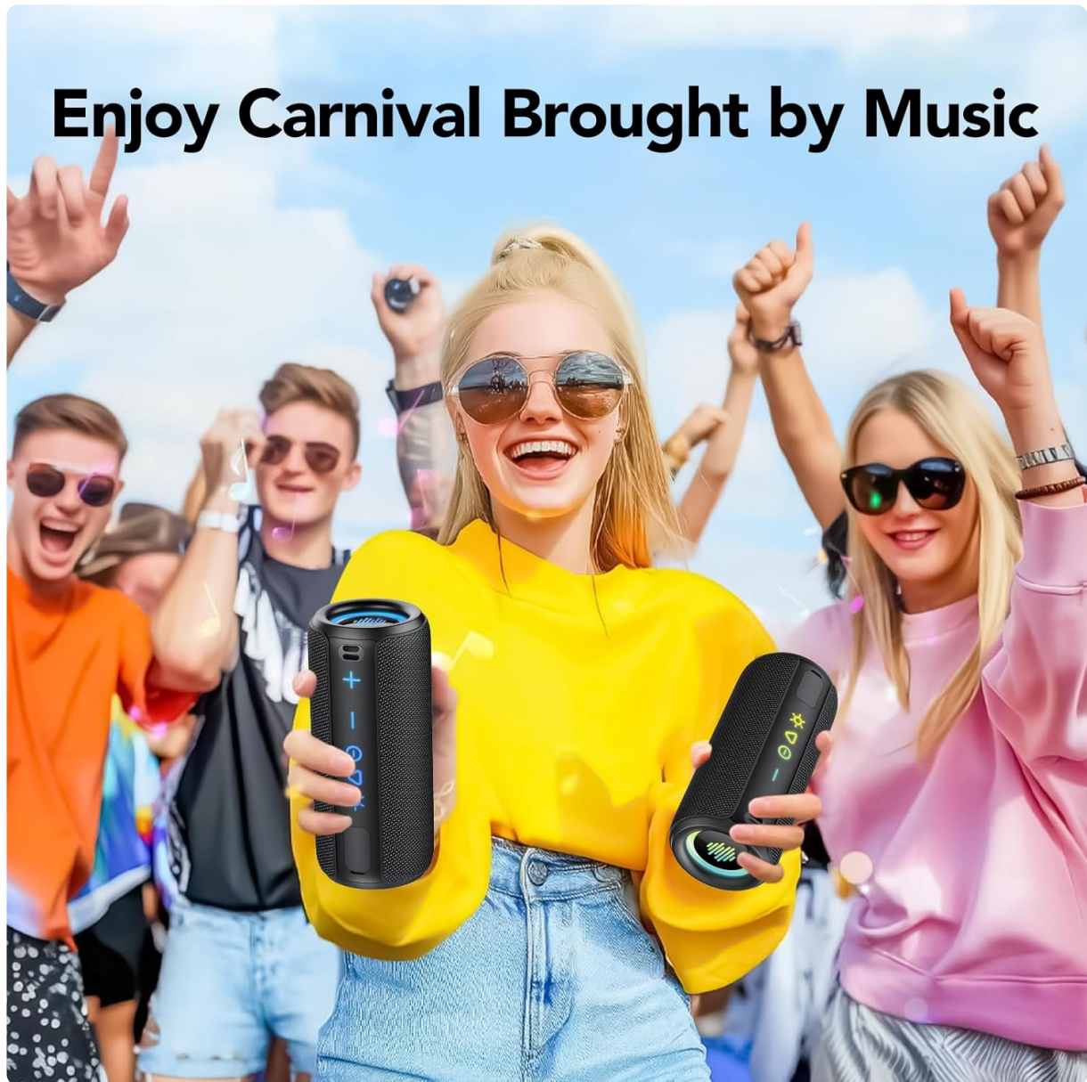
Image: Group of people enjoying music with two TIMU S11-2 speakers displaying colorful RGB lights.

The speaker features 8 RGB light modes to enhance your listening experience.