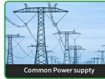
Common Power supply