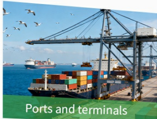
Ports and terminals