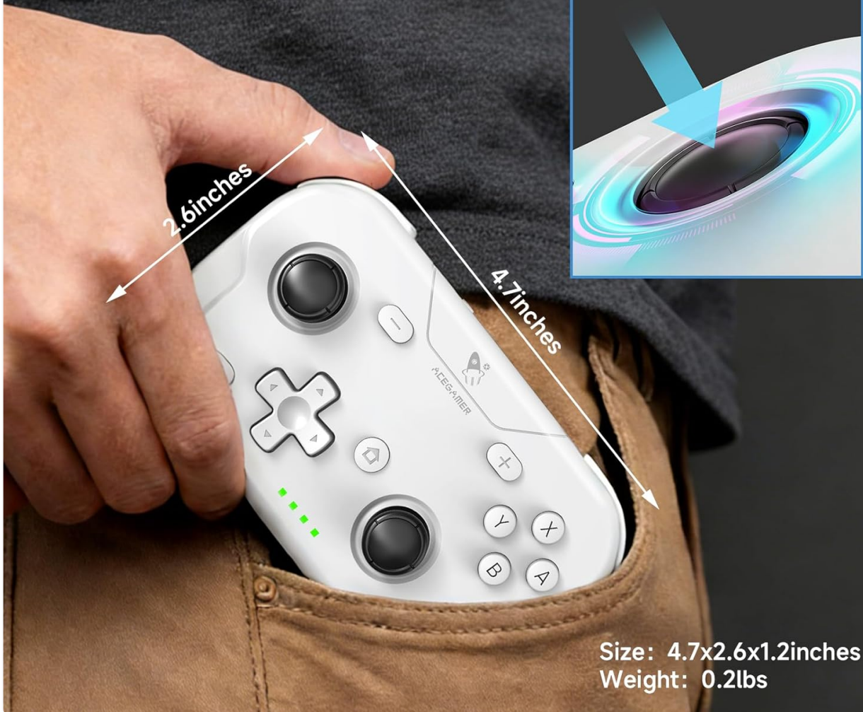
Image: The AceGamer Wireless Pocket Controller demonstrating its compact size and dimensions, easily fitting into a pocket. Dimensions are shown as 4.7 inches by 2.6 inches by 1.2 inches, with a weight of 0.2 lbs.

The compact build and recessed joysticks protect your gear on the go. Slip it in, pull it out, and play.