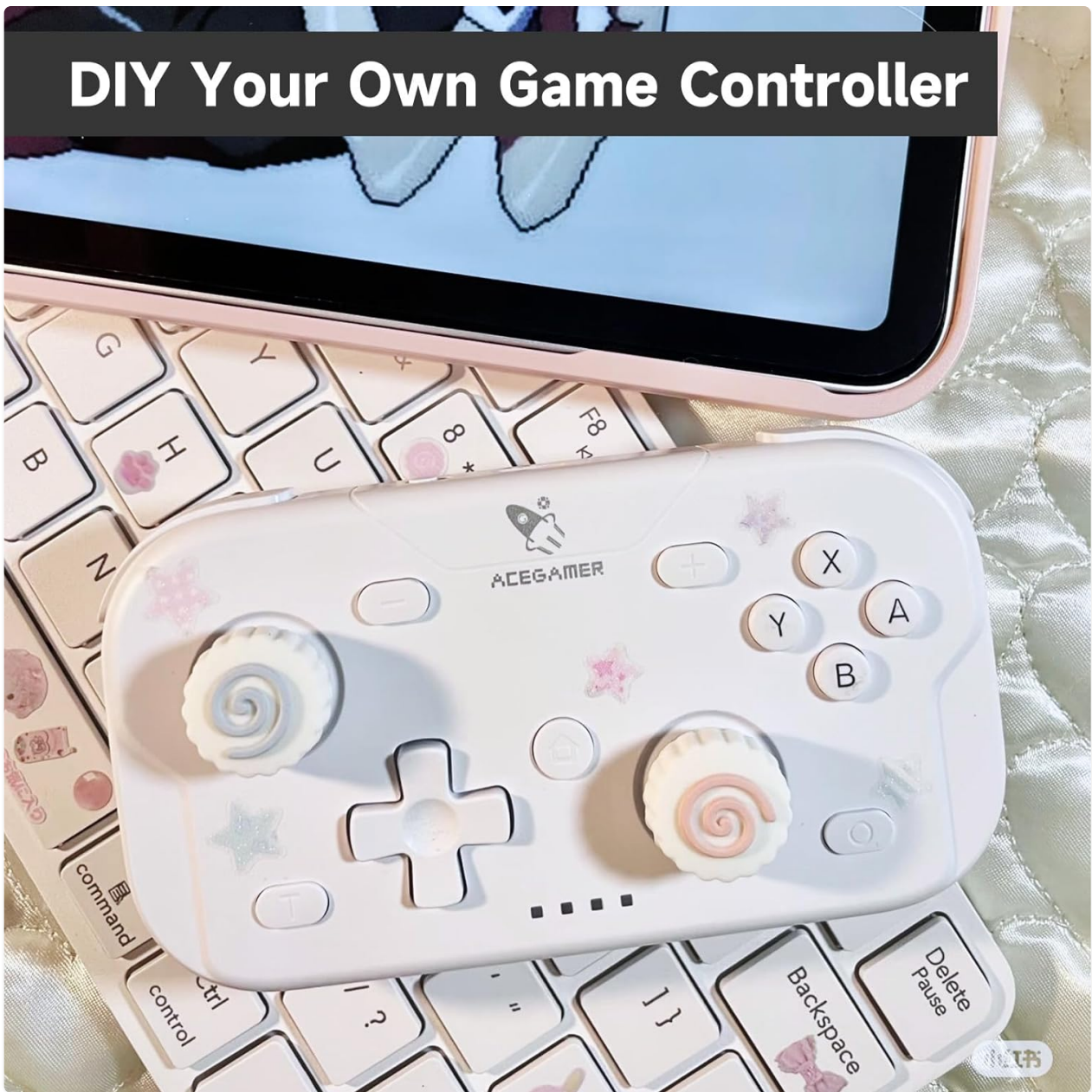
Image: The AceGamer controller highlighting the one-tap wake-up button and the 3-speed Turbo Rapid Fire function, with speeds of 5, 12 (default), and 20 shots/s.