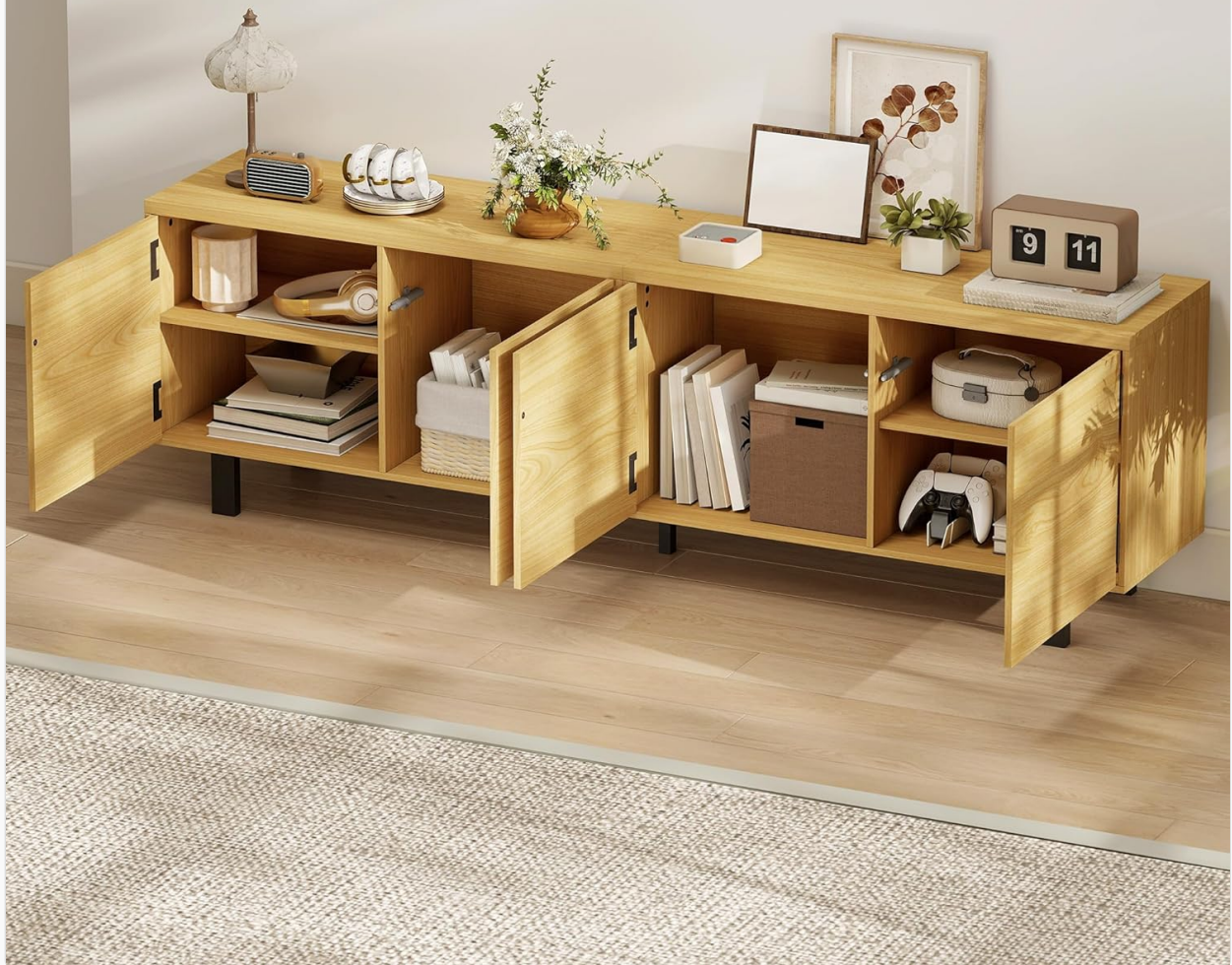
Image: The TV unit with all four doors open, showcasing the internal storage layout. The image highlights the two side compartments with shelves and the two central, larger compartments.

Gardez vos consoles de jeux et vos équipements de divertissement à l'abri de la poussière.