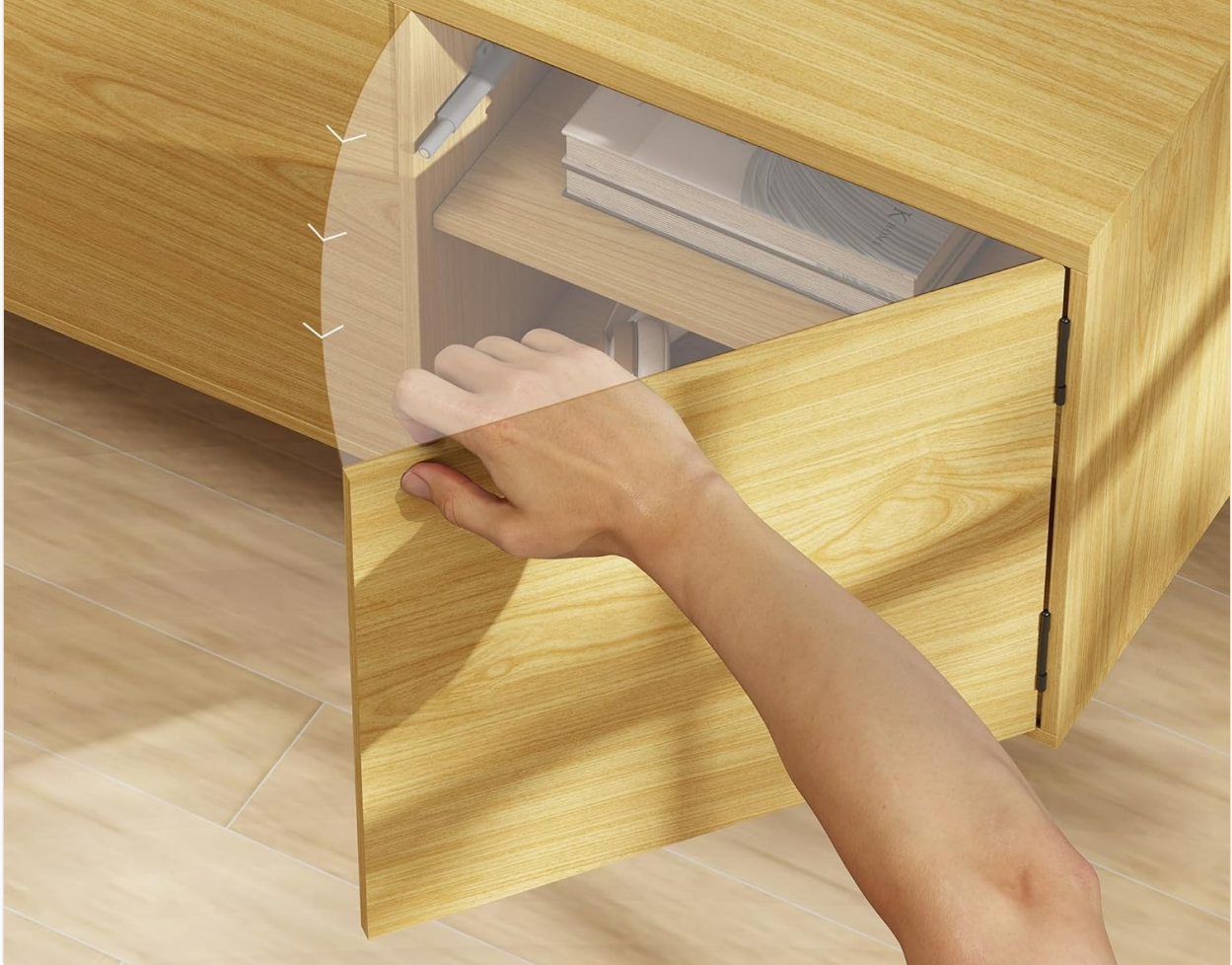
Image: A close-up view illustrating the press-open door feature. A hand gently pushes the door, causing it to open without the need for external handles.

Facilitez l'accès et créez un style sans poignée