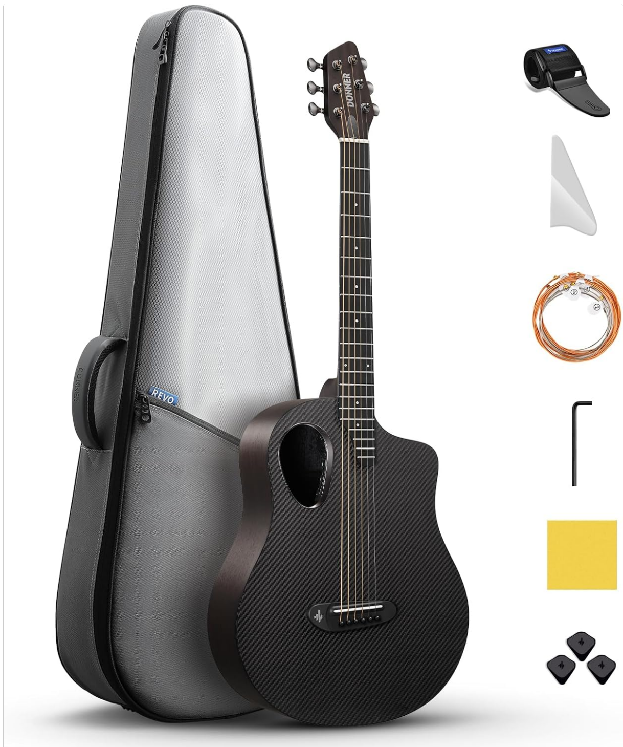
Figure 1: Front view of the Donner RISING-G2 Acoustic Electric Guitar.