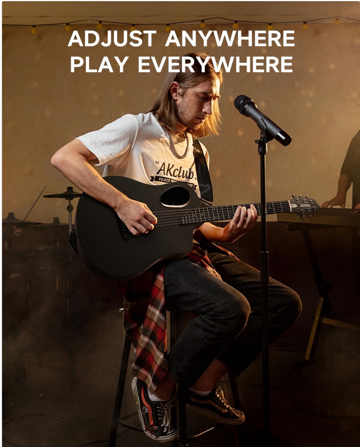
Figure 2: The RISING-G2 guitar is designed for comfortable playing.

The RISING-G2 guitar can be played acoustically. Its carbon fiber top and mahogany body are designed to produce a balanced tone. The ergonomic body shape provides comfortable playability.