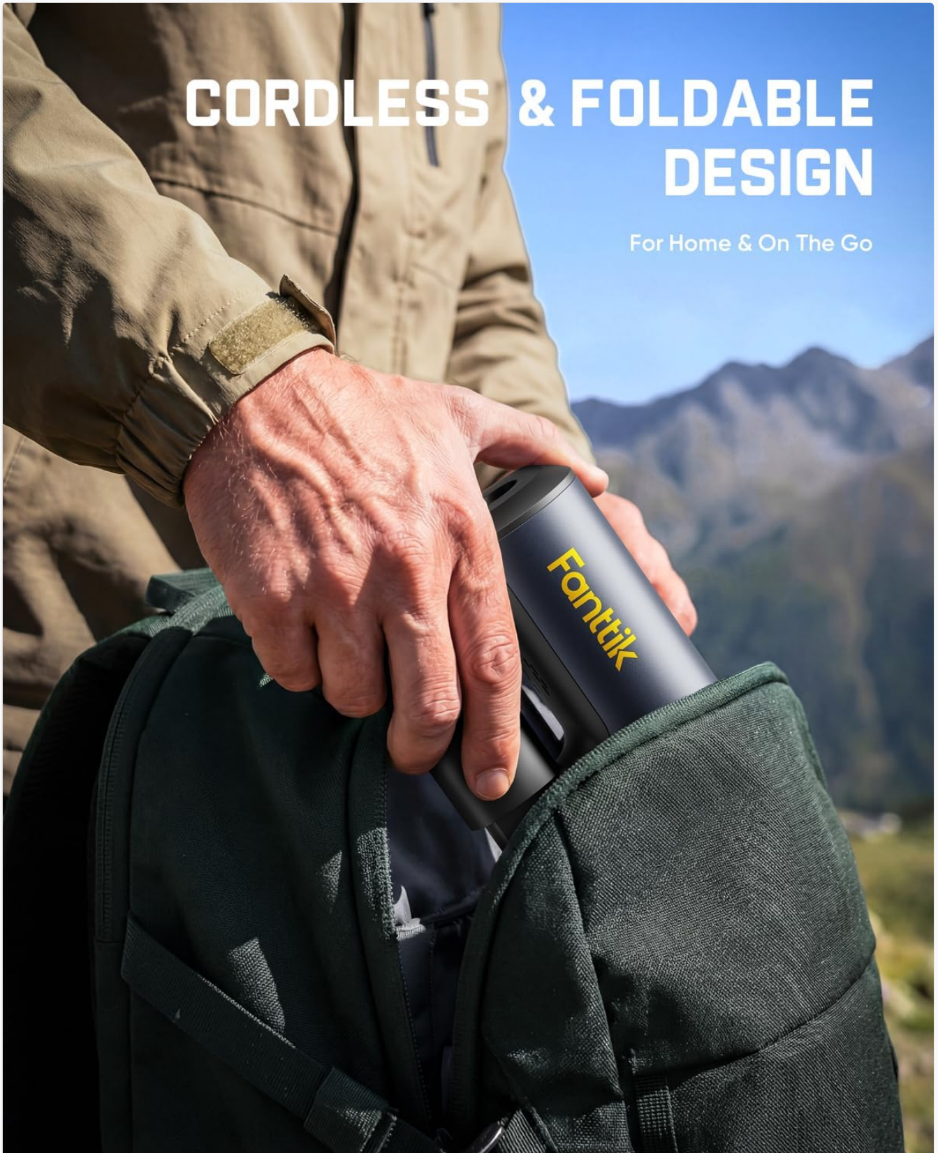
Image: The Fanttik NB10 Flip showcasing its foldable and cordless design, making it easy to carry and store.