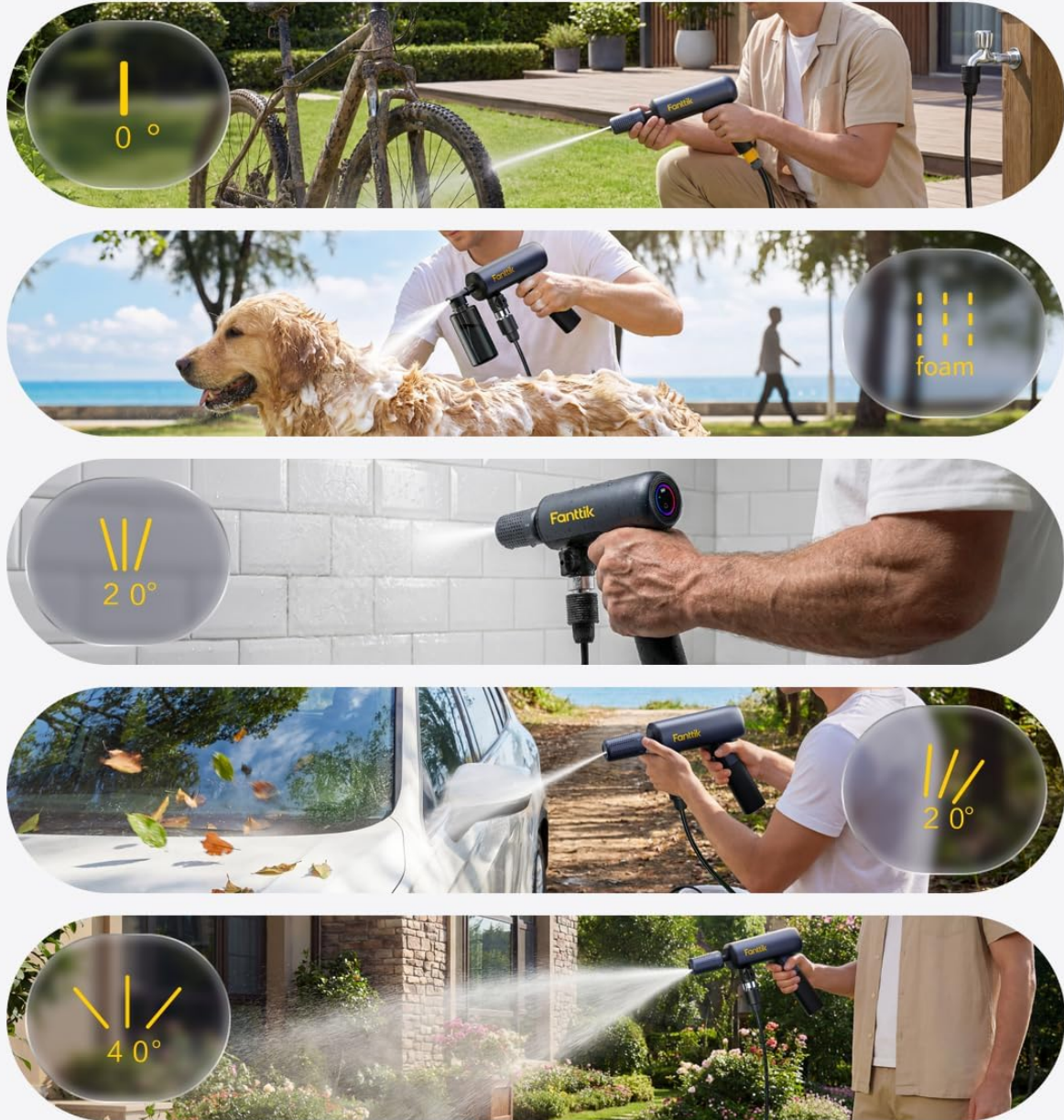
Image: The 5-in-1 integrated nozzle, demonstrating various spray patterns for different cleaning tasks.