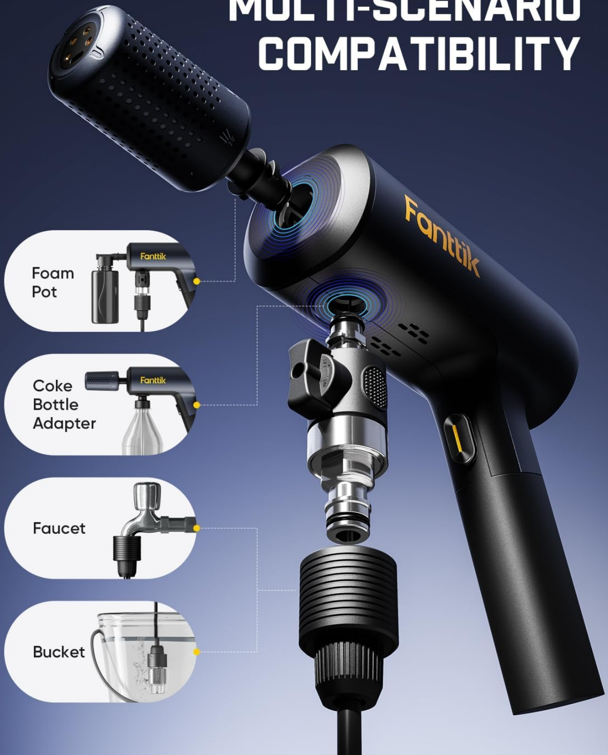
Image: Visual guide to connecting the pressure washer to different water sources like a bucket, faucet, or cola bottle.