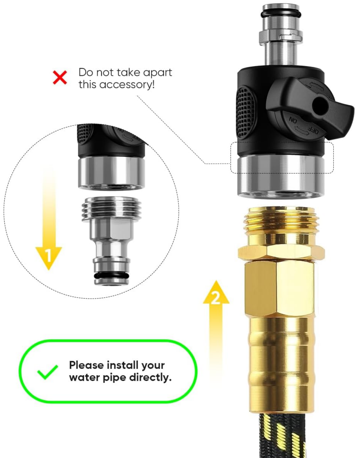
Image: Step-by-step instructions for connecting the water pipe, highlighting a component that should not be detached.

Your browser does not support the video tag.