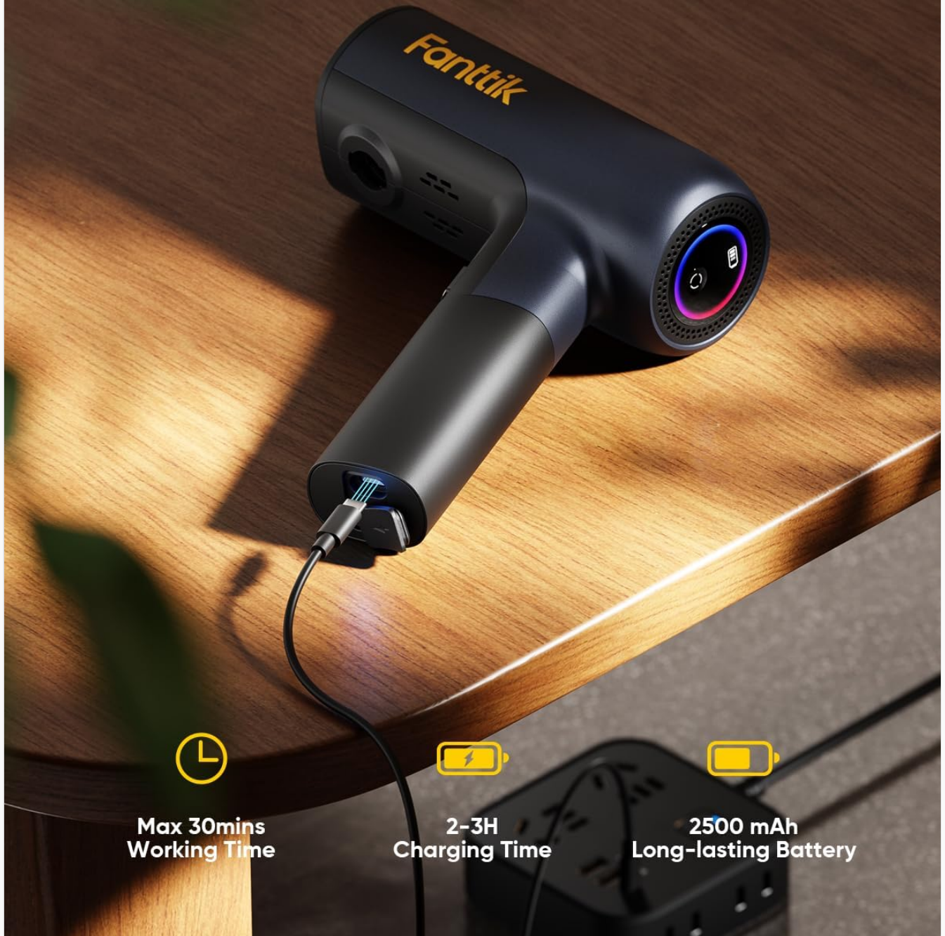
Image: The Type-C charging port and cable, illustrating the charging process and battery specifications.