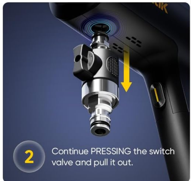
Image: Detailed steps for valve installation and removal, showing alignment and rotation.

Your browser does not support the video tag.