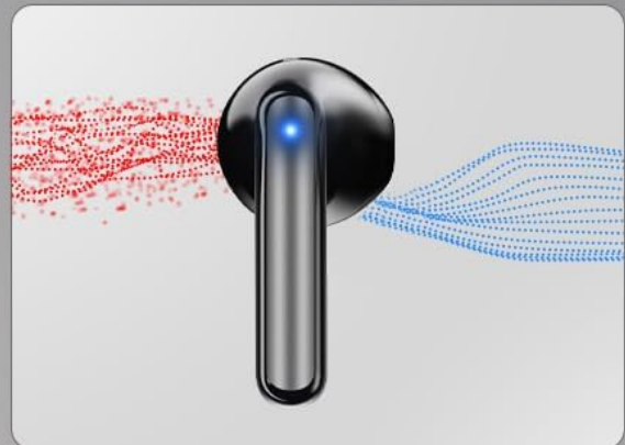
Image: Environmental Noise Cancellation (ENC) technology with 4 microphones actively reduces background noise for clearer calls.