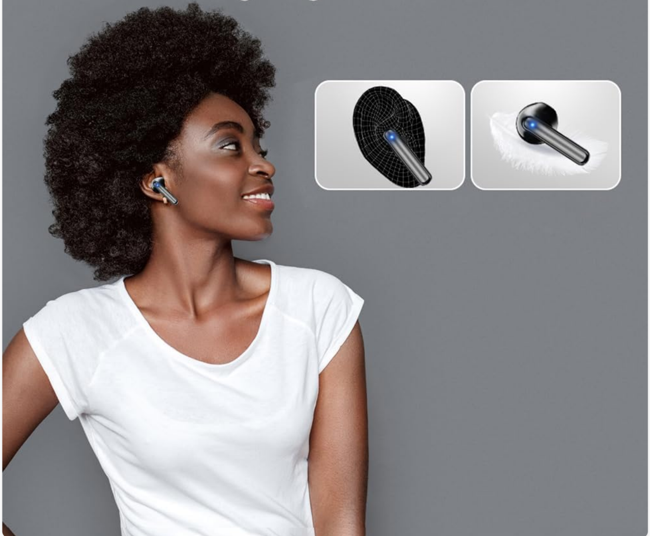
Image: The ergonomic design ensures a comfortable and secure fit, suitable for various activities.