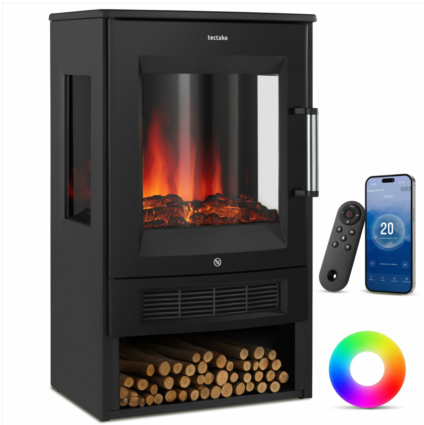
Image 1.1: The TecTake Aidan Electric Fireplace, showcasing its design and 3D flame effect.