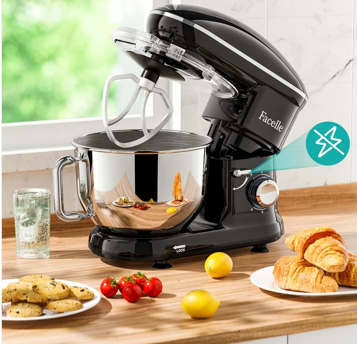
Image: The Facelle stand mixer with its head tilted upwards, showing the attachment shaft and the mixing bowl in place. This illustrates the tilt-head design for easy access.