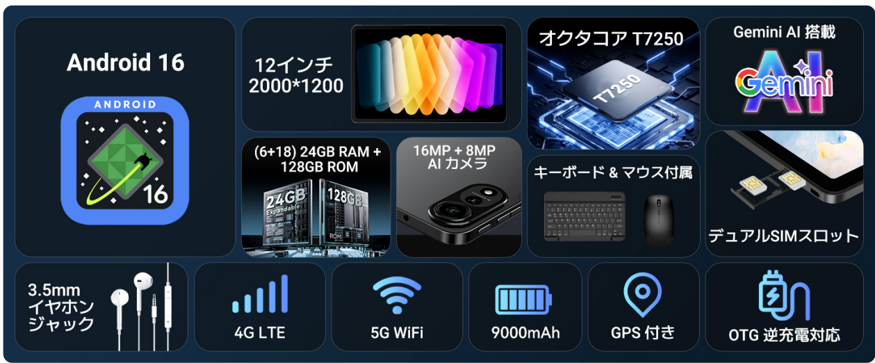
Image: Visual representation of Android 16 features, including AI enhanced performance, smart AI functions, and improved privacy protection.