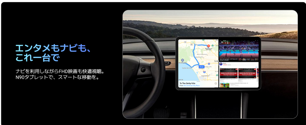
Image: A user demonstrating dynamic split-screen functionality, watching a tutorial video on one side and chatting on the

Utilize the PC Mode and the included keyboard to transform your tablet into a portable workstation for document creation and email management. The dynamic split-screen feature allows you to run multiple applications simultaneously, ideal for multitasking, studying, or video conferencing.