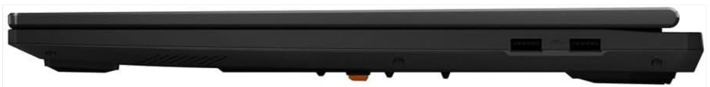
Figure 5: Right side of the laptop showing additional USB-A ports.