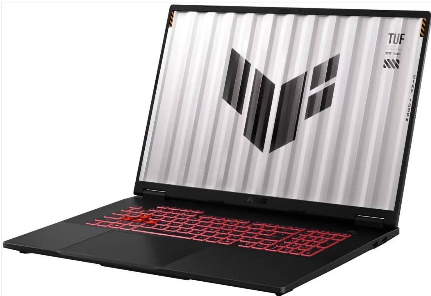
Figure 1: Front view of the ASUS TUF Gaming A18 laptop with the screen open, showcasing the keyboard and display.