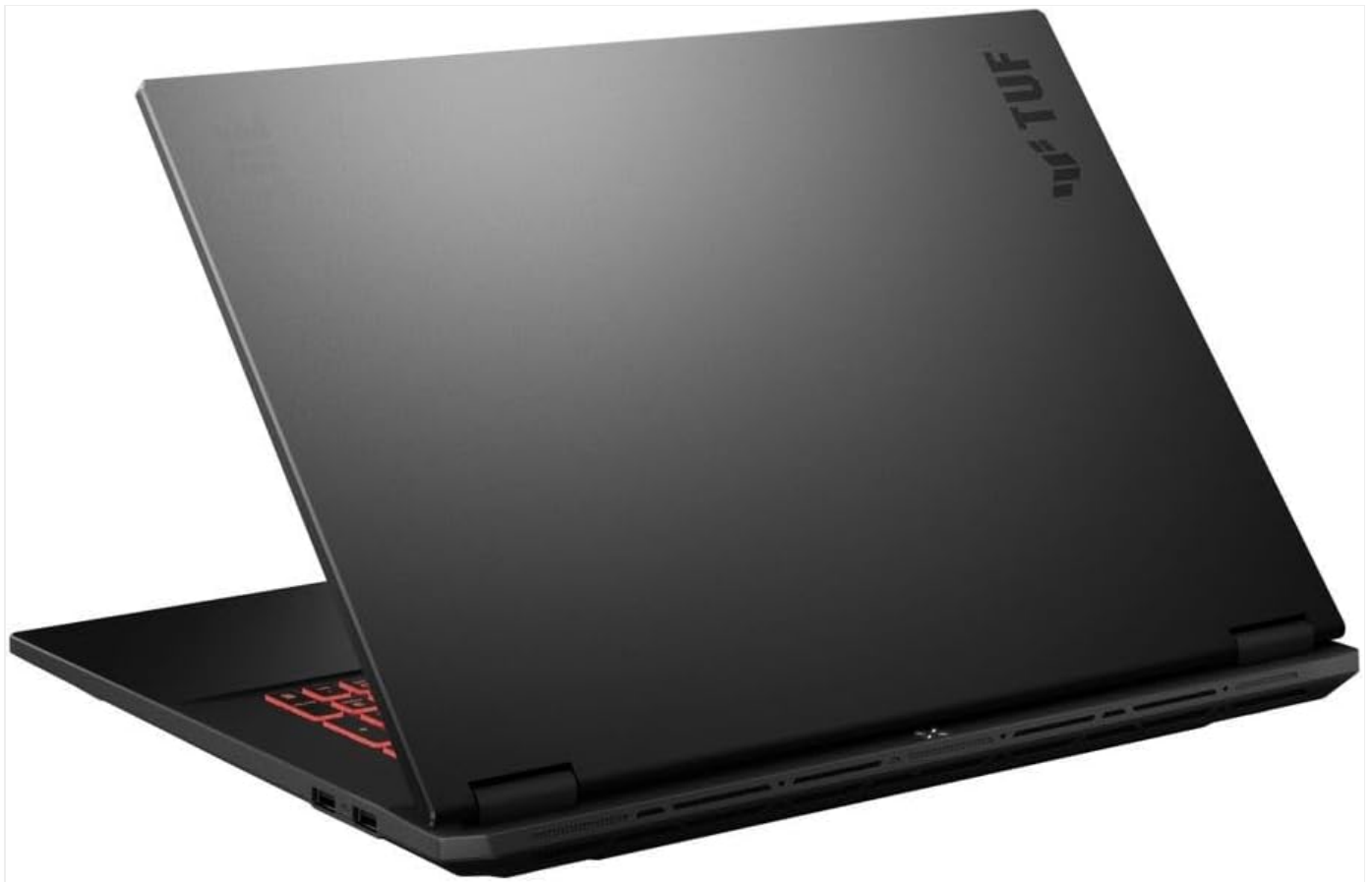
Figure 3: Rear view of the ASUS TUF Gaming A18 laptop with the lid closed, showing the chassis design.