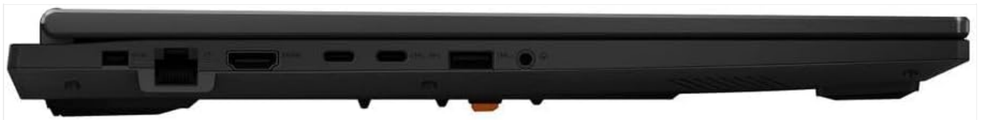
Figure 4: Left side of the laptop showing the power input, Ethernet port, HDMI, USB-C ports, and audio jack.