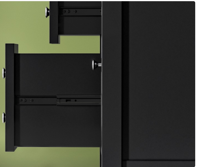
Image: Detail of silky drawer slides.

Multiple polishing and oiling results in smooth drawer slides that are silky smooth to use.