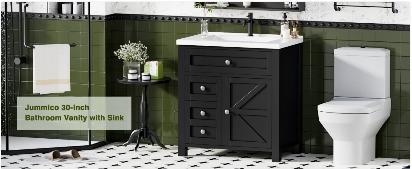
Image: Overview of vanity components and dimensions.