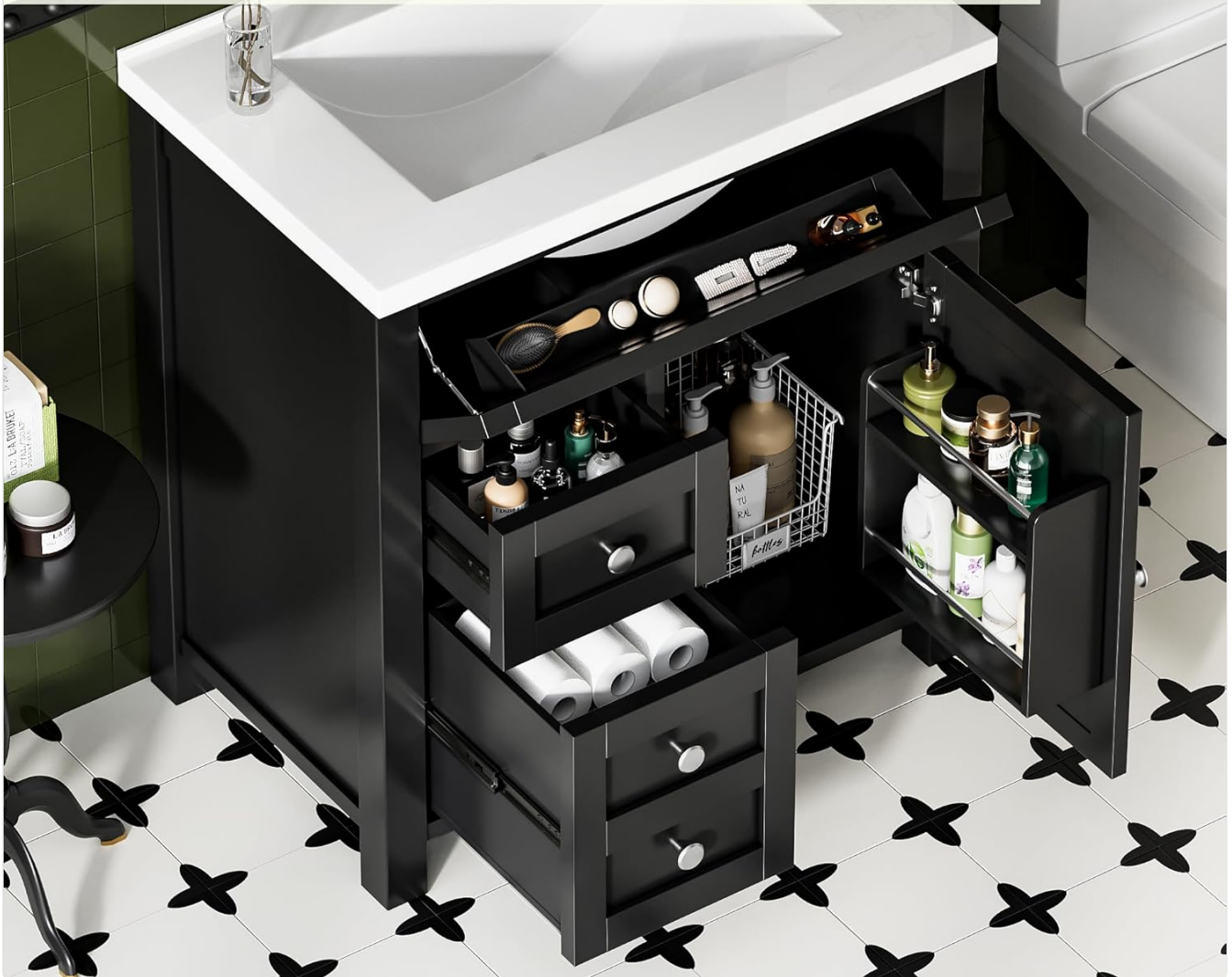
Image: Vanity with open drawers and cabinet, showcasing storage.

Ideal for organizing a wide range of bathroom items