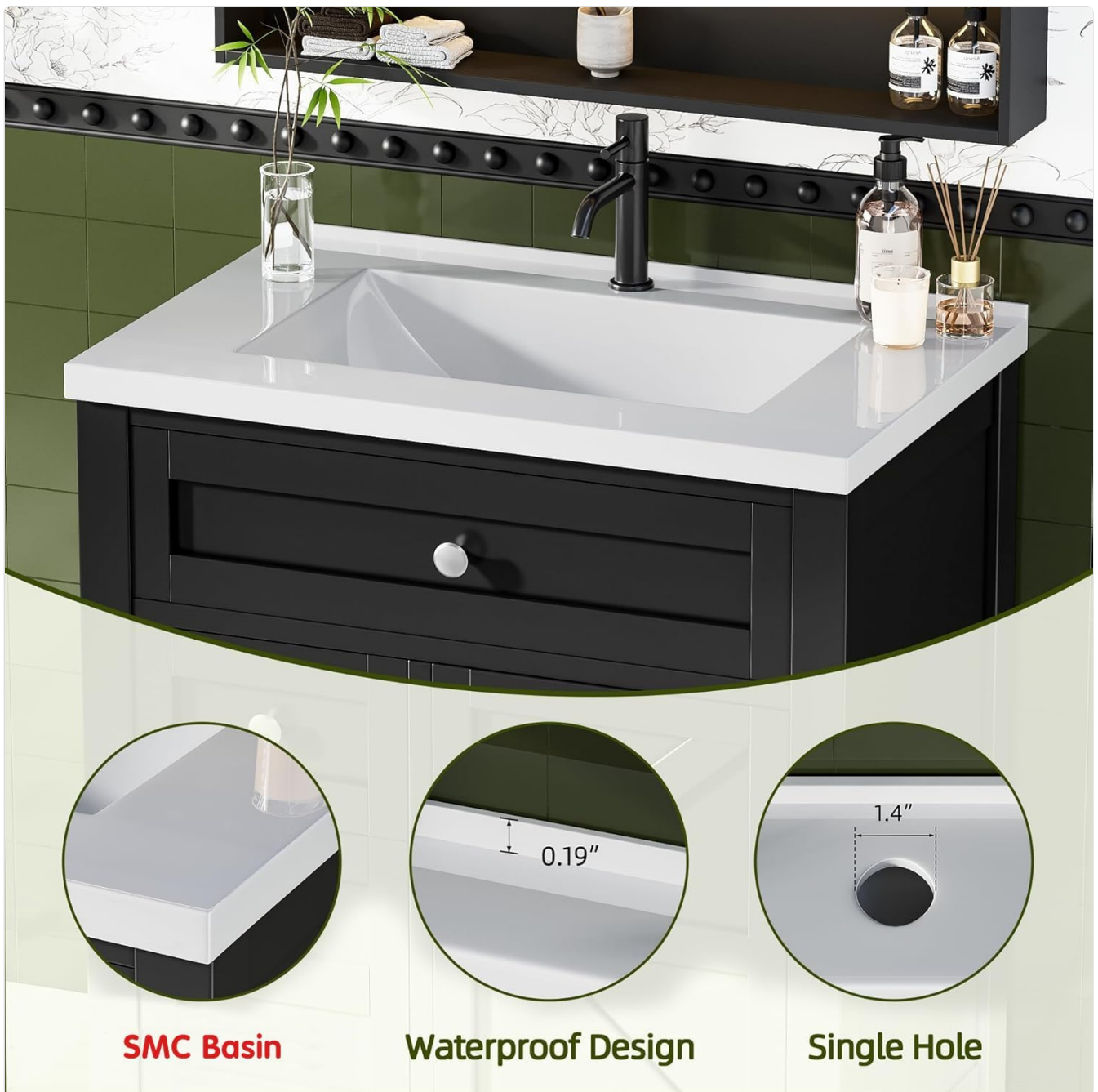
Image: SMC sink details including waterproof design and single faucet hole.