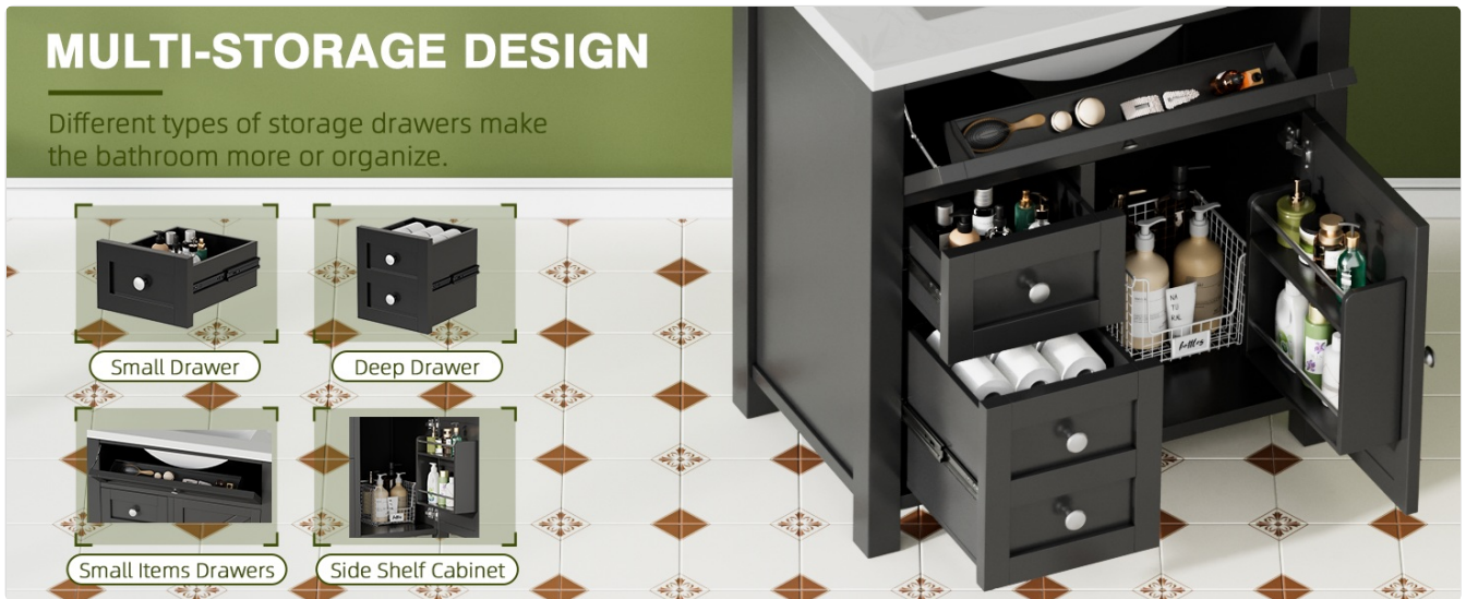
Image: Multi-storage design details.