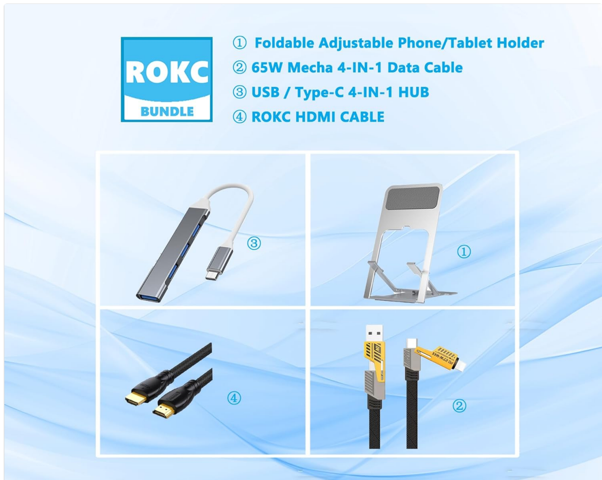
Figure 3: ROKC Exclusive Accessories Bundle.