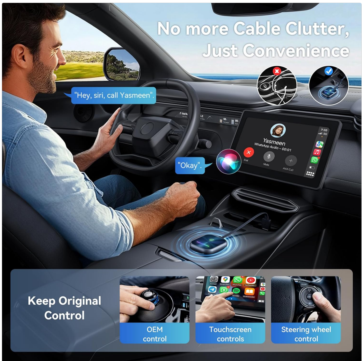
Image: A driver interacting with the car's display using OEM controls, touchscreen, and steering wheel buttons, enabled by the wireless adapter.