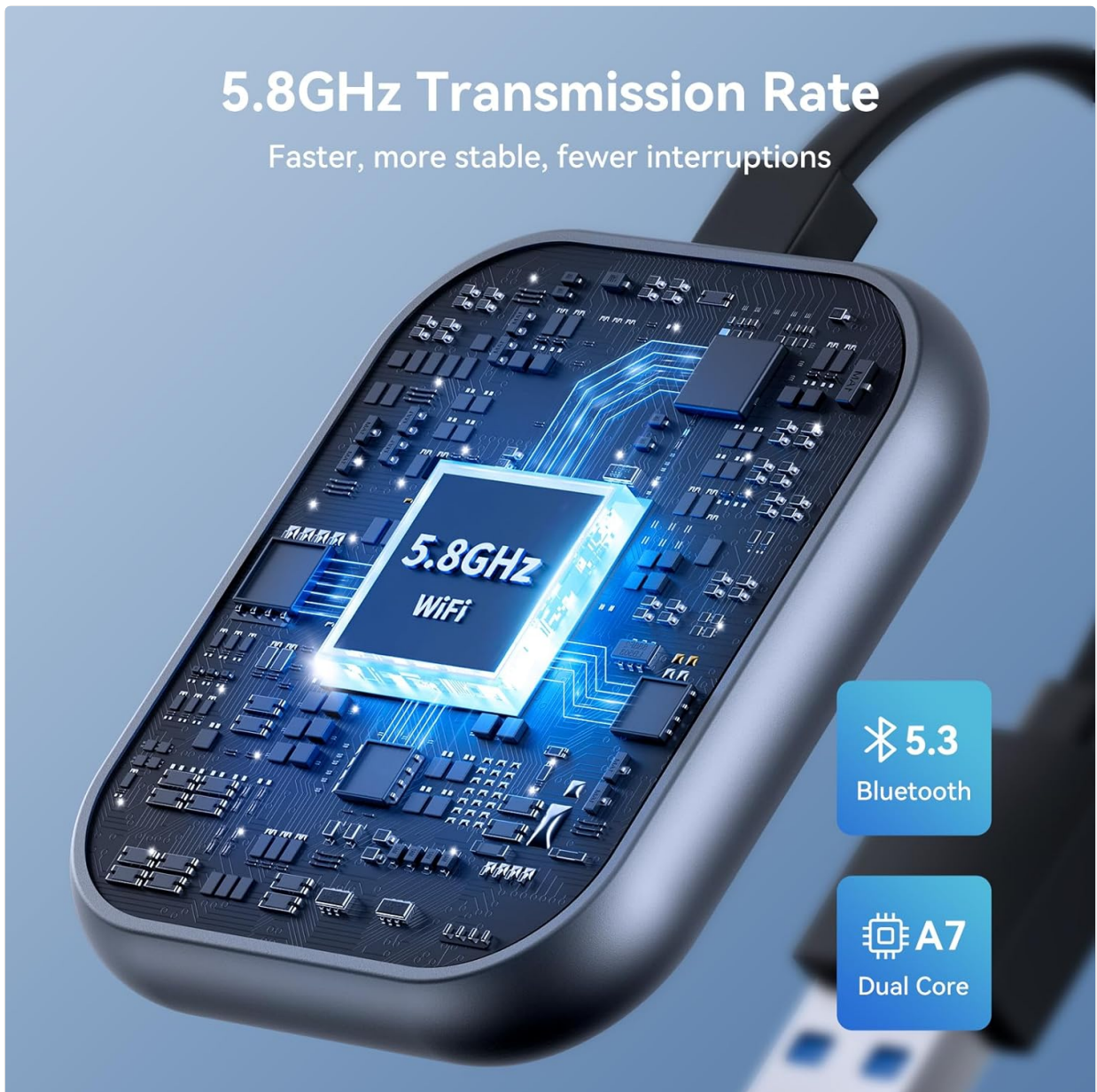
Image: A close-up view of the adapter's internal components, highlighting the 5.8GHz WiFi and Bluetooth 5.3 capabilities for stable transmission.