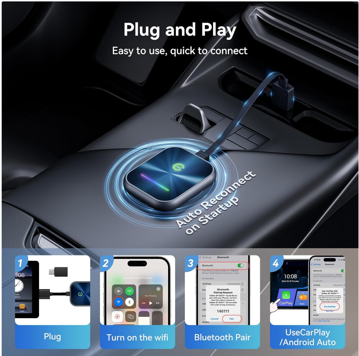
Image: A visual guide illustrating the simple plug-and-play setup process for the adapter.

Bluetooth and Wi-Fi are active on your phone.