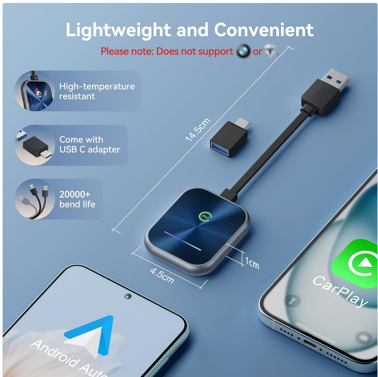
Image: The compact size of the KUKIHO adapter, highlighting its dimensions and included USB-C adapter.