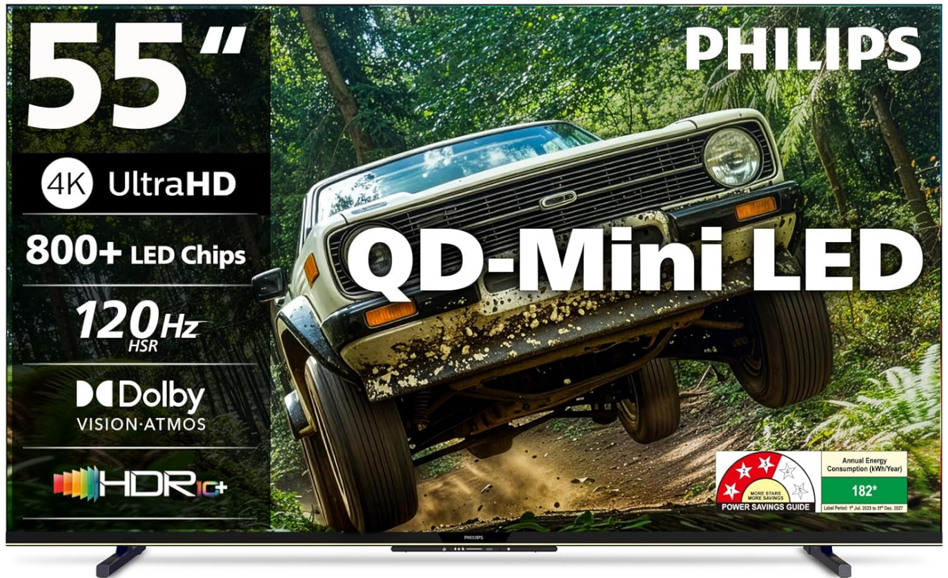
Front view of the Philips 55MLED610/94 55-inch 4K QD-Mini LED Google TV.