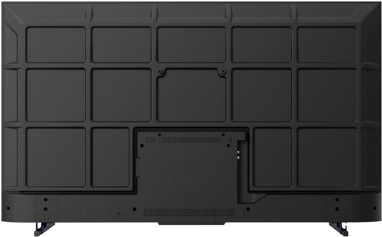
Illustration showing the TV unit and its included accessories for setup.