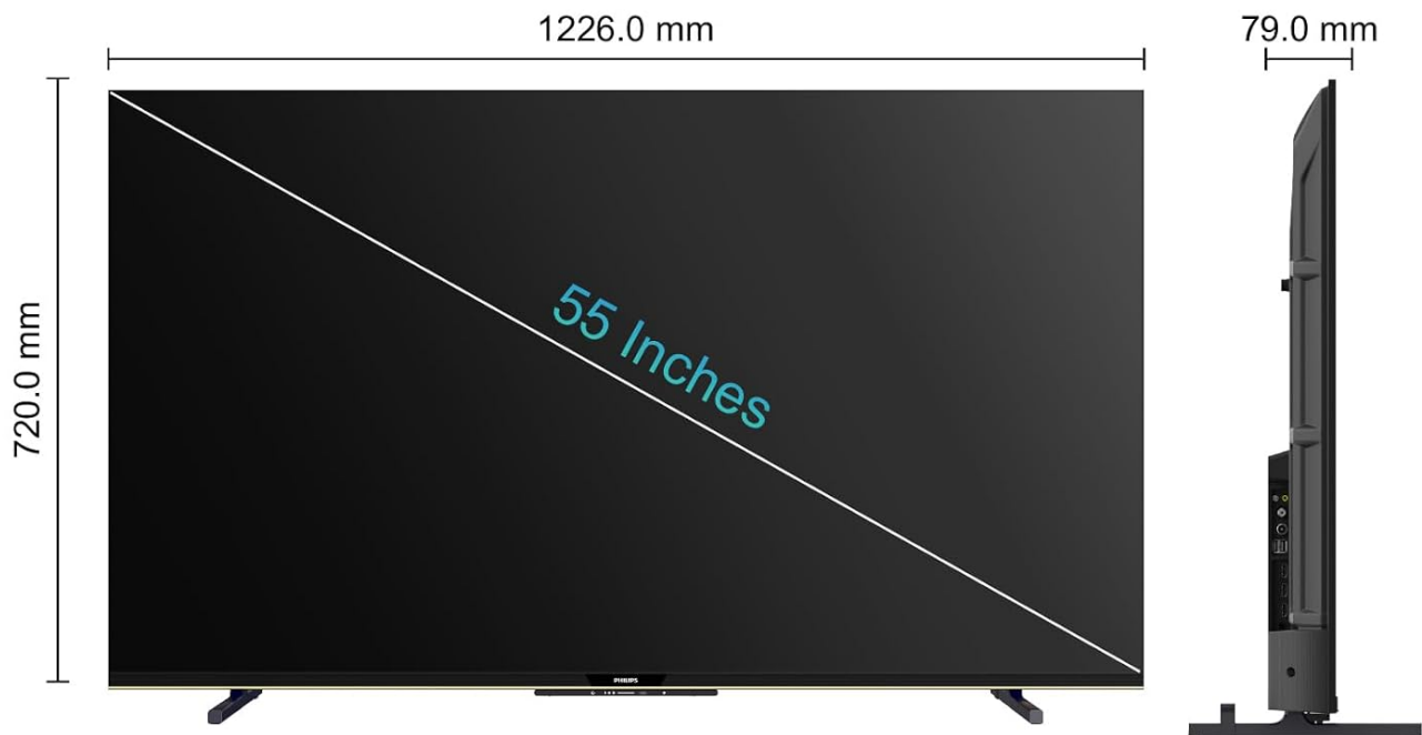
Dimensional drawing of the Philips 55MLED610/94 TV, showing height, width, and depth measurements.