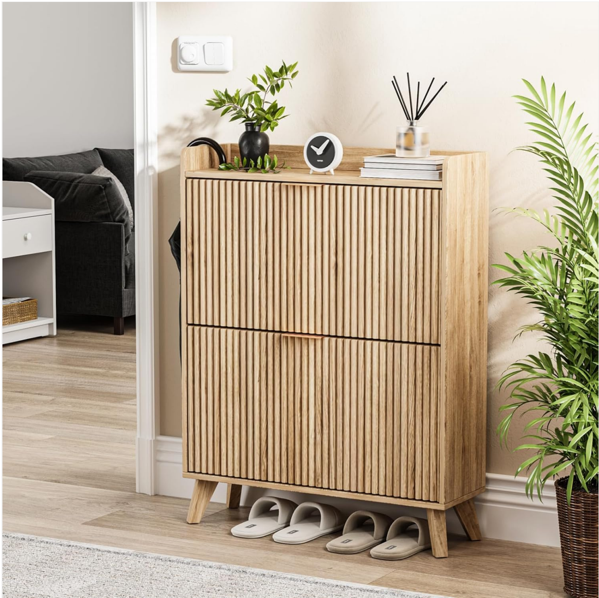
Image 1.1: The DAMCROP Fluted Shoe Cabinet in a typical entryway setting.