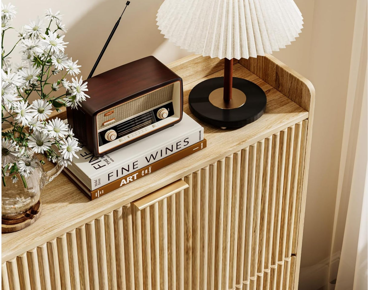
Image 4.3: The anti-drop shield countertop in use with various items.

Place decorations or objects such as potted plants keys and bags