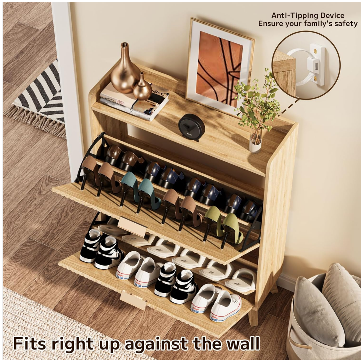
Image 2.1: Illustration of the anti-tipping device securely attaching the cabinet to the wall.