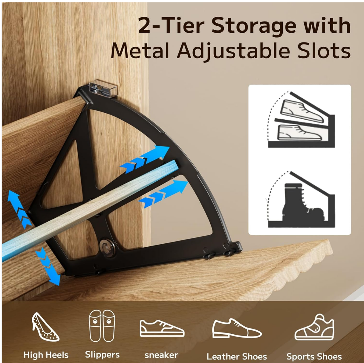
Image 4.2: Visual guide for storing various shoe types within the 2-tier system.