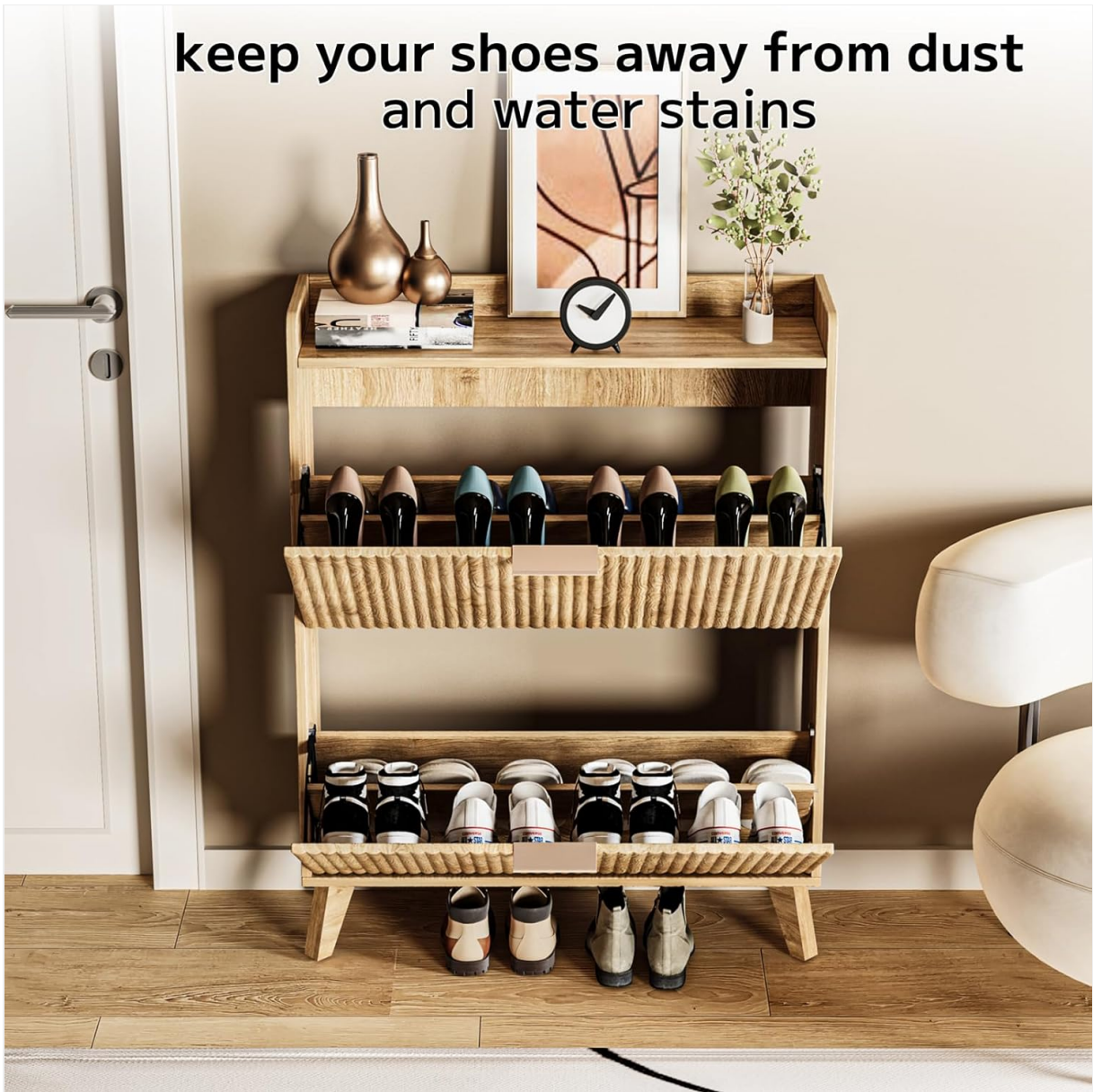
Image 5.1: The cabinet's design helps protect shoes from dust and water.