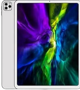
For iPad Pro 11 2020 ✓ (2nd Gen) A2228/ A2068/ A2230/ A2231