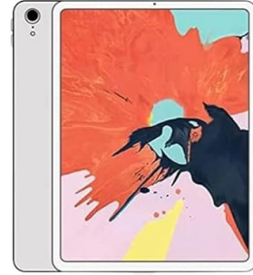
For iPad Pro 11 2018 ✓ (1st Gen) A1980/ A2013/ A1934/ A1979

Image: Visual guide to compatible iPad models, including iPad Air 11-inch (M2) 2024, iPad Air 10.9 2022 (5th Gen), iPad Air 10.9 2020 (4th Gen), iPad Pro 11 2022 (4th Gen), iPad Pro 11 2021 (3rd Gen), iPad Pro 11 2020 (2nd Gen), and iPad Pro 11 2018 (1st Gen).