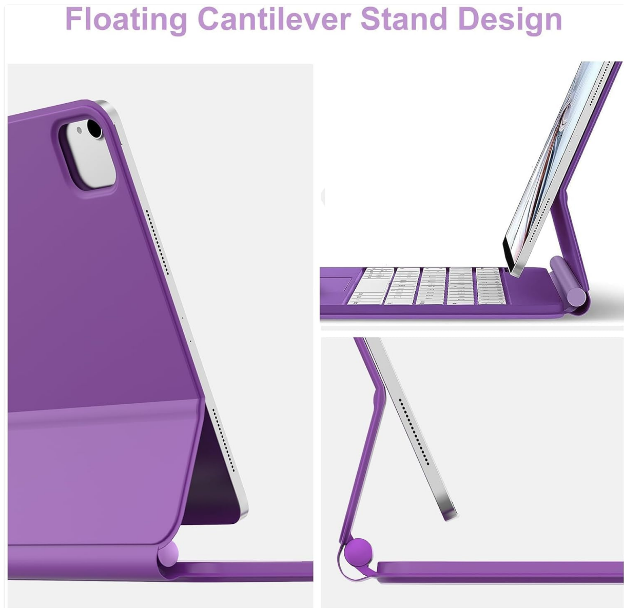
Image: Multiple views of the floating cantilever stand, highlighting its design and adjustable angles for optimal viewing.

The ergonomic floating cantilever stand allows for adjustable viewing angles up to 135°. Adjust the iPad to your preferred tilt angle for comfortable use. Opening or closing the case will automatically wake or sleep your iPad.