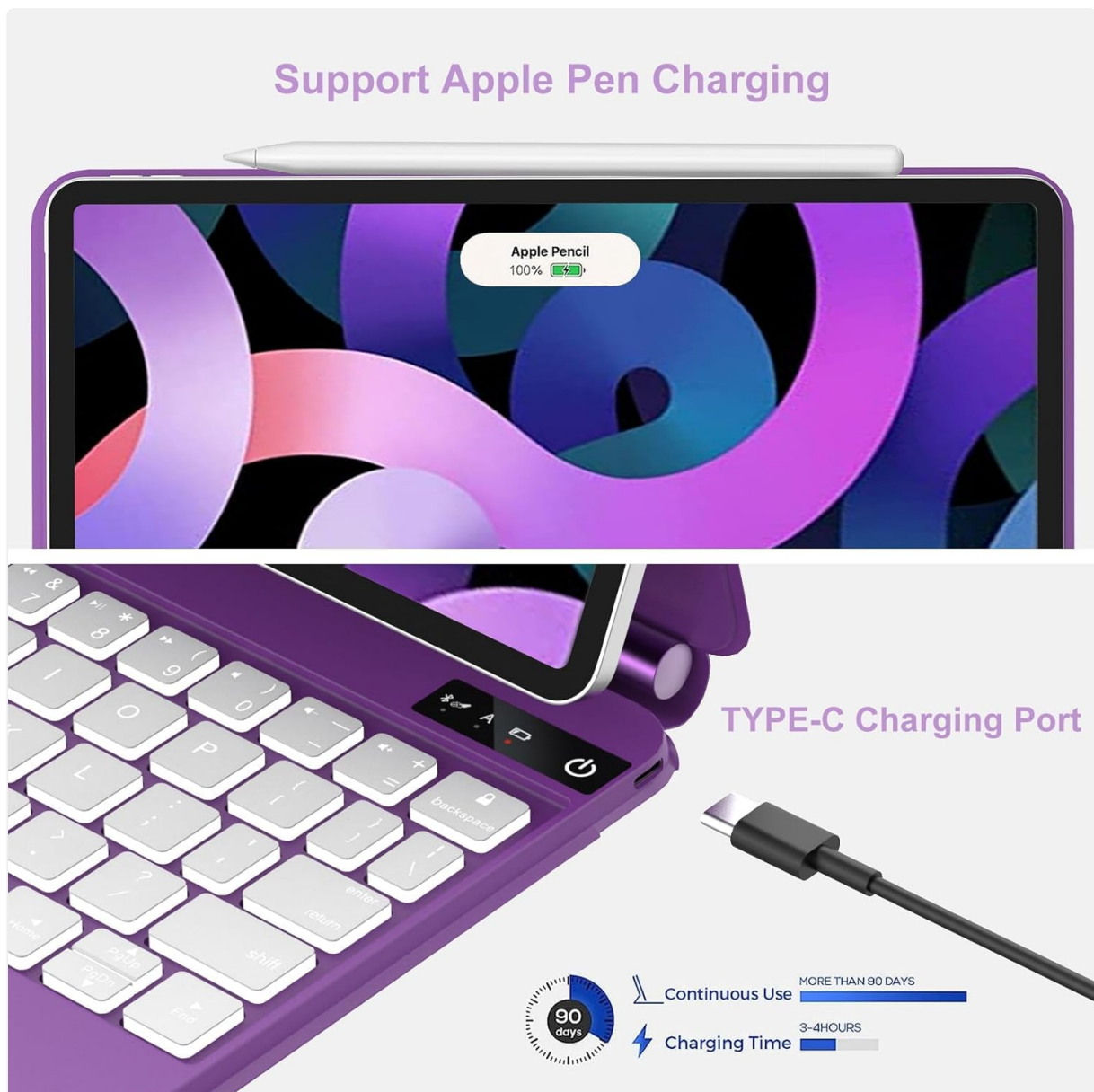
Image: Depicts the magnetic charging area for an Apple Pencil on the iPad's side and the Type-C charging port for the keyboard, along with battery life indicators.

The case design supports Apple Pencil charging. Place your Apple Pencil on the designated magnetic strip on your iPad while it is in the case to charge it wirelessly.