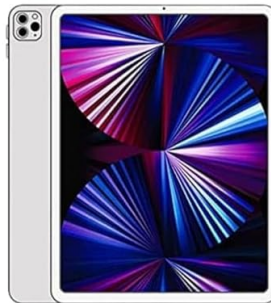
For iPad Pro 11 2021 ✓ (3rd Gen) A2301/A2456/ A2460