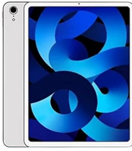
For iPad Air 10.9 2022 (5th Gen)/ ✓ iPad Air 10.9 2020 (4thGen) A2072/ A2316/A2324/A2325