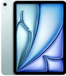
For iPad Air 11-inch ✓ (M2) 2024