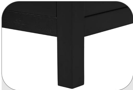
Solid Wood Frame

(Clean design fits modern spaces with refined elegance.)