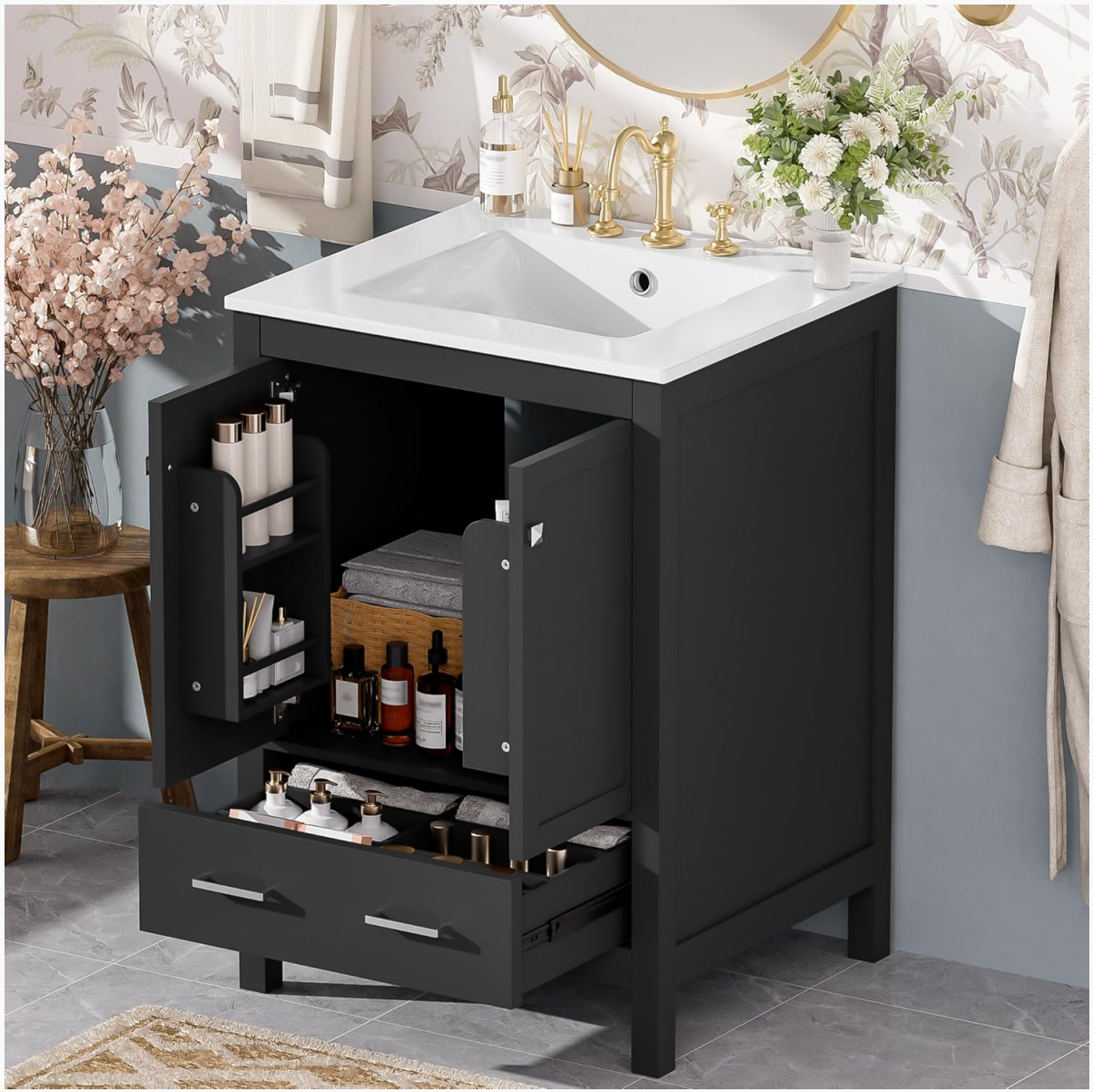
Image showing the vanity with its doors and drawer open, highlighting the internal storage compartments and the soft-close mechanisms.