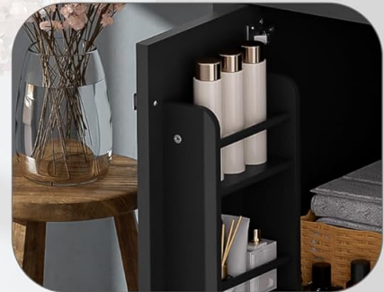
Soft-Close Cabinet Doors