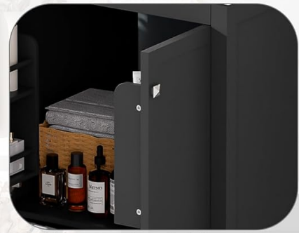
Spacious Under-Cabinet Area