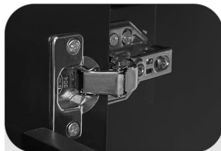
Soft-Close Door Hinges

Close-up images detailing the solid wood frame, painted finish, silver zinc alloy handle, and soft-close door hinges.