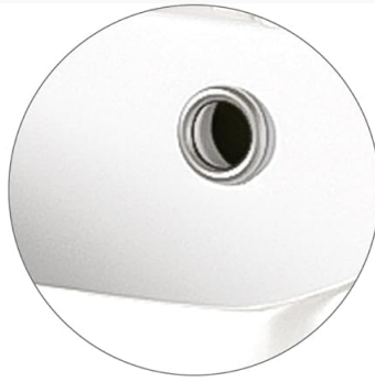
Overflow Hole for Added Protection and Peace of Mind