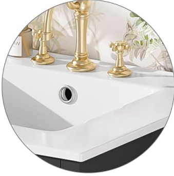
Low-Maintenance Ceramic Sink