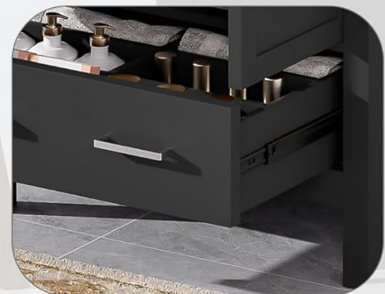
Smooth, Durable Sliding Mechanism

Detailed diagram showing the overall dimensions of the vanity, including cabinet, sink, and drawer measurements.