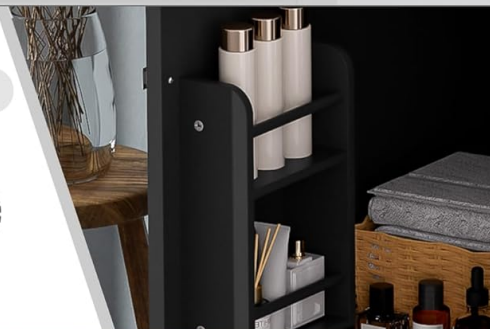
Image illustrating the various storage options: under-sink space, standard drawer with divider, and double-layer door storage shelves.