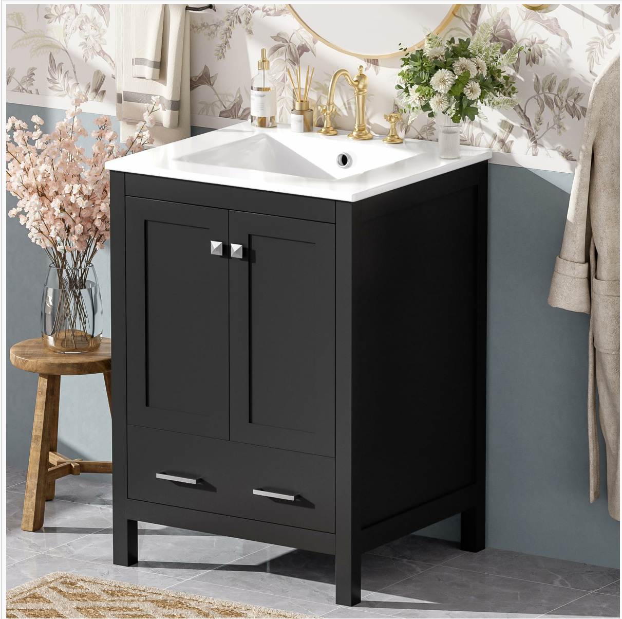
Image of the assembled GDFStudio 24-inch bathroom vanity with ceramic sink.