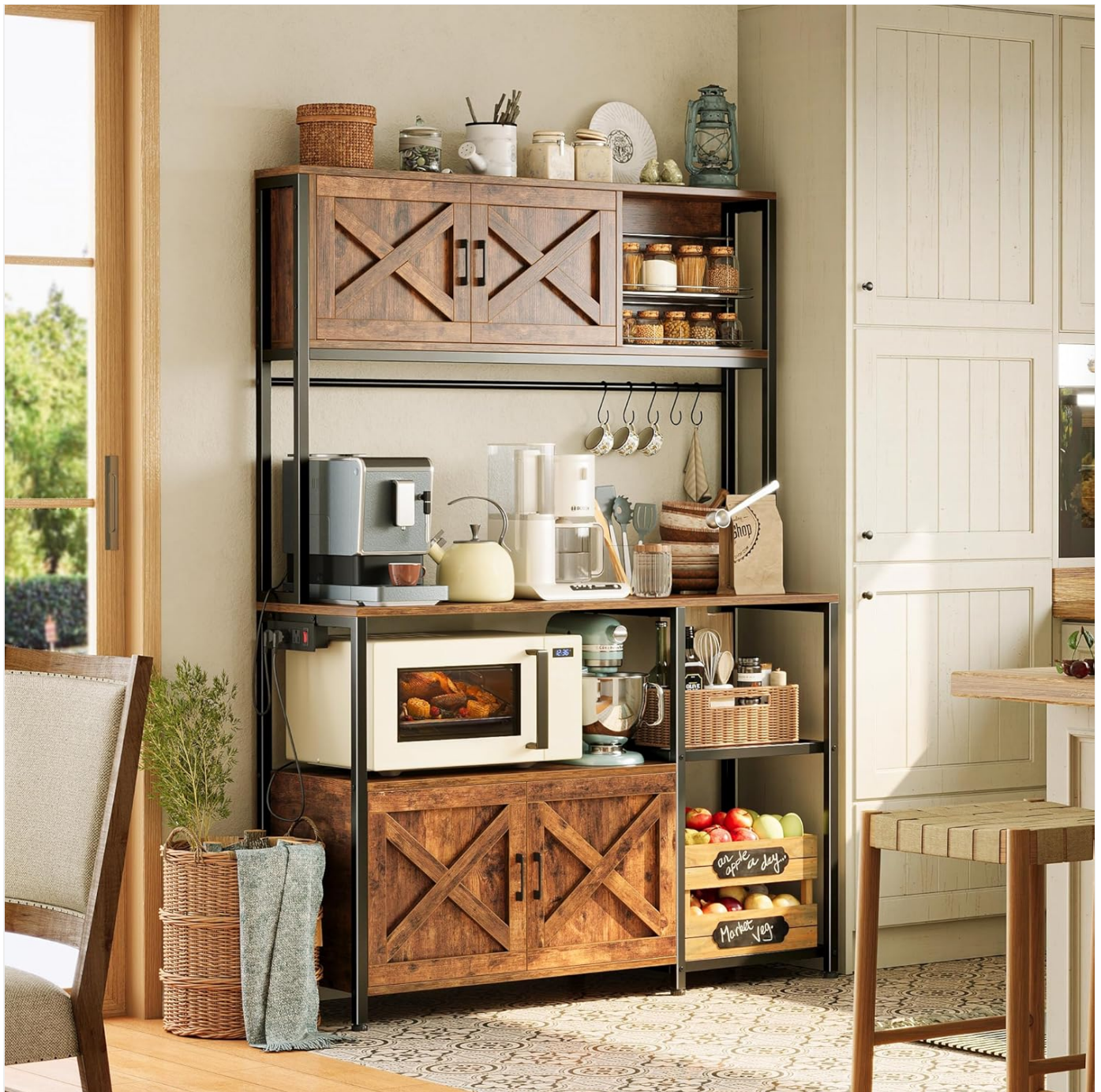
Image: The Huuger Large Bakers Rack, showcasing its various storage compartments and integrated power outlet, set up in a kitchen environment.