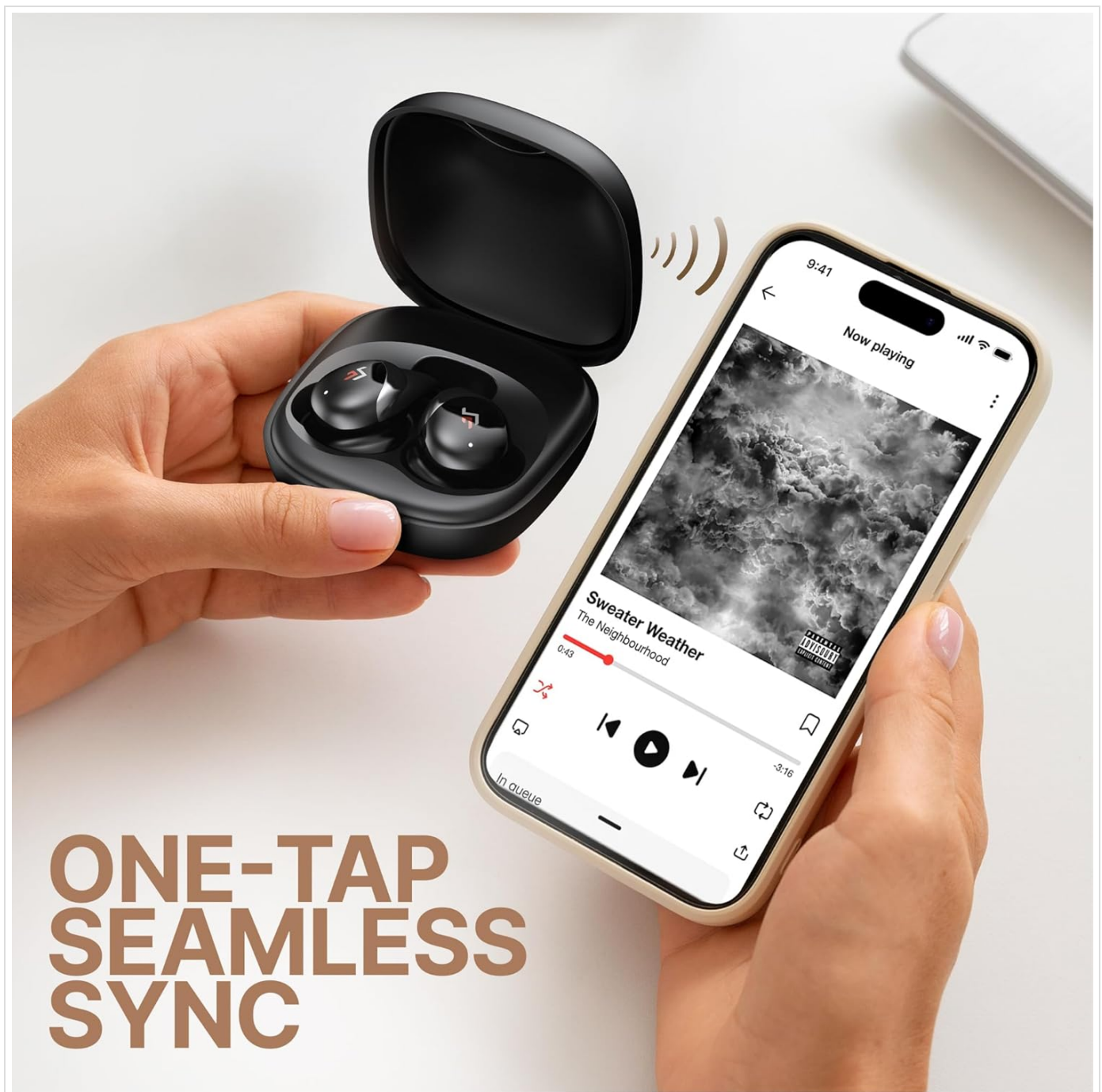
Image: A pair of CrossBeats Hertz Ear Buds in their charging case, positioned next to a smartphone playing music, demonstrating the one-tap seamless synchronization feature.