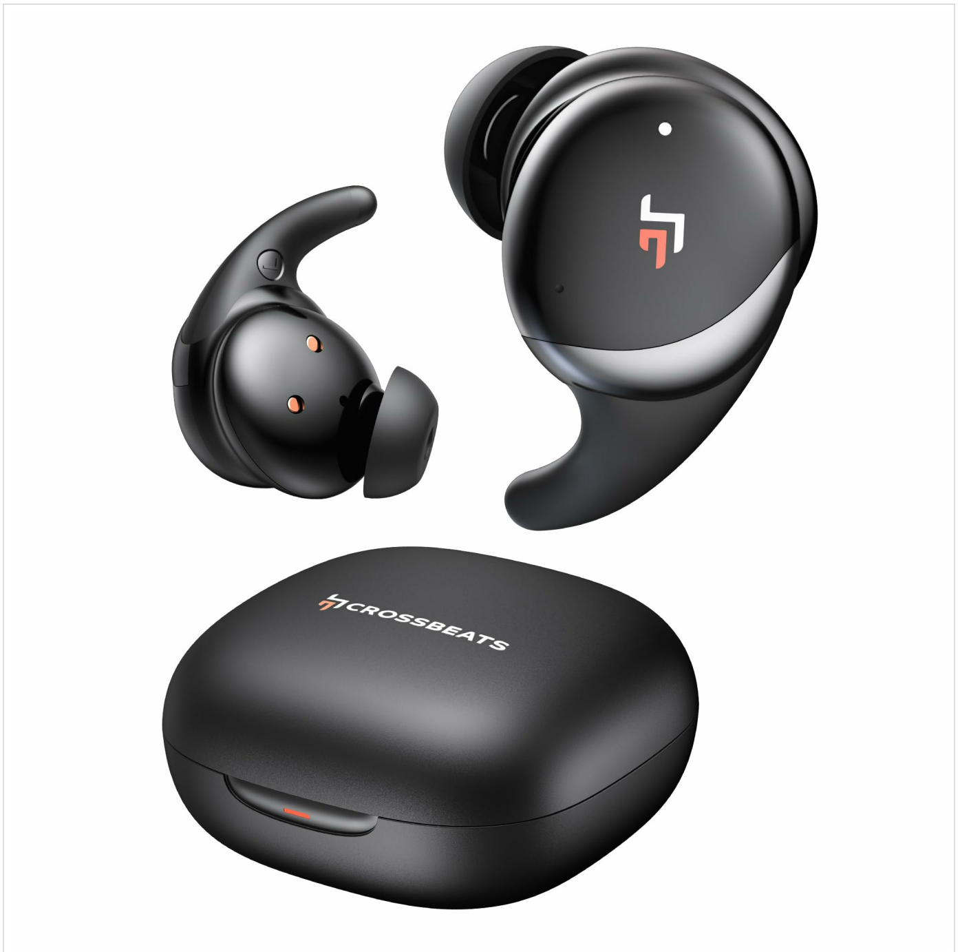
Image: The CrossBeats Hertz Ear Buds in their open charging case, highlighting the 60-hour playtime and SnapCharge fast charging capability.