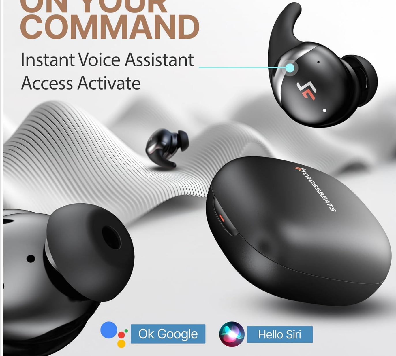
Image: Contents of the CrossBeats Hertz package, including the earbuds, charging case, and various ear tips.