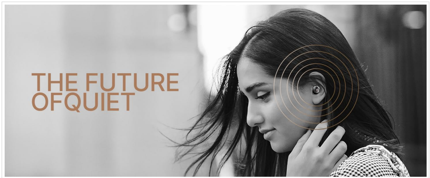
Image: Diagram illustrating key features of the CrossBeats Hertz Ear Buds, including AI ANC+ENC, touch controls, 60-hour playtime, titanium drivers, Hall Switch, and 3D surround sound.