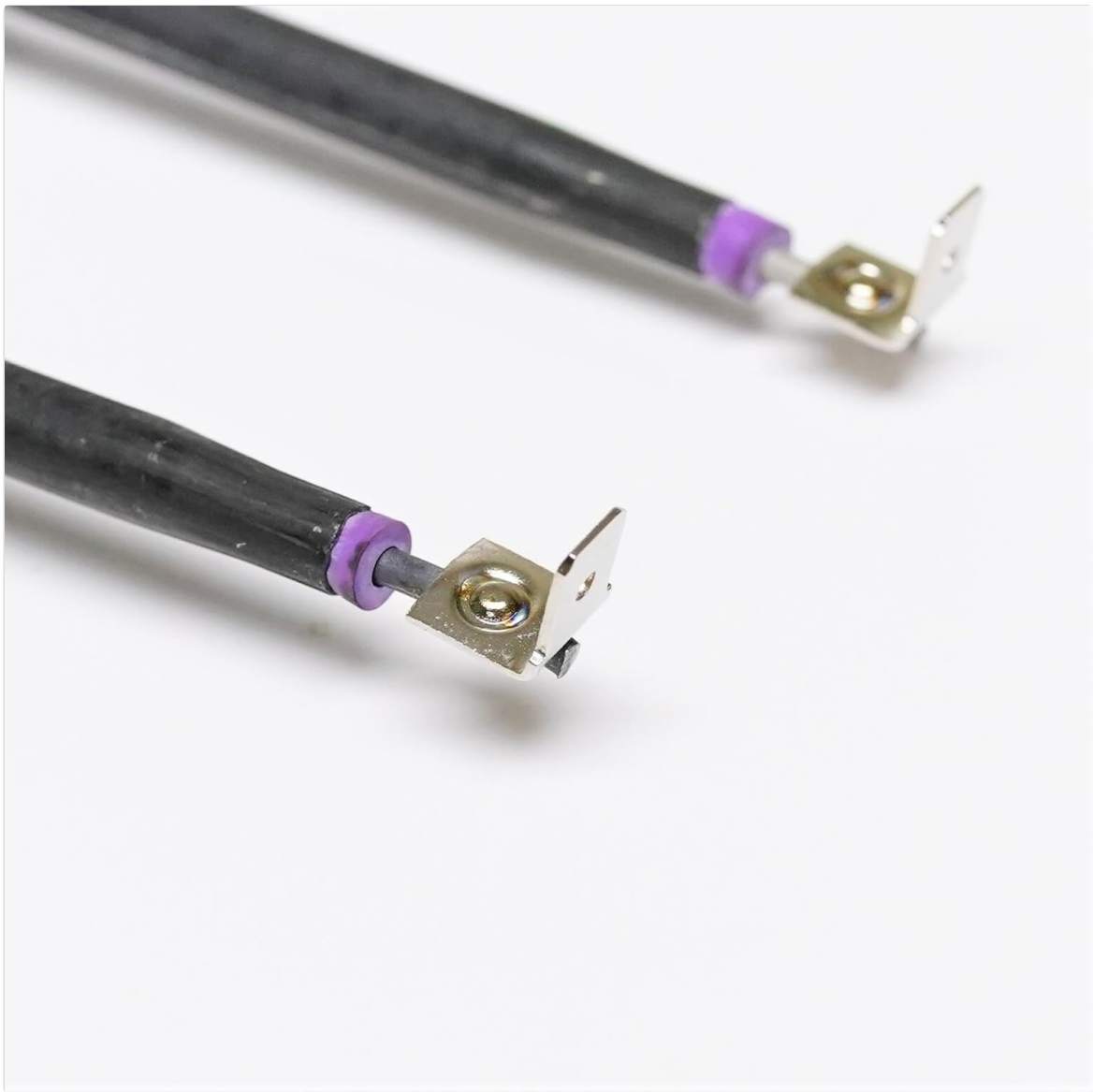
Image 2: Close-up view of the element terminals, showing the connection points for electrical wiring.