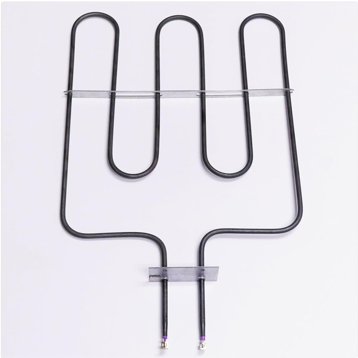
Image 1 : Full view of the Range Oven Broil Unit Heating Element, showing its coiled design and terminal connections.