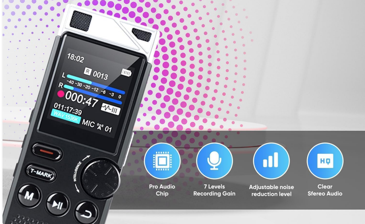
Image 1: Front view of the Wucotc Digital Voice Recorder, highlighting its screen and control buttons.

High-sensitivity microphones with professional recording chip capture 1536Kbps premium quality sound