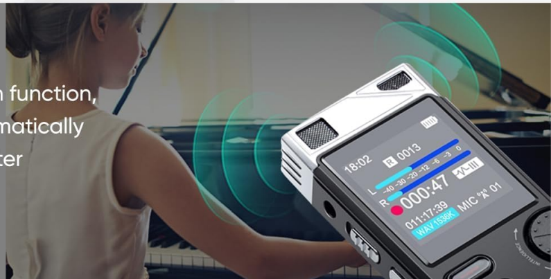
Image 6: The Wucotc Digital Voice Recorder demonstrating its 360-degree remote zoom recording and Automatic Gain Control (AGC) features for optimal sound capture.

Turn on the automatic gain function, and the machine will automatically balance and maintain better sound quality.