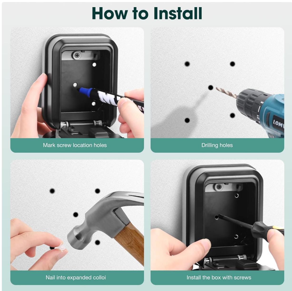
Image: A four-panel illustration showing the process of marking holes, drilling, inserting wall anchors, and screwing the lock box into the wall.

To securely mount your lock box, follow these steps: