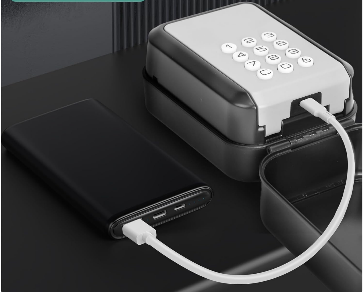
Image: The lock box features a USB-C port for emergency unlocking, allowing it to be powered by an external power bank if the internal AAA batteries are depleted.