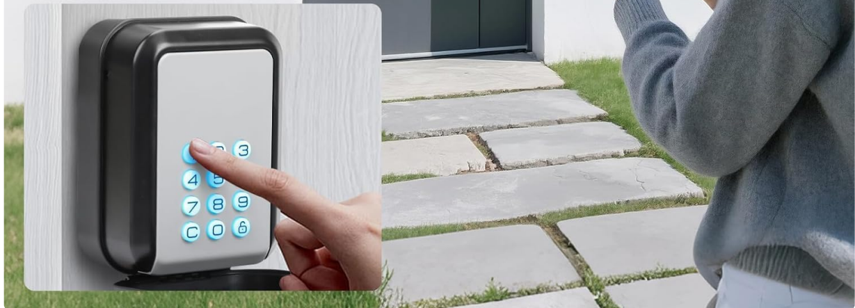
Image: The smart key box features both Bluetooth connectivity for app control and a physical PIN pad for direct code entry.

Create and share unique access codes with your guests