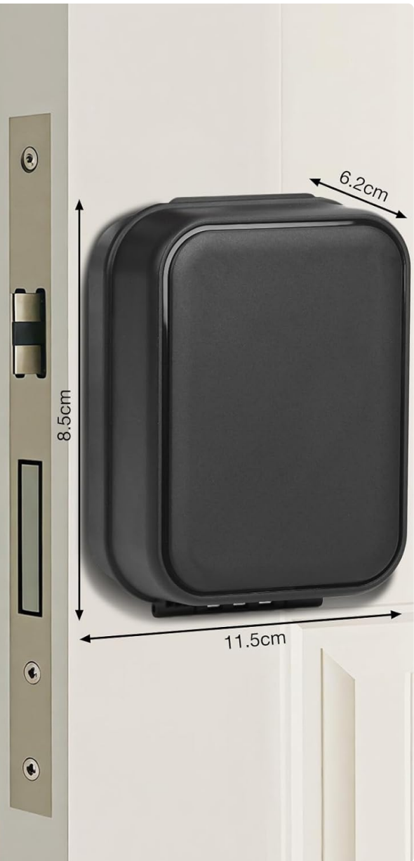
Image: The Thlevel Smart Key Lock Box, illustrating its internal storage capacity for car keys, house keys, cards, and cash, along with external dimensions.