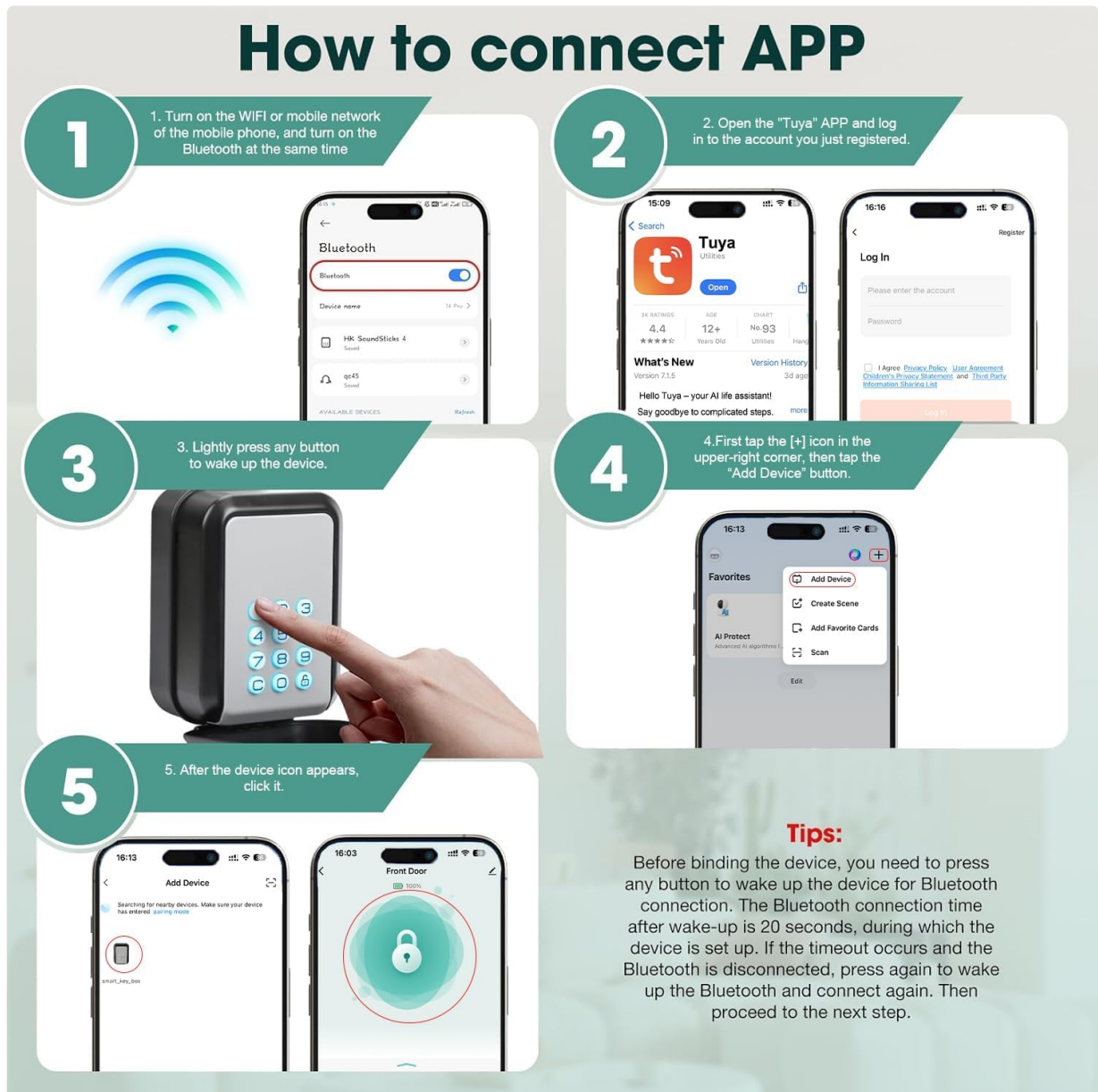
Image: A visual guide demonstrating the five steps to connect the lock box to the Tuya App, including enabling Bluetooth and adding the device.

To connect your lock box to the Tuya App, follow these instructions: