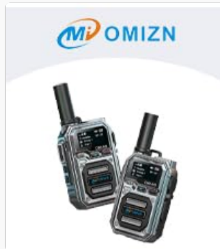
Image: A visual representation of all items included in the OMIZN GT5 Watch Walkie Talkie package.