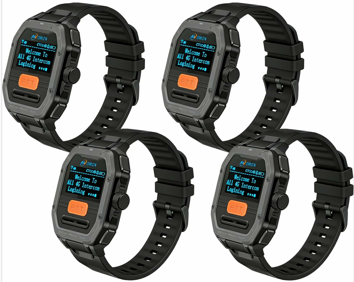
Image: The OMIZN GT5 Watch Walkie Talkie worn on a wrist, showcasing its 1.3-inch OLED screen with login information. The watch is compact and lightweight.