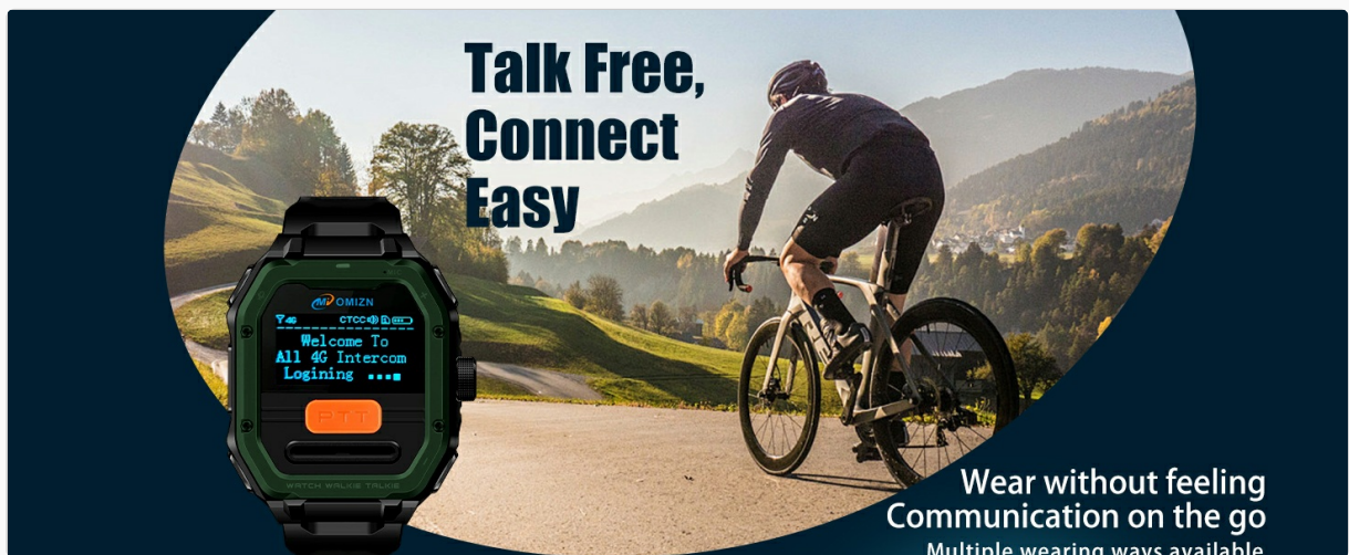
Image: An overview of the OMIZN GT5 Watch Walkie Talkie, highlighting its global unlimited-range intercom capability and 1.3-inch OLED screen.