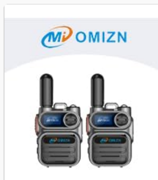
Image: This image highlights the GT5's built-in VOX, 1200mAh battery, and its operational temperature range from -20°C to 60°C, indicating durability in various environments.