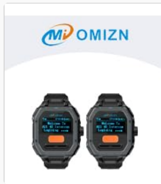
Image: A close-up of the GT5 screen, indicating its user-friendly interface for communication.

The GT5 supports both group and private one-to-one calls. Group conversations are heard by all members in the designated group, while private calls are heard only by the selected contact. Specific instructions for switching between call types or initiating private calls can be found in the device's on-screen menu.