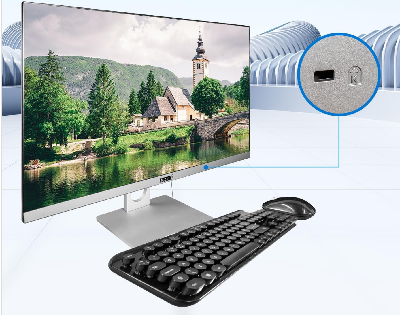
Image: Detail of the Kensington Security Slot located on the PC, designed for physical security.

Ergonomic wireless keyboard and mouse + Kensington security slot for a sleek, tidy, and secure setup