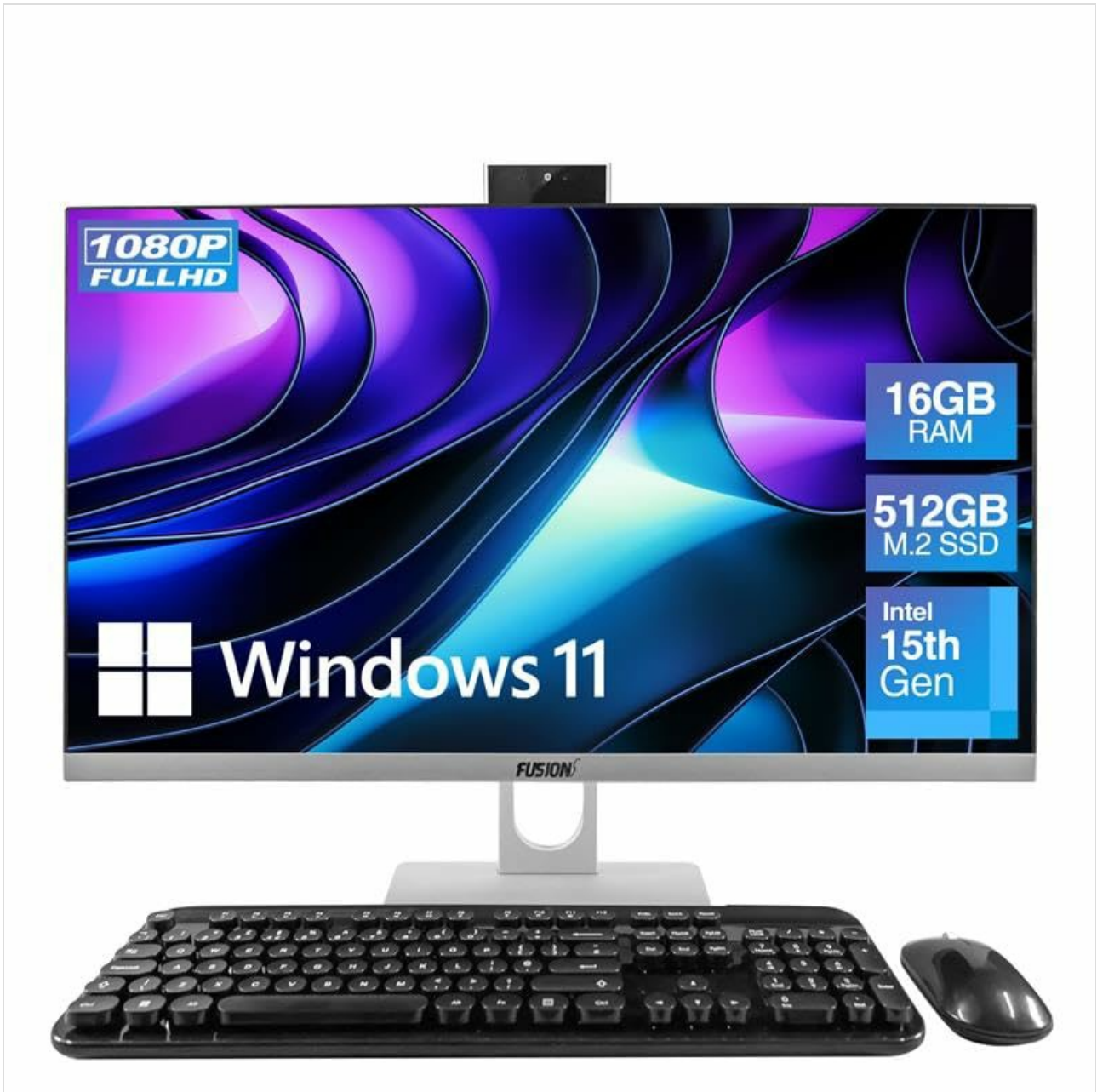
Image: The Fusion5 A7 N6 All-in-One PC with its included wireless keyboard and mouse, ready for setup.