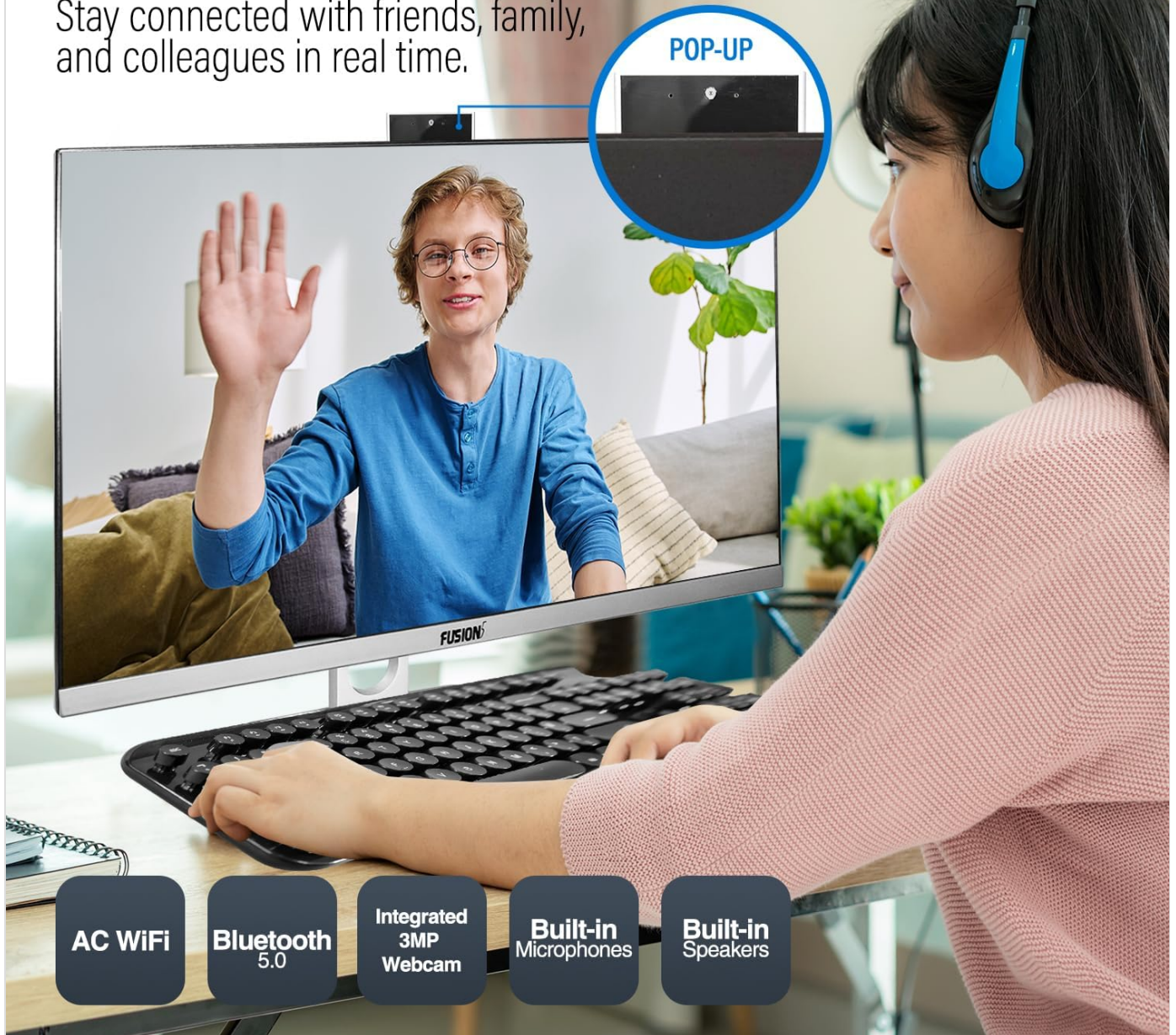
Image: Illustration of the PC's integrated 3MP pop-up webcam, built-in microphones, and speakers, demonstrating its use for video calls.

Stay connected with friends, family, and colleagues in real time.