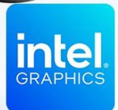
Image: Visual representation of the PC's core components: Intel N150 processor, 16GB RAM, 512GB M.2 SSD, and Windows 11 operating system.