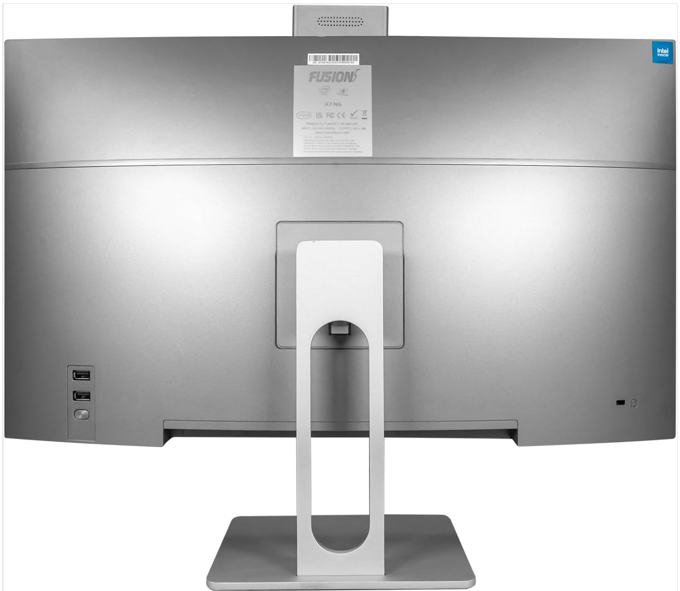
Image: Rear view of the Fusion5 A7 N6 All-in-One PC, displaying the arrangement of its various ports.