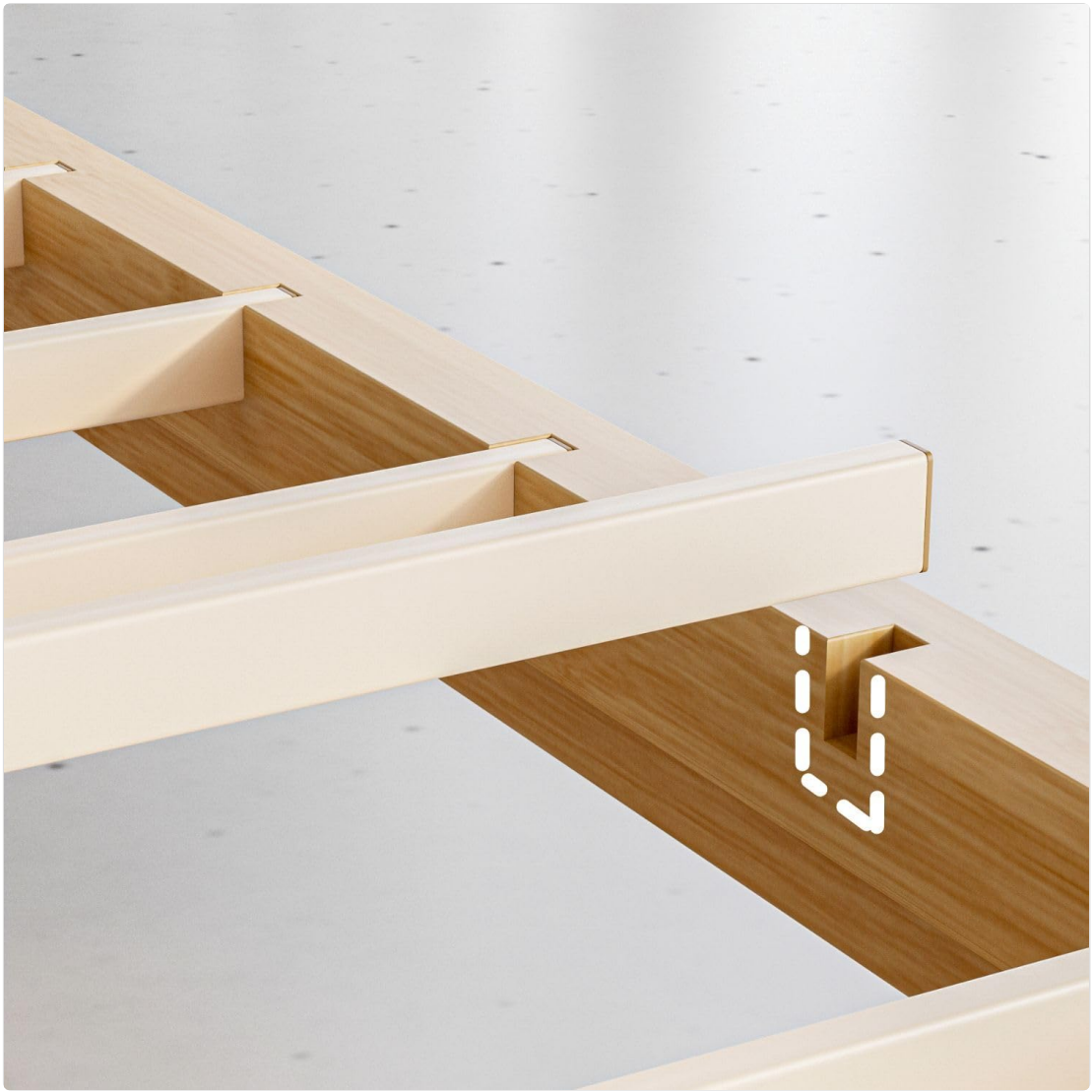
Image: Detail of the robust metal bed base structure.