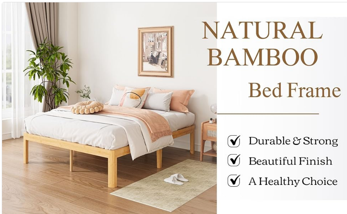
Image: ZIYOO Natural Bamboo Bed Frame highlighting its durability, beautiful finish, and healthy choice aspects.

Thank you for choosing the ZIYOO 18 Inch Twin Bamboo Platform Bed Frame. This bed frame is crafted from natural bamboo wood, offering a minimalist design with heavy-duty support. It is designed for easy assembly and does not require a box spring. This manual provides detailed instructions for assembly, usage, maintenance, and important safety information to ensure proper and safe use of your new bed frame.