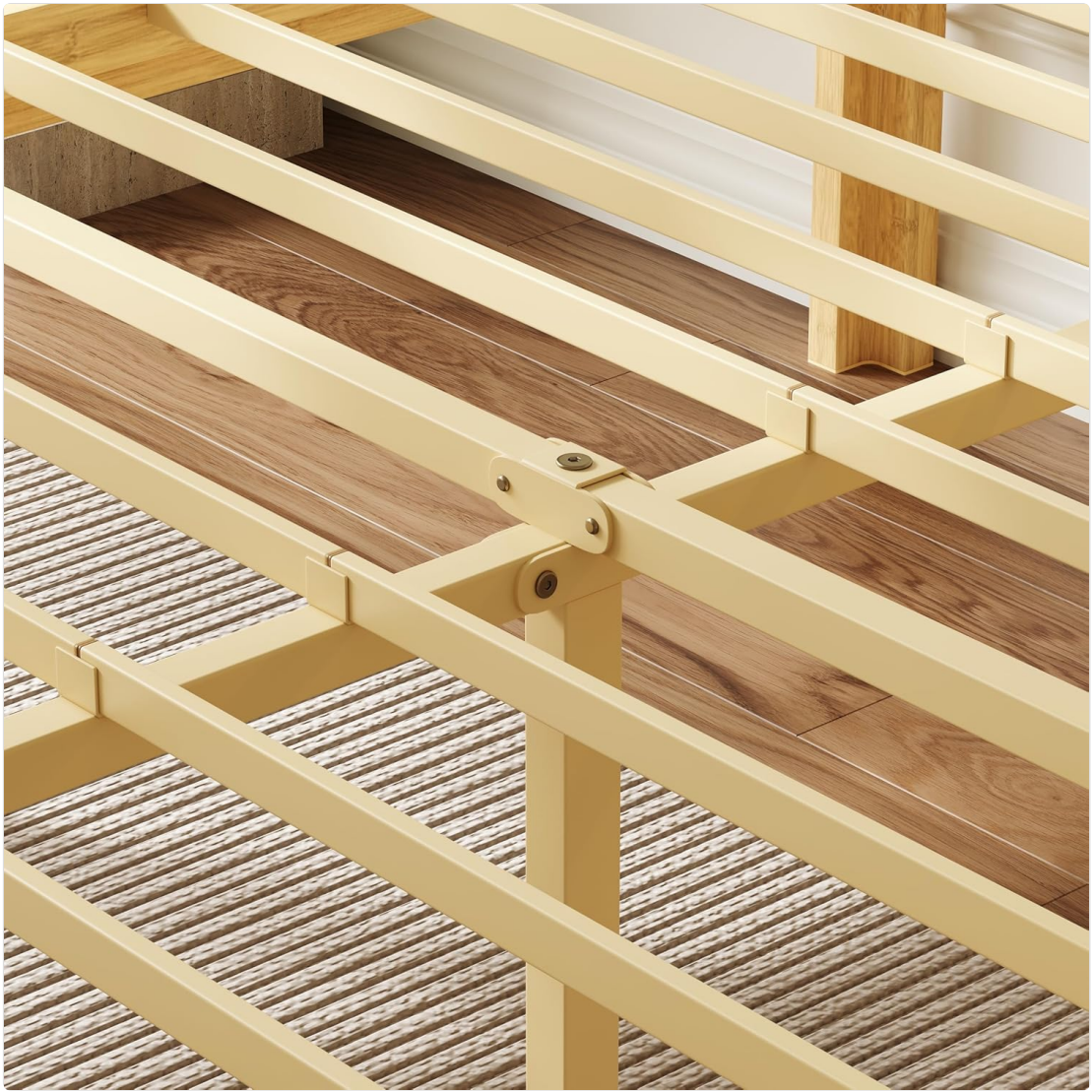
Image: Illustration of slat insertion into the bed frame.