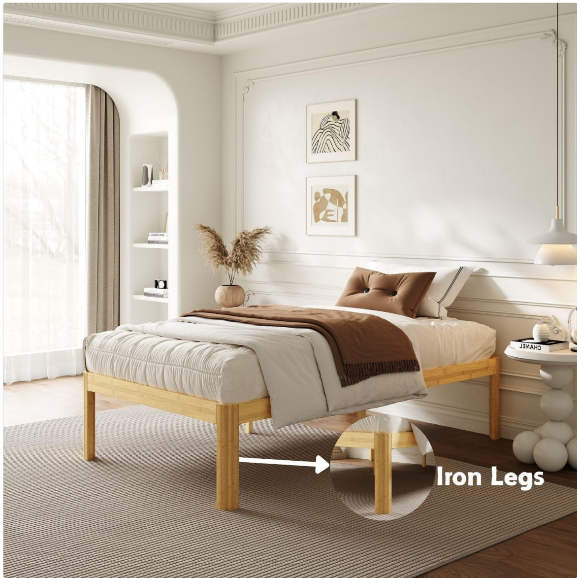
Image: Fully assembled ZIYOO bamboo bed frame in a bedroom.