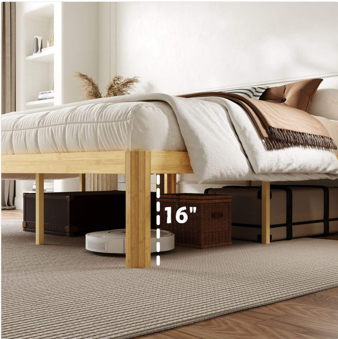
Image: Under-bed clearance demonstrating storage potential.