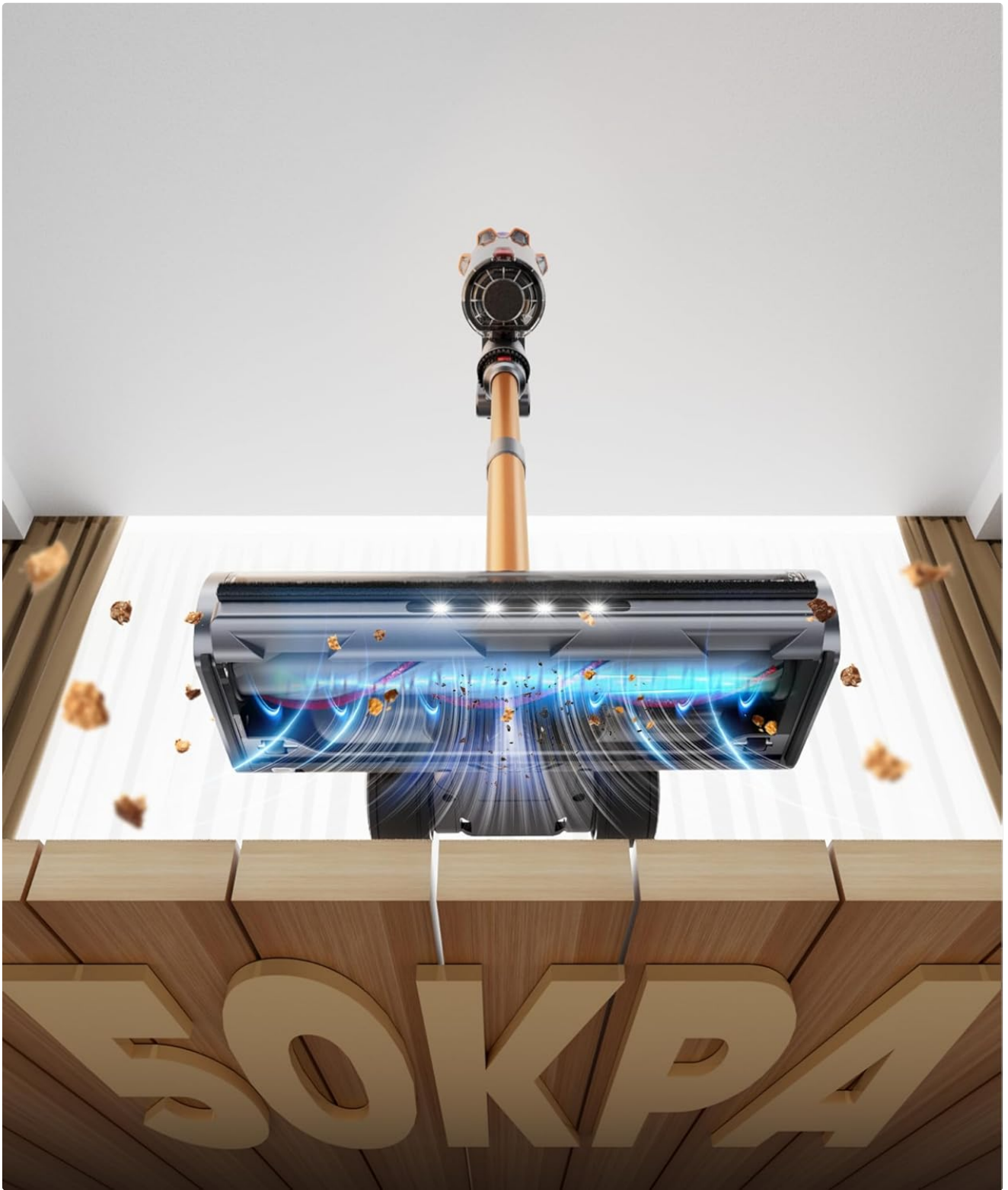
Figure 7: Powerful suction capability of the vacuum.