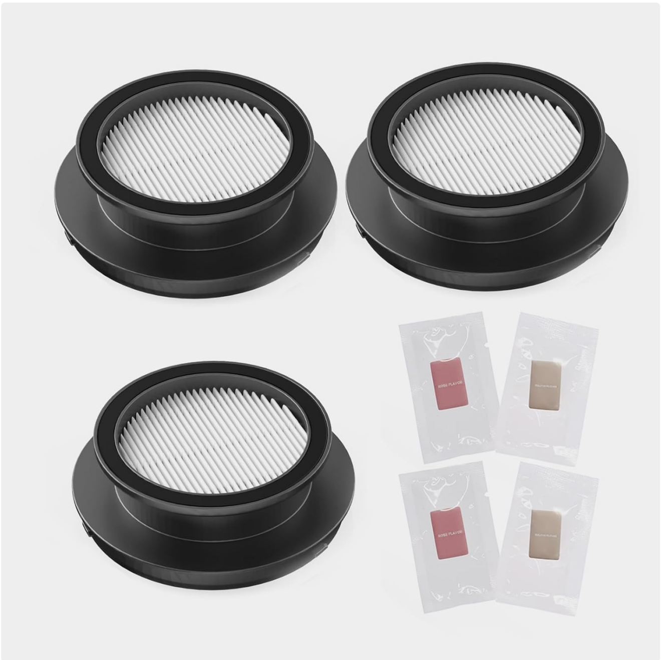
Figure 2: Included replacement filters and aromatherapy tablets.