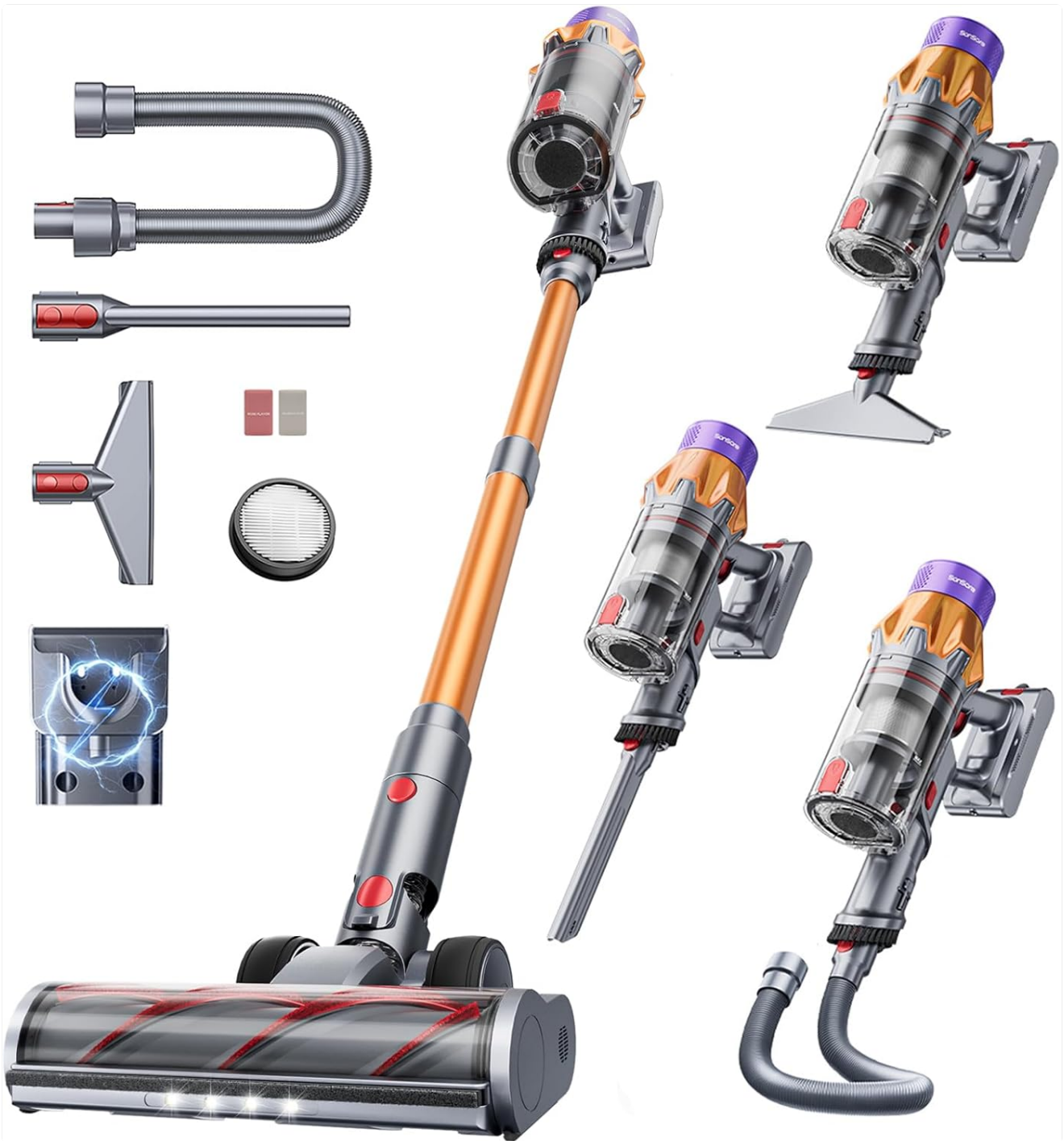
Figure 1: Included components of the SunSare X7A Pro vacuum cleaner.