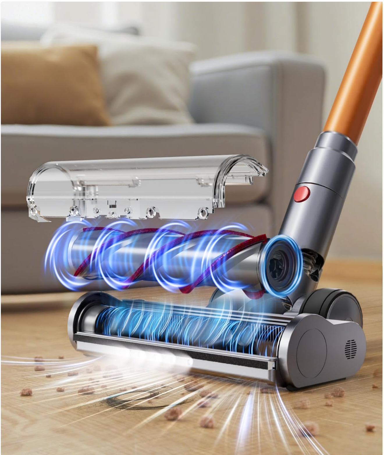
Figure 8: Internal view of the floor brush and airflow for effective cleaning.