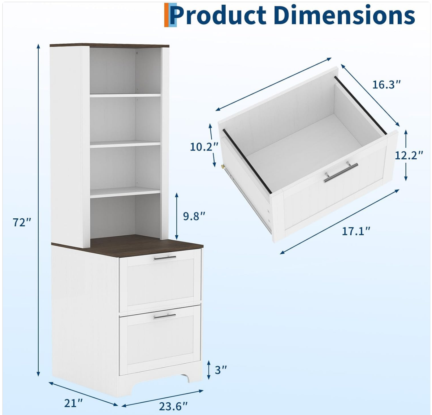
Image: Detailed diagram illustrating the overall product dimensions of the GarveeHome bookshelf and the internal dimensions of the file drawers. This helps in planning placement and understanding component sizes during assembly.