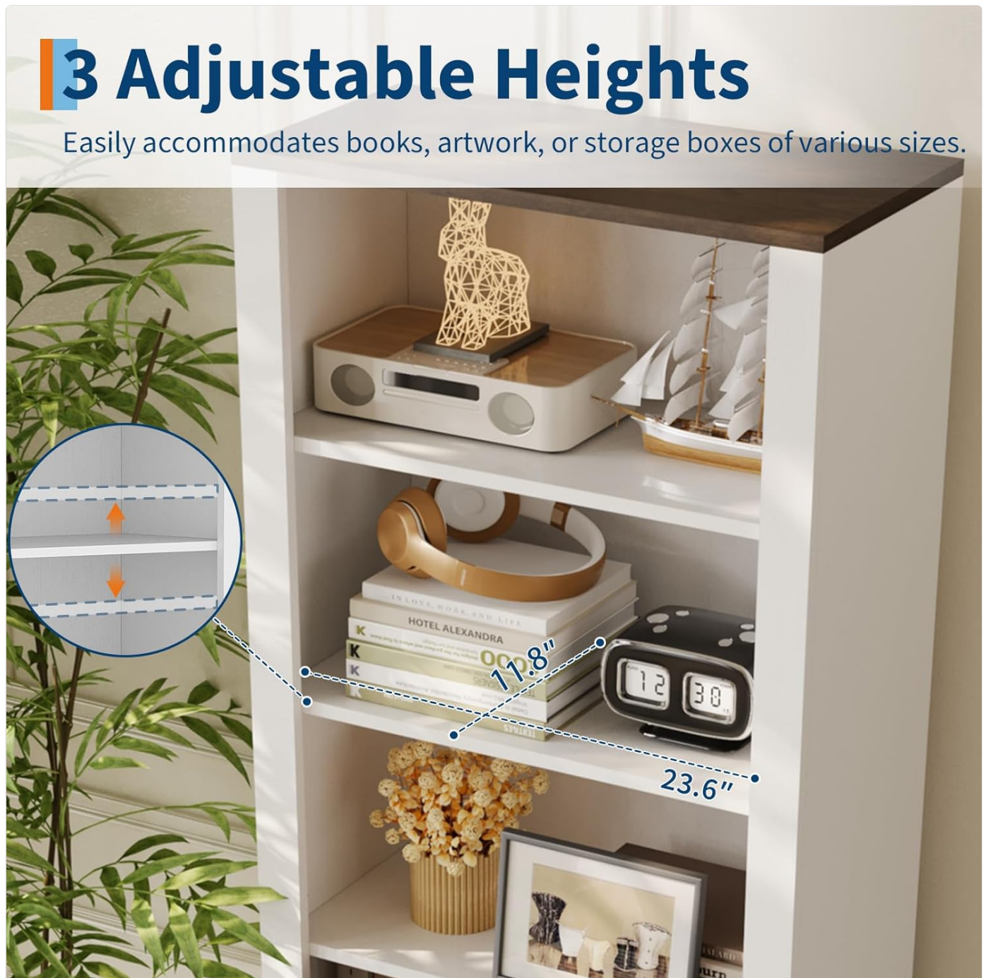
Image: Close-up view demonstrating the adjustable shelf heights. The image highlights how the shelves can be repositioned to accommodate items of different sizes, such as books, artwork, or storage boxes.

Remember to distribute weight evenly on each shelf and adhere to the 15 lbs (6.8 kg) weight limit per shelf.