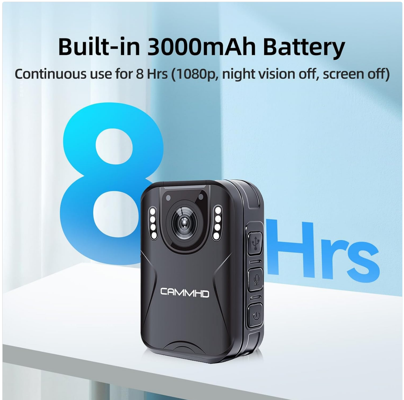
Image: The CAMMHD H4 Body Camera emphasizing its 3000mAh battery, capable of 8 hours of continuous use.

Before first use, fully charge the body camera. Connect the USB cable to the camera and then to the provided charger. Plug the charger into a standard wall outlet. The charging indicator light will show the charging status. A full charge typically takes about 4 hours.