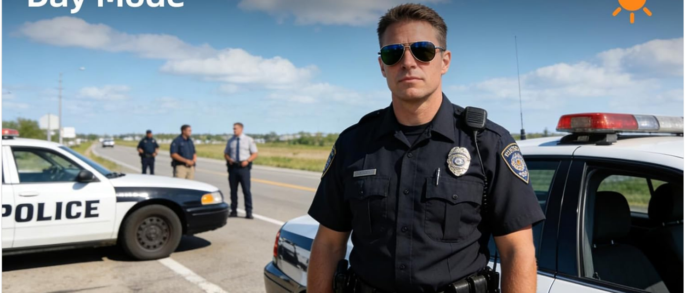
Image: Illustrates the difference between Night Vision Mode (ON) and Day Mode, showing clear visibility in dark conditions with the CAMMHD H4.