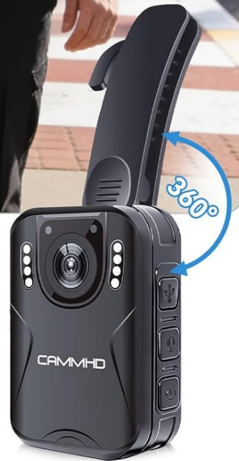
Image: The CAMMHD H4 Body Camera, illustrating its compact design and 360-degree rotating clip for versatile attachment.

Body Cameras with Audio and Video Recording