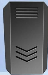
Short 360° Clip