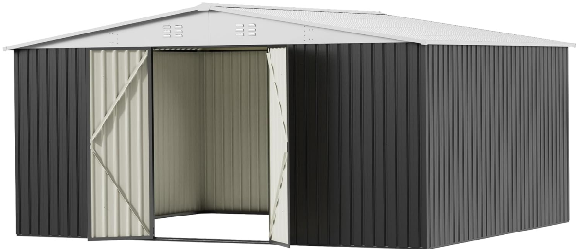
Image: Front view of the assembled EASYHAWK 14x12FT Metal Outdoor Storage Shed.