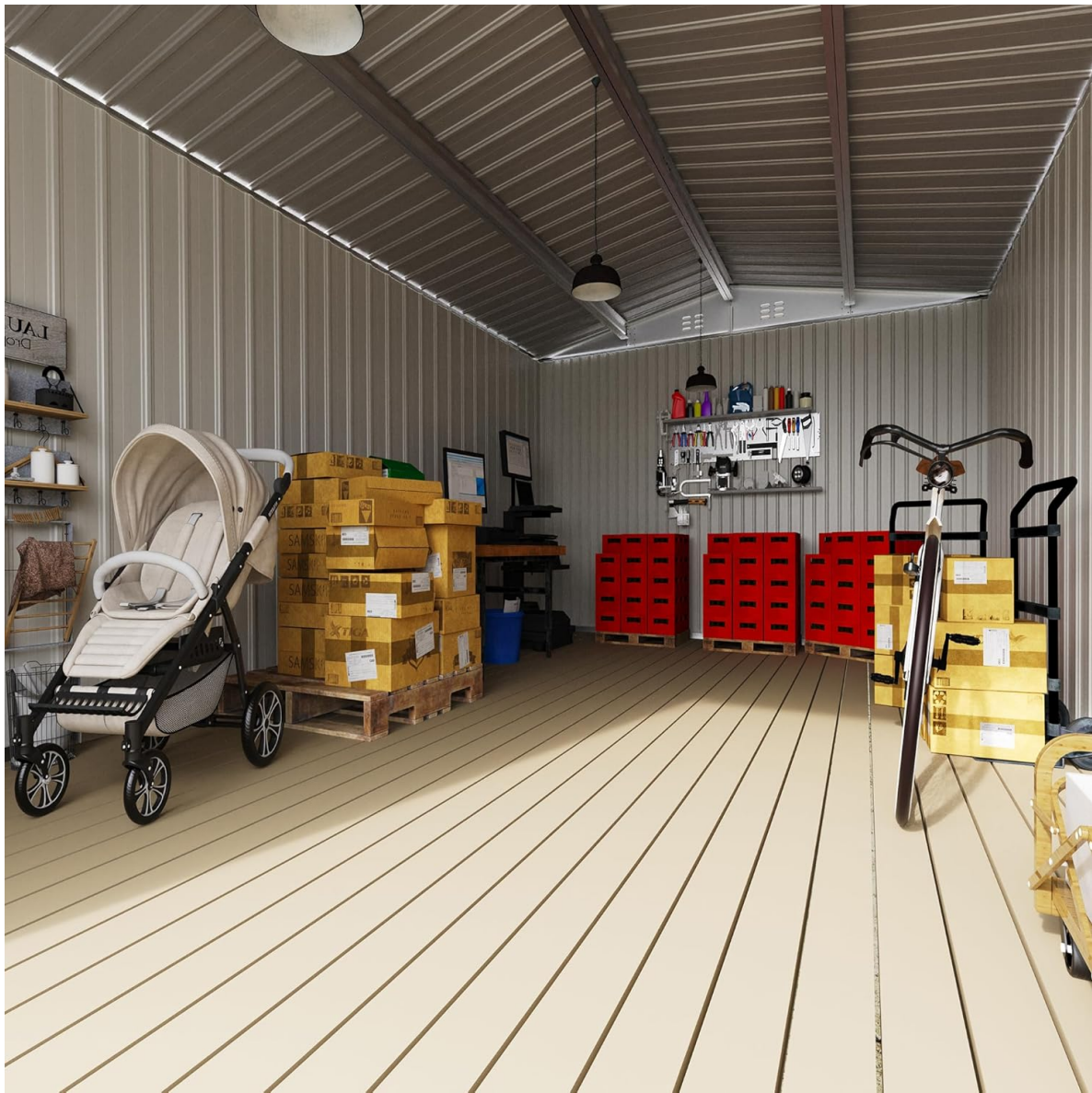
Image: Interior view of the shed, showcasing the spacious layout and potential for organization.