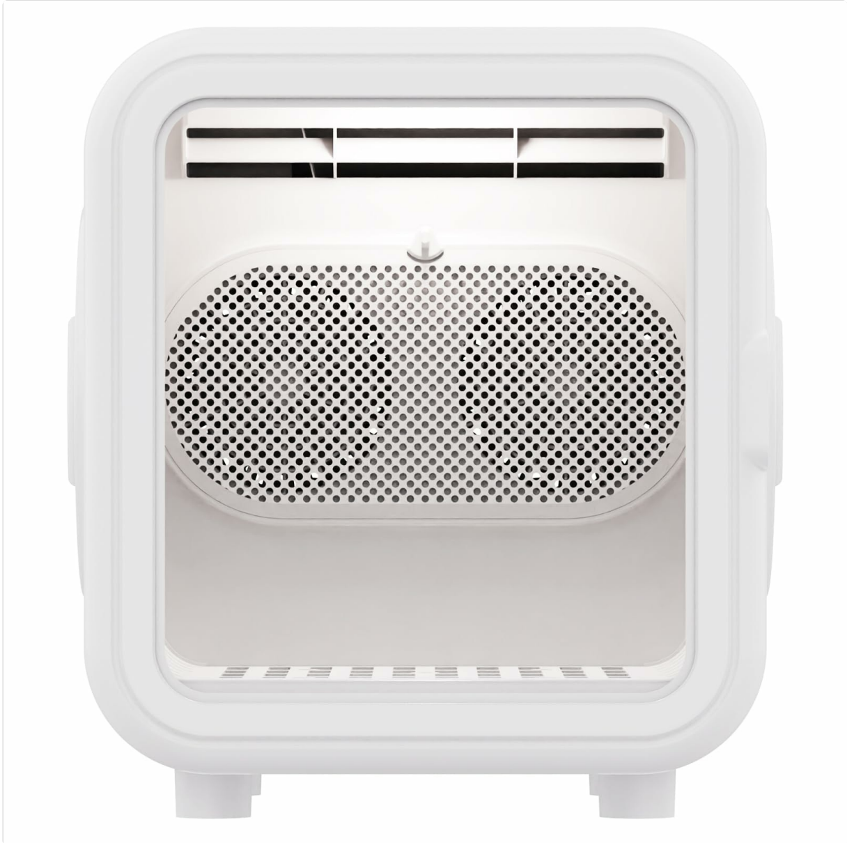
Figure 1: Overall view of the advwin 75L Automatic Pet Dryer Box with the front door open, showing the interior drying space.

Familiarize yourself with the components of your advwin Pet Dryer Box.