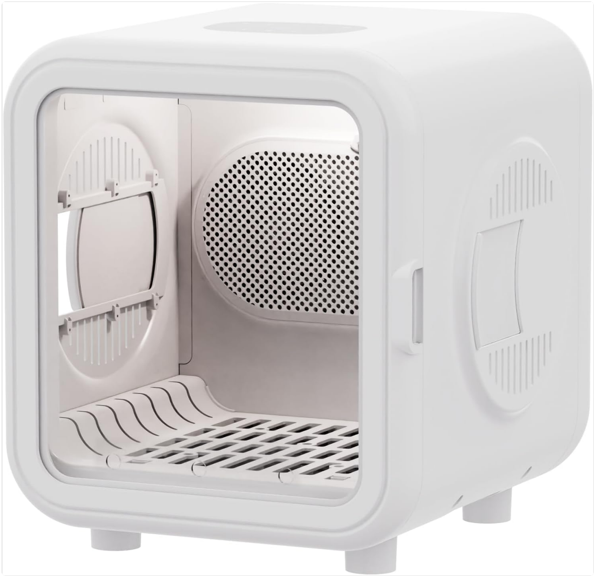
Figure 2: Interior view of the dryer box, highlighting the internal fan and heating element for 360° efficient drying.