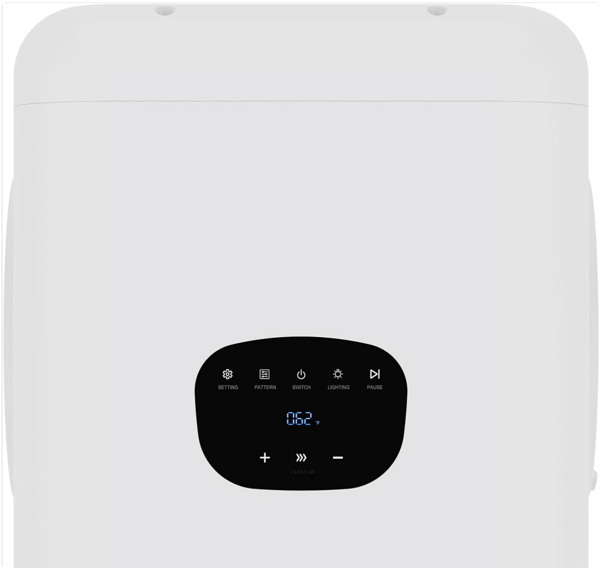
Figure 3: Detailed view of the control panel, featuring buttons for settings, pattern, switch, lighting, and pause, along with temperature display and adjustment controls.