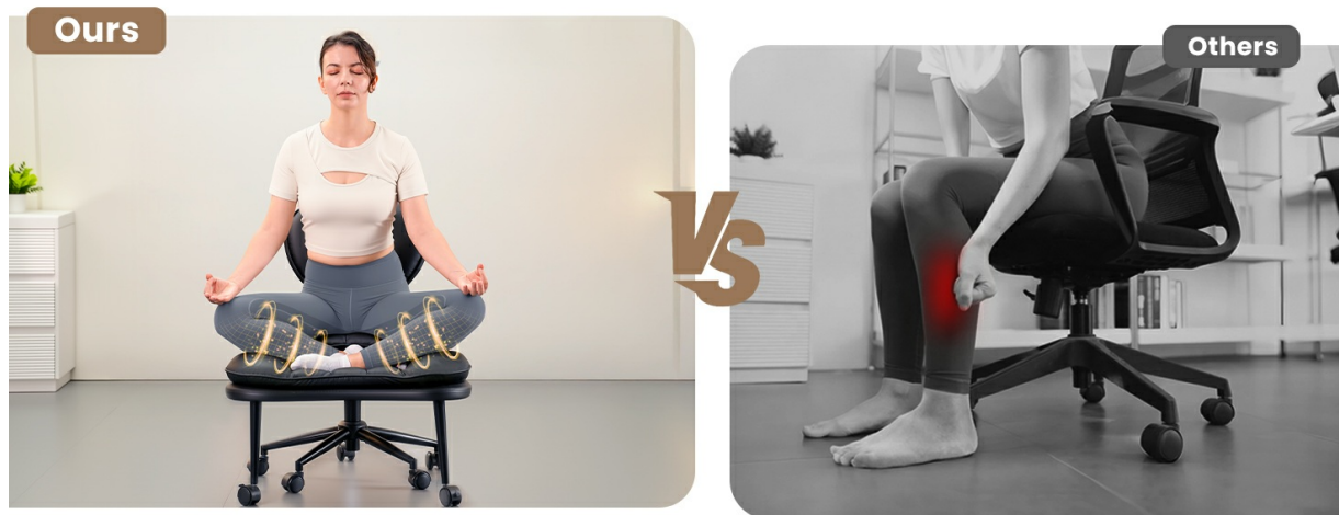
Figure 3: Multiple Sitting Positions

This chair is designed to support various sitting positions, including cross-legged, kneeling, meditation, or standard sitting. The wide seat cushion and adjustable footrest allow for easy transitions between these positions.