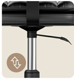
4.7" Height Adjustment