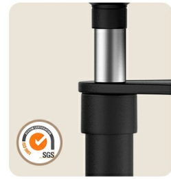
SGS-Certified Gas Lift