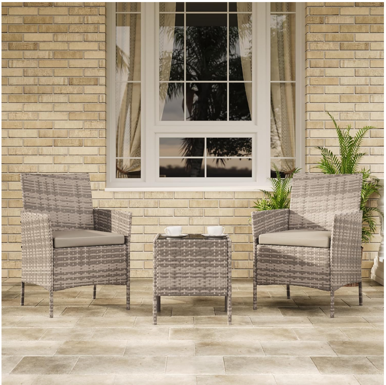
The GAOMON 3-Piece Patio Furniture Set, featuring two chairs and a coffee table, designed for outdoor use.