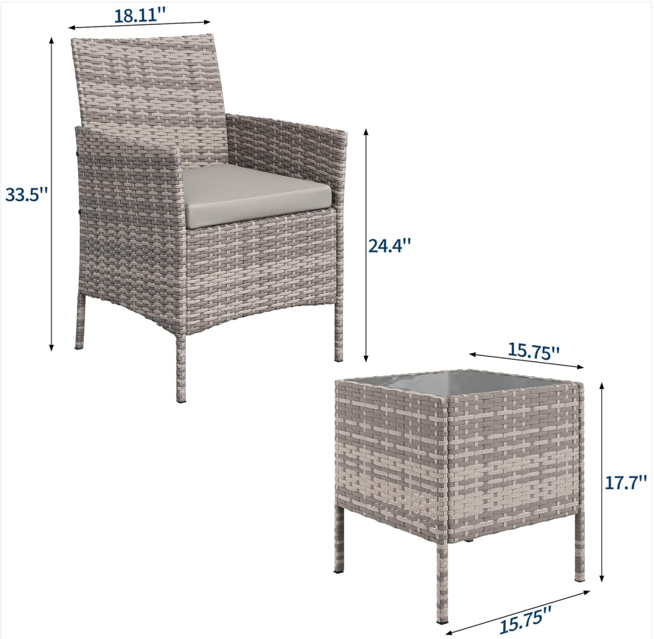
Detailed dimensions for the GAOMON patio chair and coffee table.