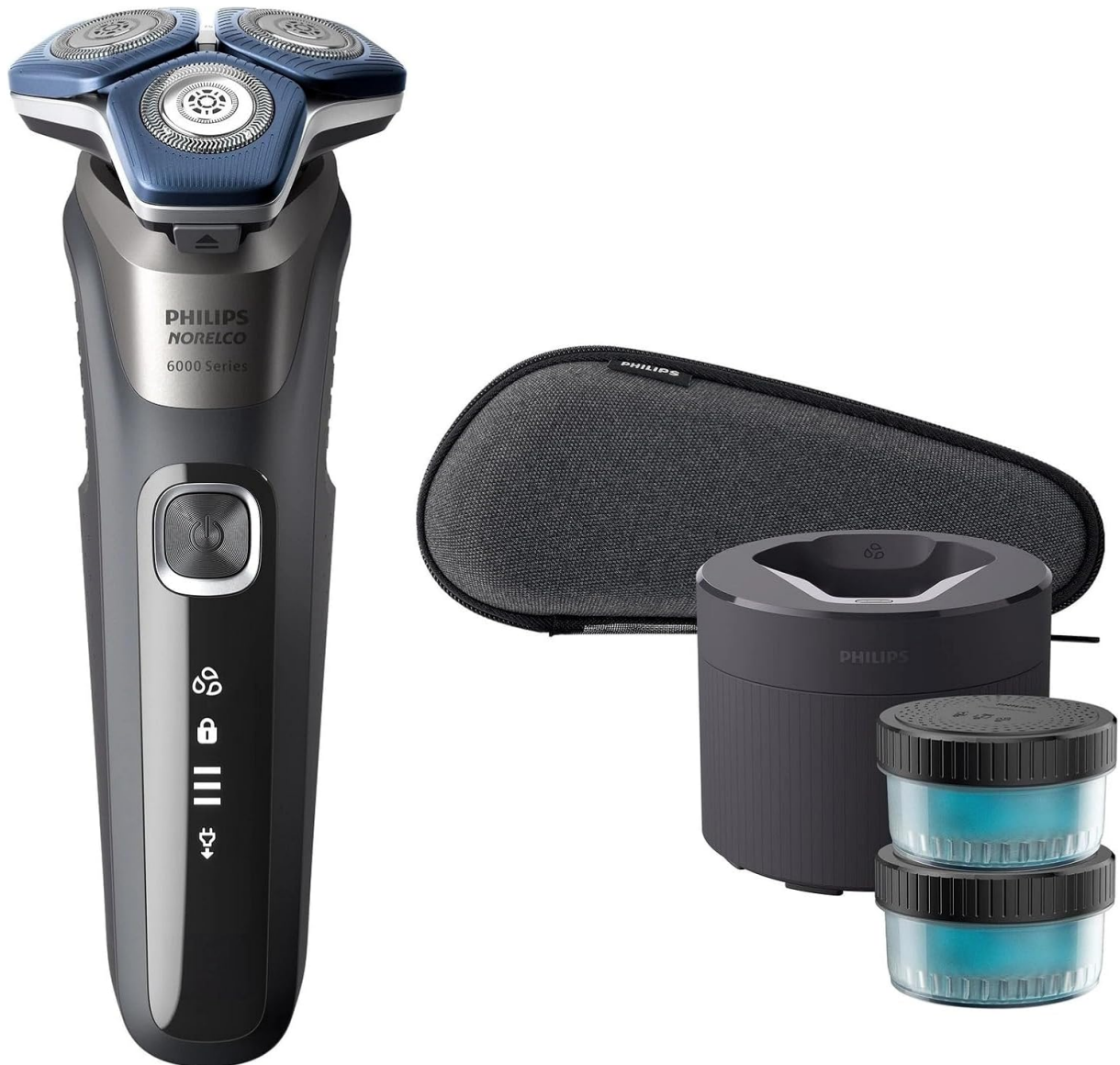
Image: The Philips Shaver 6900 S9000/89, accompanied by its travel case, cleaning station, and two cleaning solution refills, as included in the package.