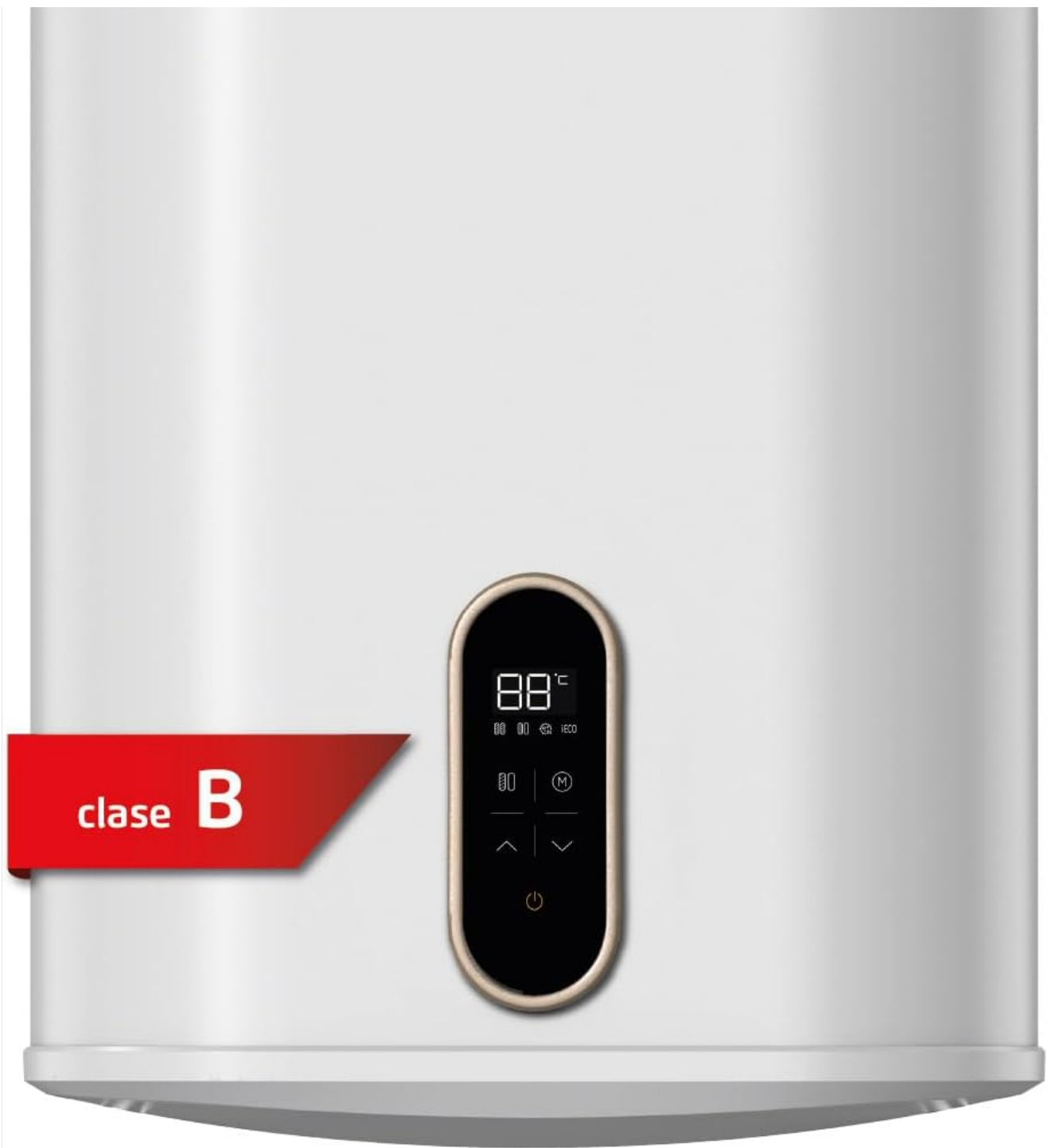
Image 1.1: Front view of the Corberó CTM755FL Electric Water Heater.