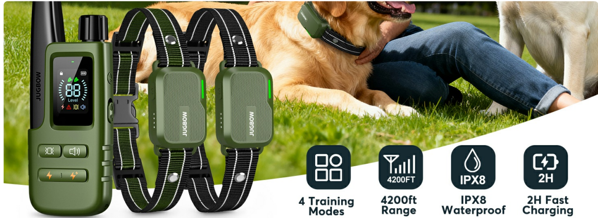
Key features of the Jugbow Dog Training Collar system.