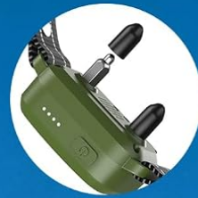
Protective Rubber Covers