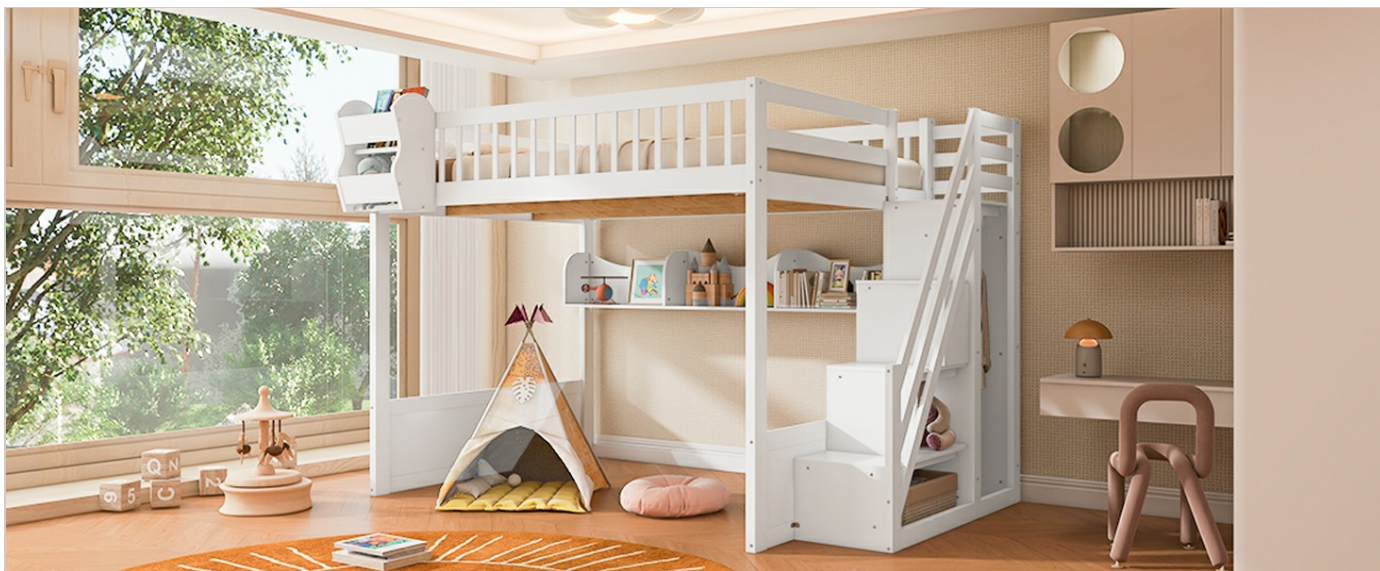
Image: An assembled CKLMMC Queen Size Wooden Loft Bed in a white finish, showcasing the upper bed, staircase, and under-bed area.