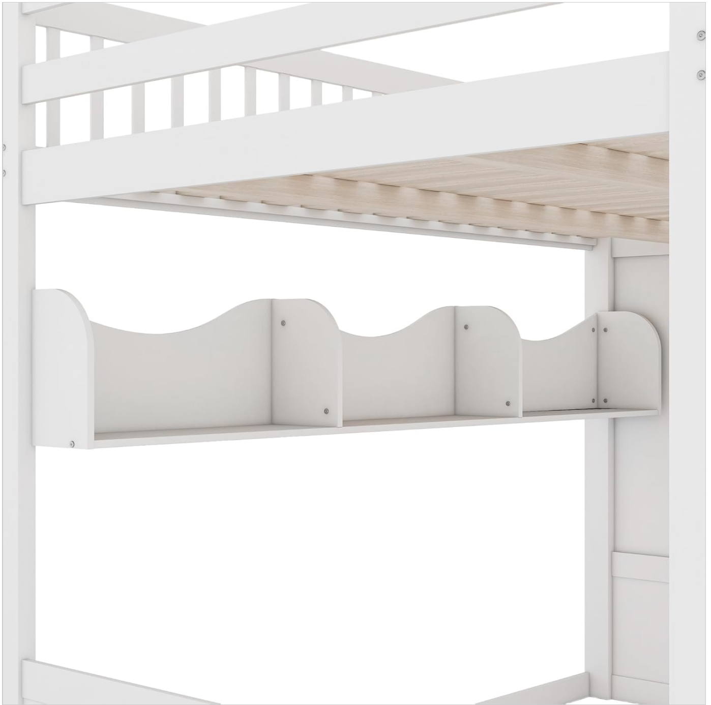
Image: A detailed view of the three wave-shaped storage shelves located under the loft bed, suitable for various items.