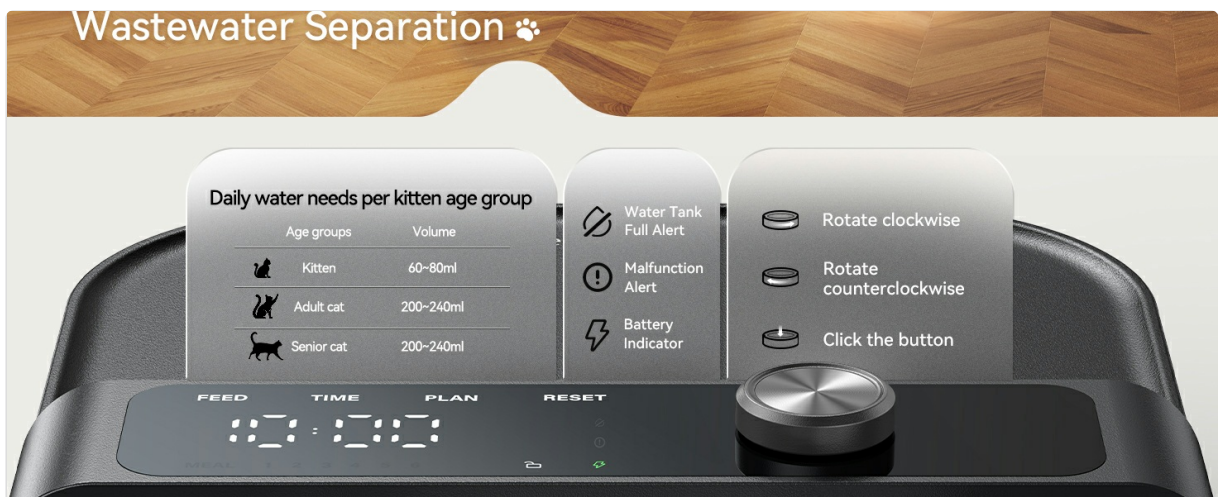
Figure 5.1: The intelligent display provides clear information and controls for setting water dispensing schedules and monitoring status.

Please refer to the instruction manual for more details