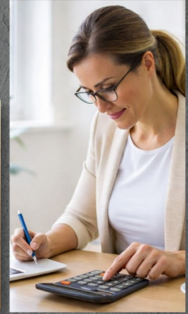
Image: The TRULY 837A Pro calculator, showcasing its design suitable for office use.