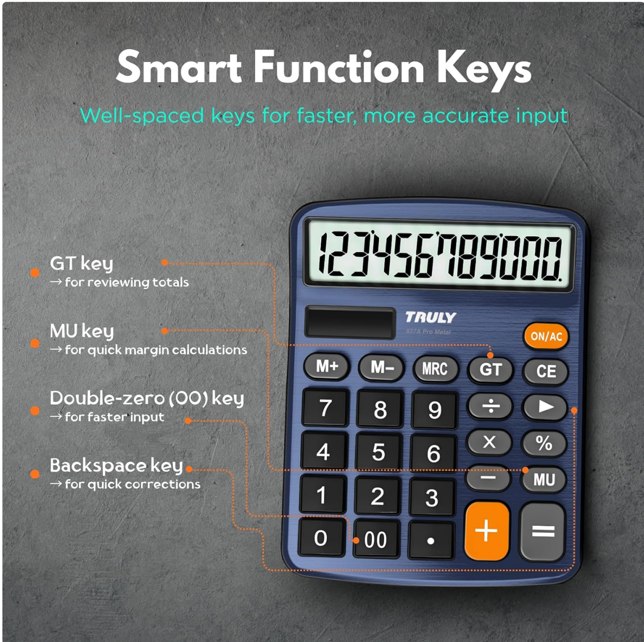
Image: The TRULY 837A Pro calculator highlighting its smart function keys: GT key for reviewing totals, MU key for quick margin calculations, Double-zero (00) key for faster input, and Backspace key for quick corrections.

Familiarize yourself with the calculator's layout and key functions for efficient operation.