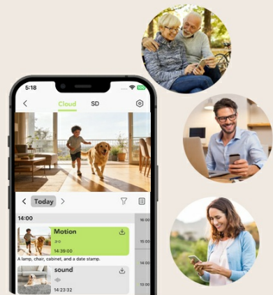
Image: Osaio App Setup Steps