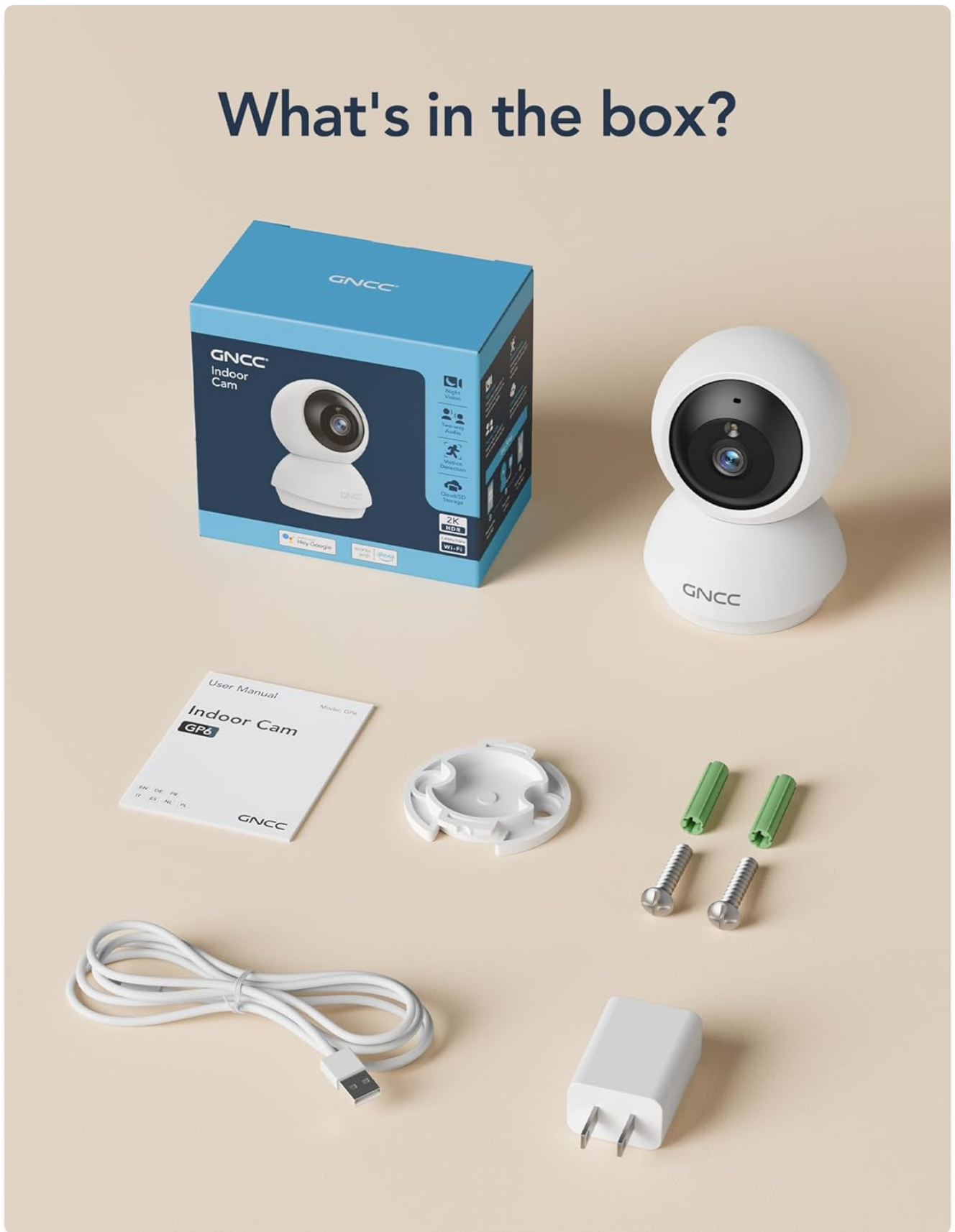
Image: GNCC GP6 2K Indoor Pan/Tilt Security Camera box contents