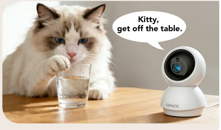
Image: Dual-Band 2.4GHz/5GHz Wi-Fi