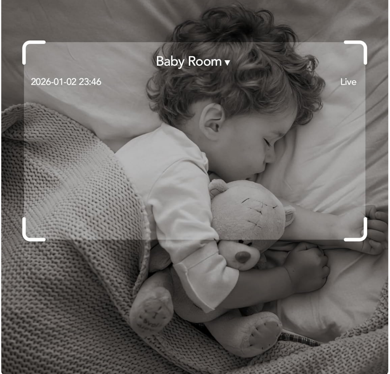
Image: Night Vision

Never miss a moment of your baby, day or night