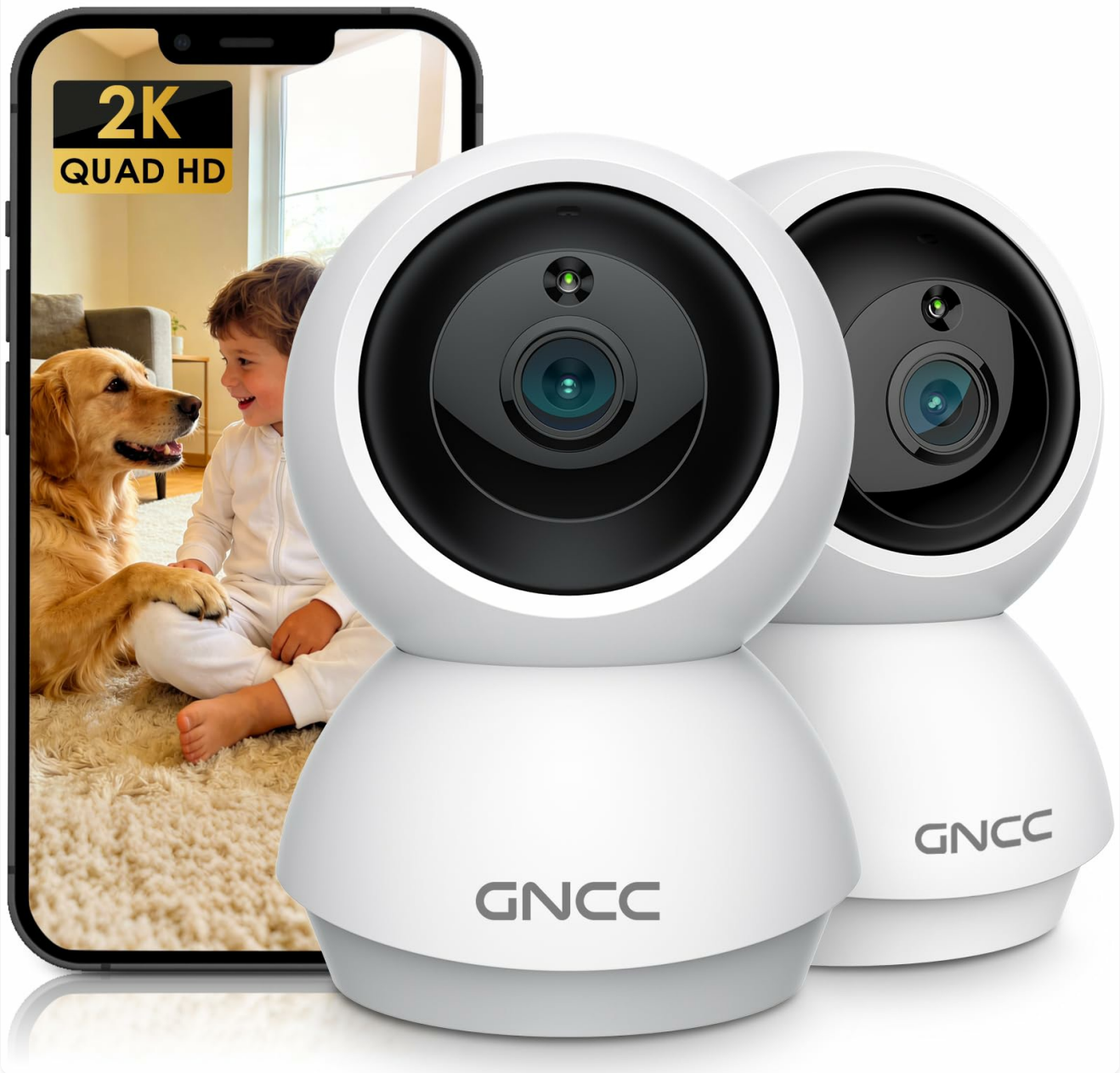
Image: GNCC GP6 2K Indoor Pan/Tilt Security Camera