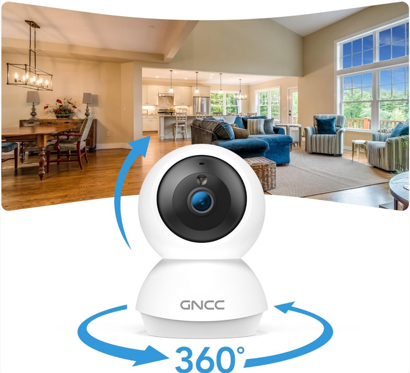
Image: Smart Detection & Instant Alerts