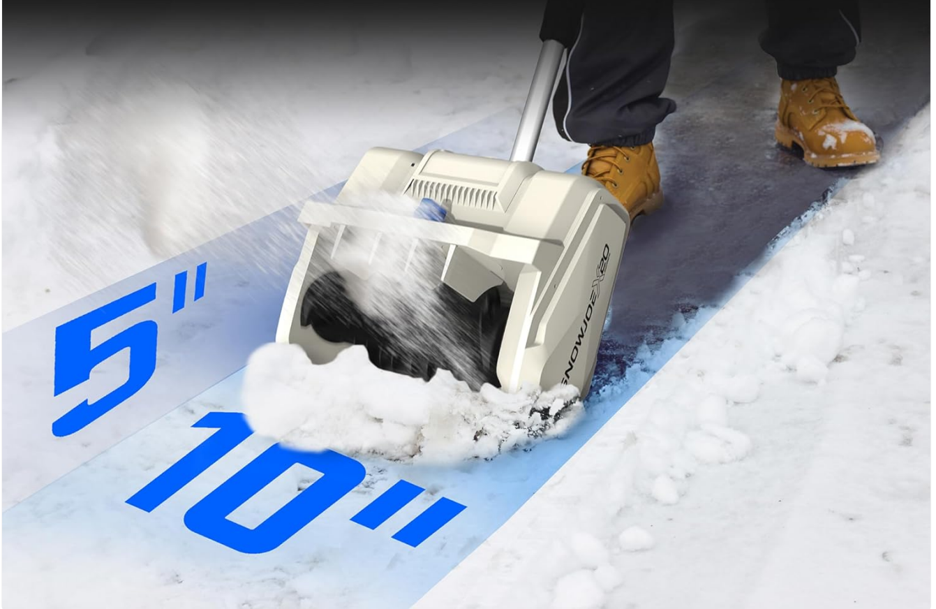
Figure 3: The compact clearing capability of the snow shovel, ideal for decks, steps, and walkways.

10"W x 5"D SNOW CUT: PERFECT FOR DECKS, STEPS, + WALKWAYS