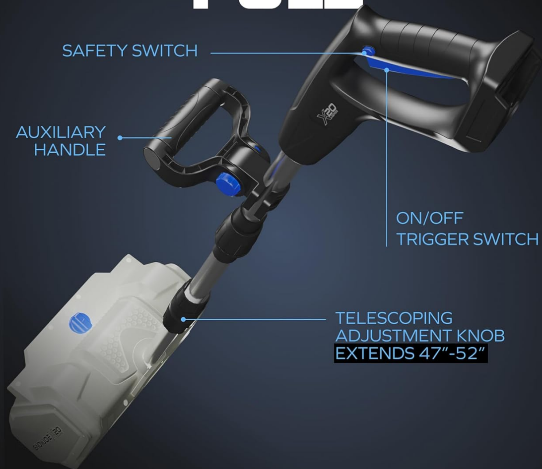
Figure 1: The telescoping pole with safety switch, auxiliary handle, and on/off trigger switch for ergonomic operation.