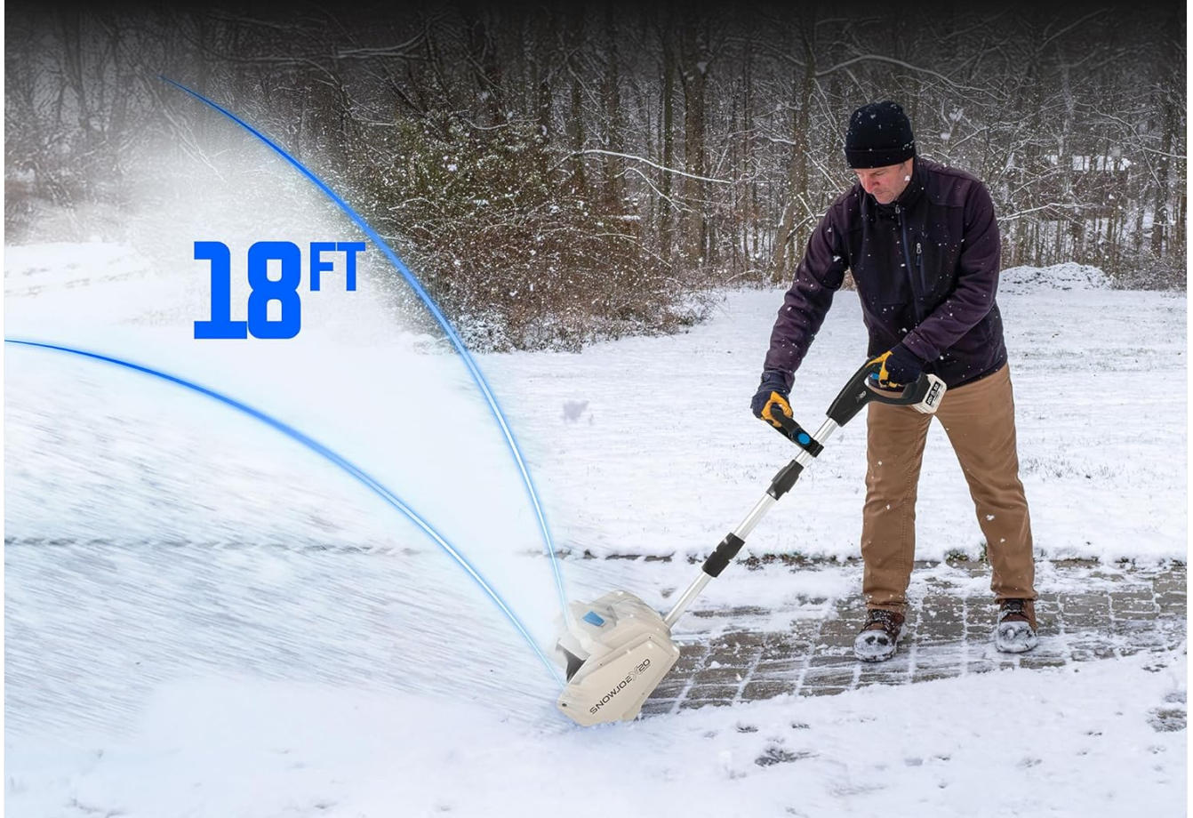
Figure 5: The powerful auger system throwing snow up to 18 feet.

21,200 RPM AUGER SPEED QUICKLY CLEARS SNOW WITH EASE