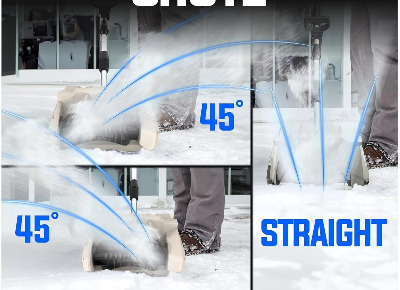
Figure 4: Illustration of the 45° directional chute for controlled snow discharge.