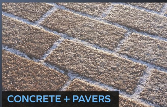
Figure 6: Versatile use across various surfaces including decks, steps, and driveways.