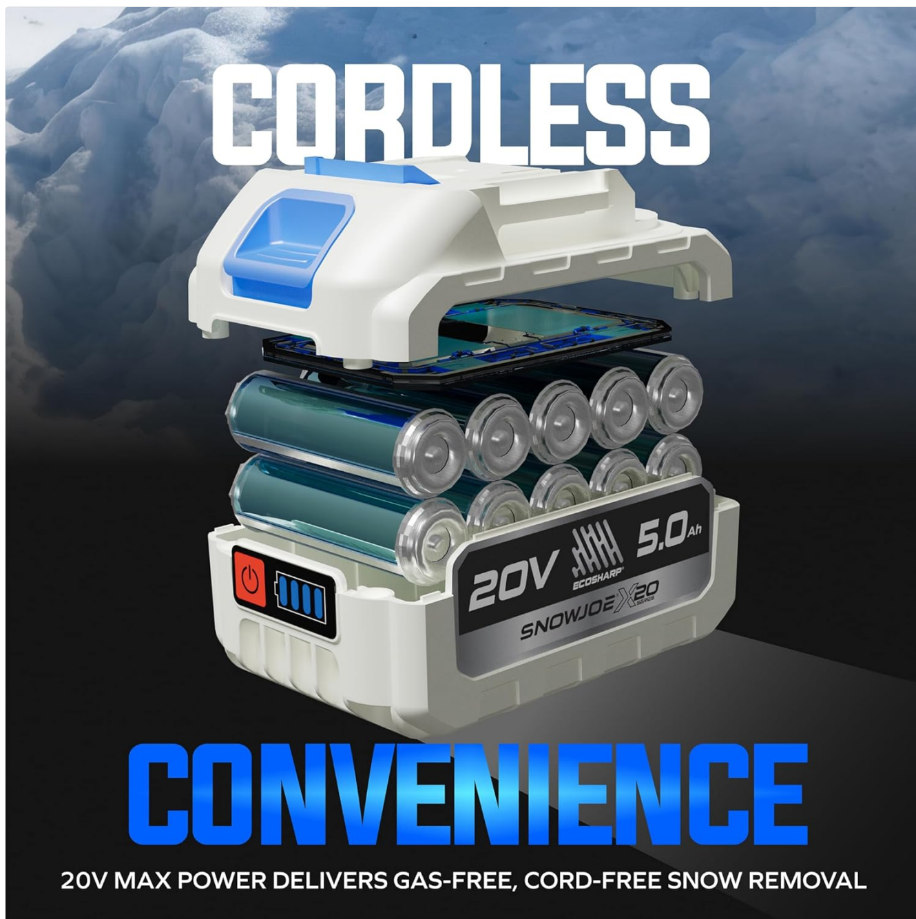
Figure 2: The 20V 5.0Ah ECOSHARP battery system, providing cordless convenience.