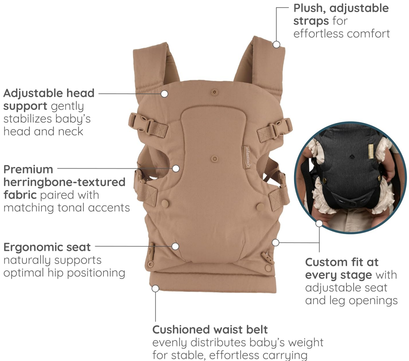
Image: Detailed view of carrier benefits including plush adjustable straps, adjustable head support, premium herringbone-textured fabric, ergonomic seat for optimal hip positioning, and a cushioned waist belt for even weight distribution.