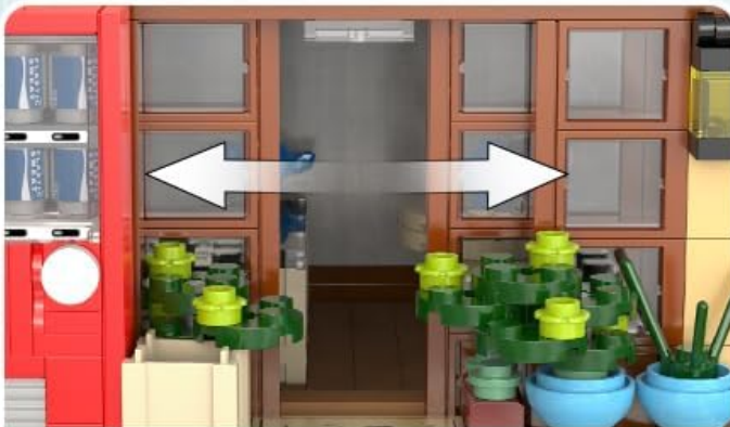
Sliding door opening and closing