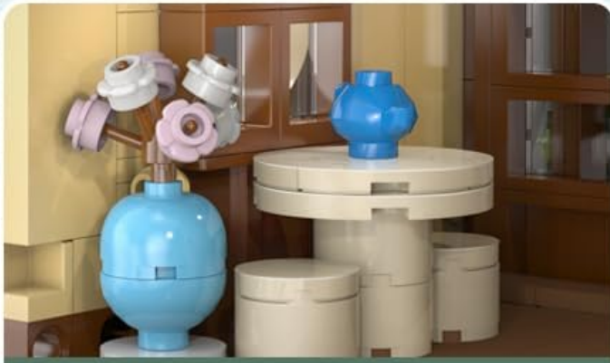
Tea drink table on the first floor