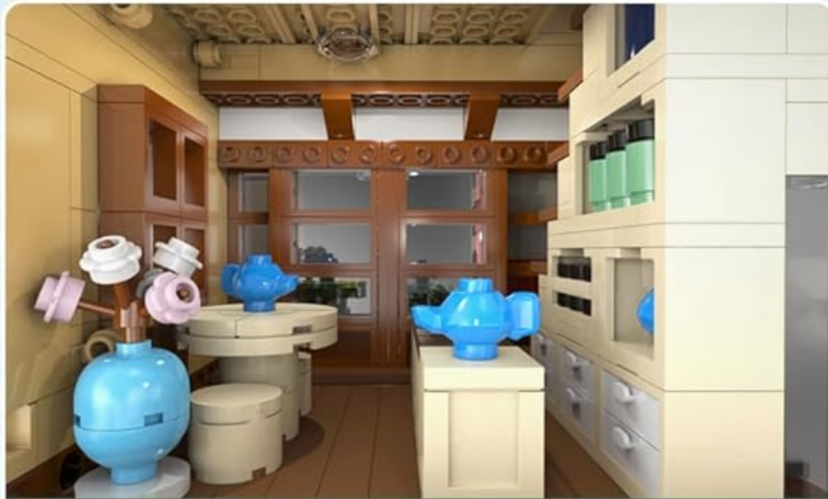
Lower floor details