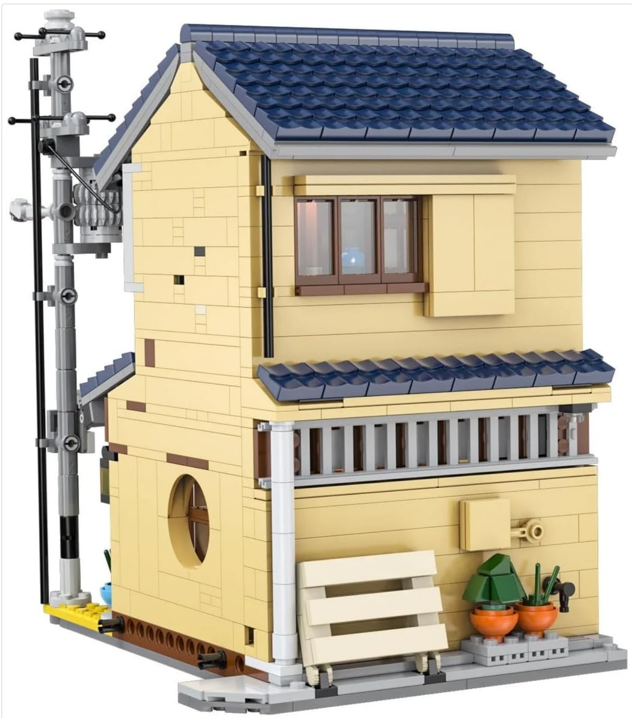
Image 4.1: Overview of the modular build, highlighting the first floor, second floor, A/C unit, vent pipe, street lights, vending machines, and potted plants.