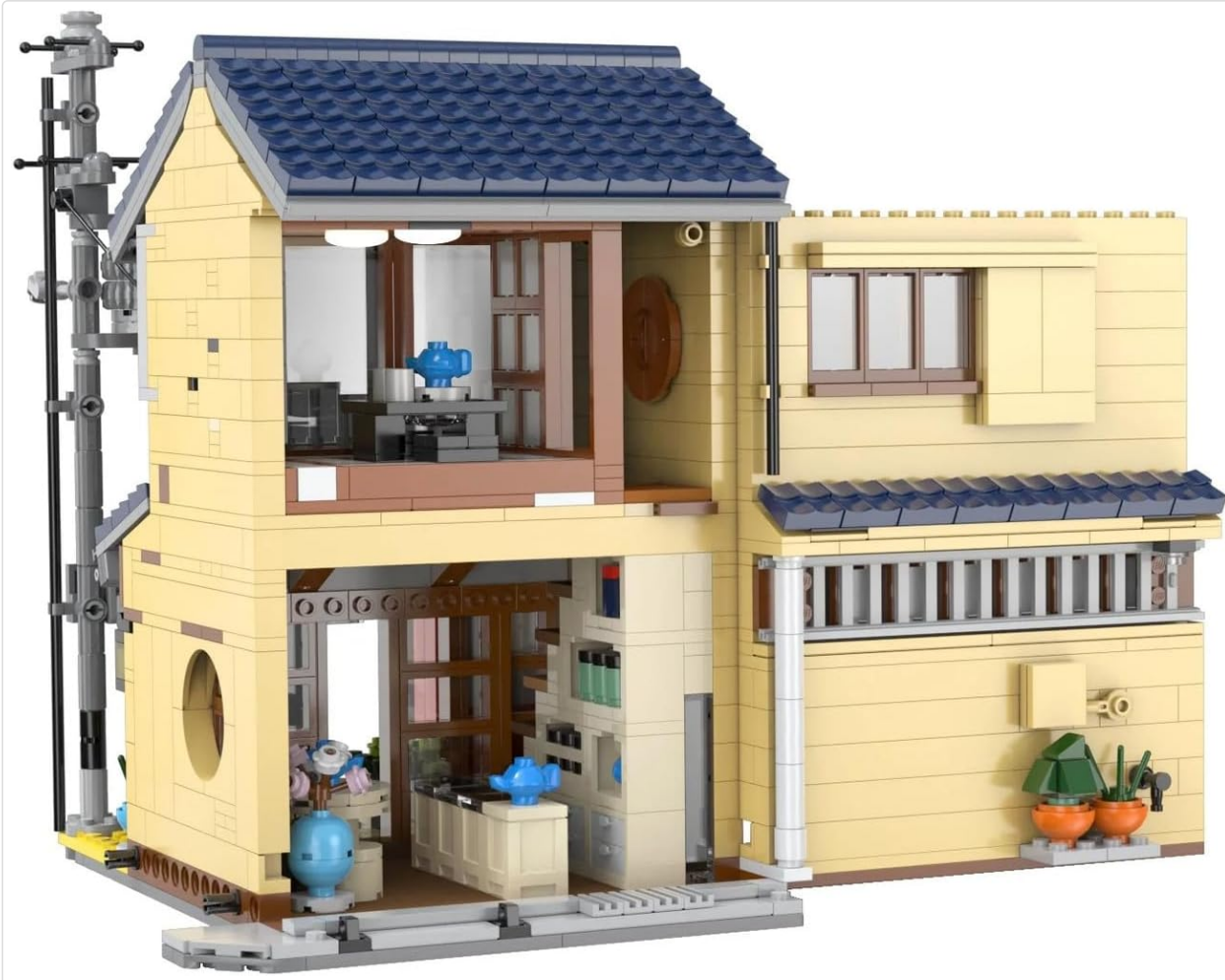
Image 5.1: The rear wall of the model can be opened to reveal the detailed interior of the tea shop.