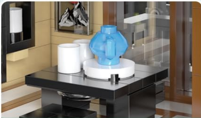
Tea drink table on the second floor