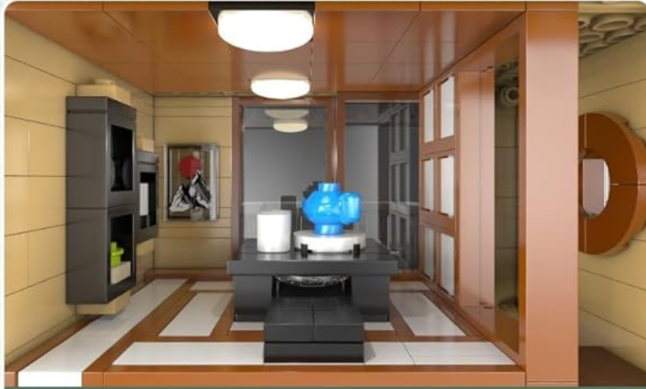
Panoramic display on the second floor