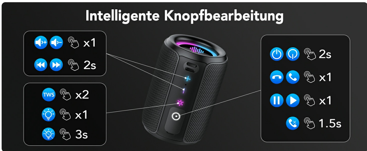
Image: Speaker button layout and functions. This diagram illustrates the various buttons on the speaker and their corresponding actions, including single presses and long presses for power, volume, track control, light modes, and TWS pairing.

The speaker features intuitive controls and LED indicators for easy operation.