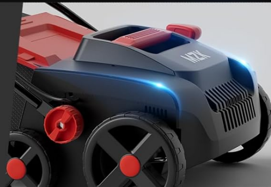
Image Description: A composite image showing "More Details" of the dethatcher. It includes three sections: "EASY TO CONTROL" showing the wheels (8in and 6in), "3-HEIGHT ADJUSTABLE HANDLE" with dimensions (39", 42", 45"), and "REINFORCED SHELL" showing a close-up of the durable casing. This provides a visual guide to the machine's design and adjustable features.