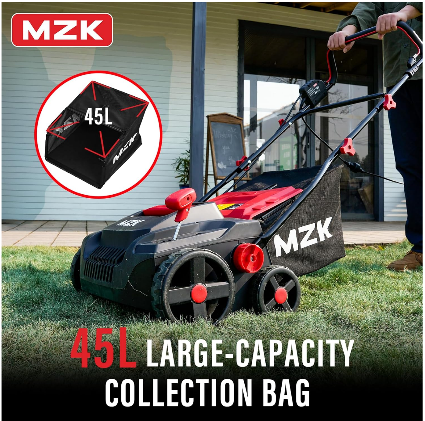
Image Description: The MZK dethatcher on a lawn with its 45L large-capacity collection bag attached at the rear. An inset shows a close-up of the empty collection bag. This highlights the bag's size and its integration with the machine.