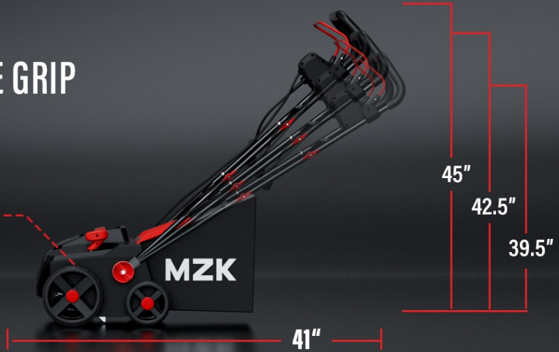
Image Description: A diagram illustrating the 3-height adjustable grip of the dethatcher handle, showing height options of 39.5", 42.5", and 45" from the ground. This helps users select a comfortable operating height.