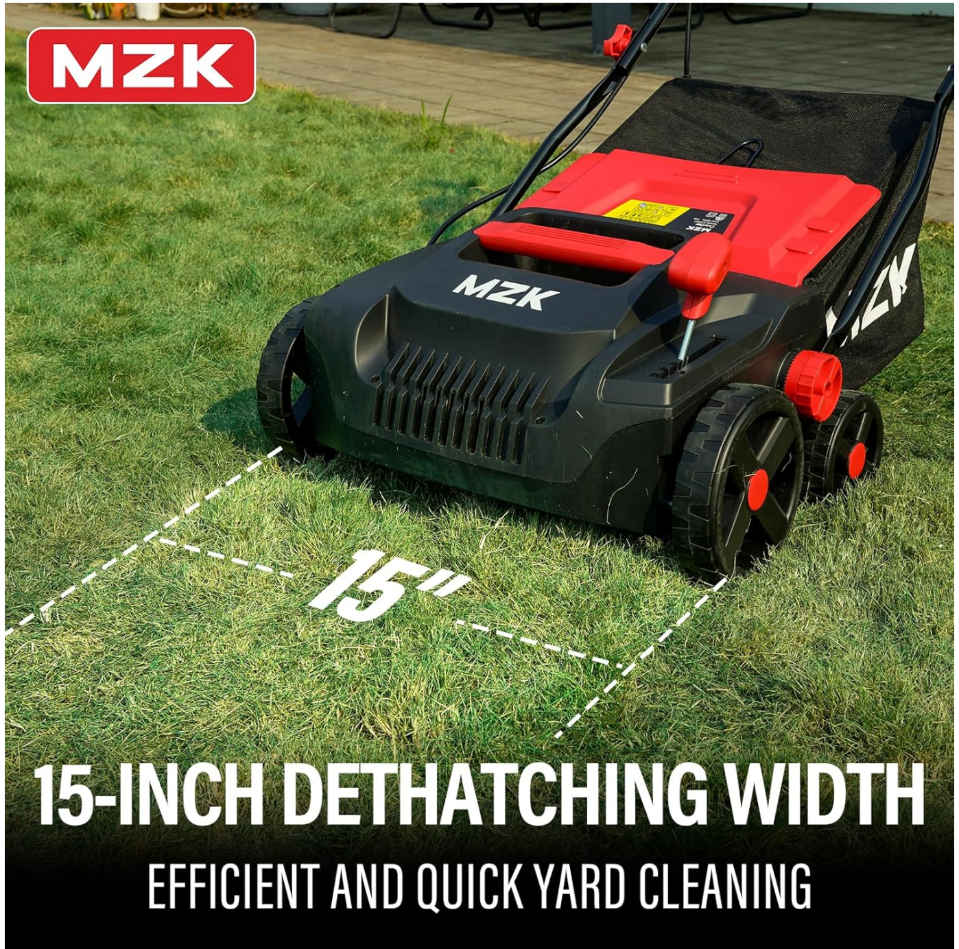
Image Description: A full view of the MZK 15-inch 2-in-1 Electric Dethatcher and Scarifier on a green lawn. The machine is red and black, with a collection bag at the rear and a handle extending upwards. The image highlights its 15-inch dethatching width for efficient yard cleaning.

Familiarize yourself with the main components of your dethatcher/scarifier.