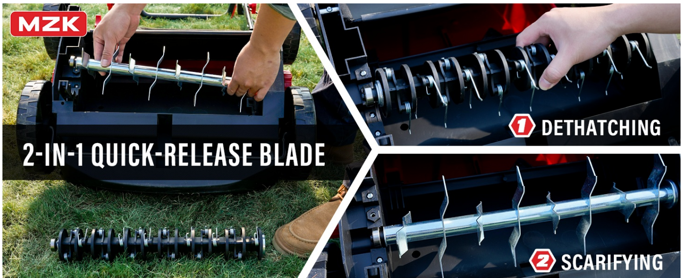
Image Description: A detailed image showing a person removing the blade shaft from the dethatcher. The image is labeled "2-IN-1 QUICK-RELEASE BLADE" and shows both the dethatching and scarifying rollers separately, emphasizing the ease of switching between them.