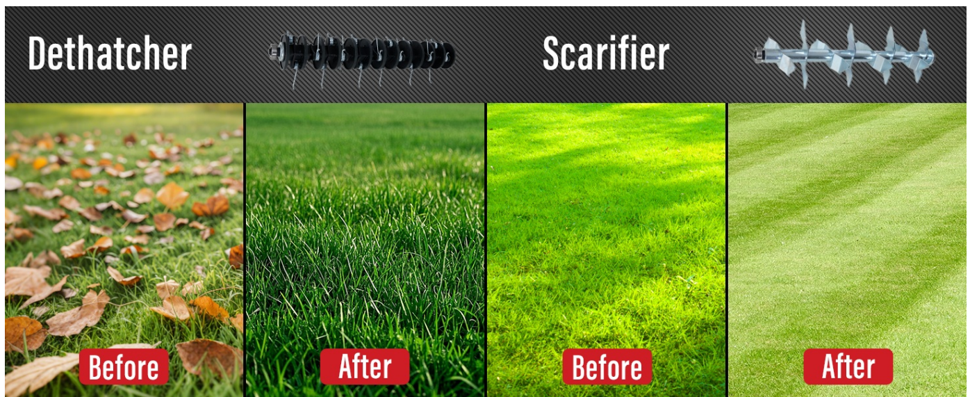
Image Description: A four-panel image showing "Before" and "After" results for both dethatching and scarifying. The dethatching panels show a lawn with leaves and dead grass before, and a clean, green lawn after. The scarifying panels show a less vibrant lawn before, and a lush, healthy lawn after. This demonstrates the effectiveness of both functions.

Image Description: A diagram illustrating "AIR BOOST TECHNOLOGY". The "Before" section shows matted grass and soil, while the "After" section shows a dethatched lawn with improved air and water flow to the roots, promoting healthier grass. This visually explains the benefit of dethatching.