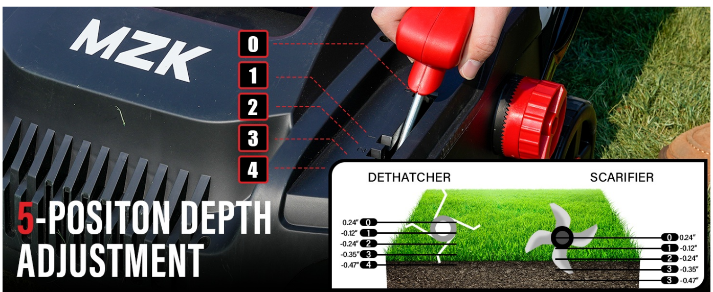
Image Description: A close-up view of a hand adjusting the 5-position depth adjustment lever on the dethatcher. The settings are clearly marked 0 to 4, with a diagram showing the corresponding dethatcher and scarifier blade depths relative to the ground surface.