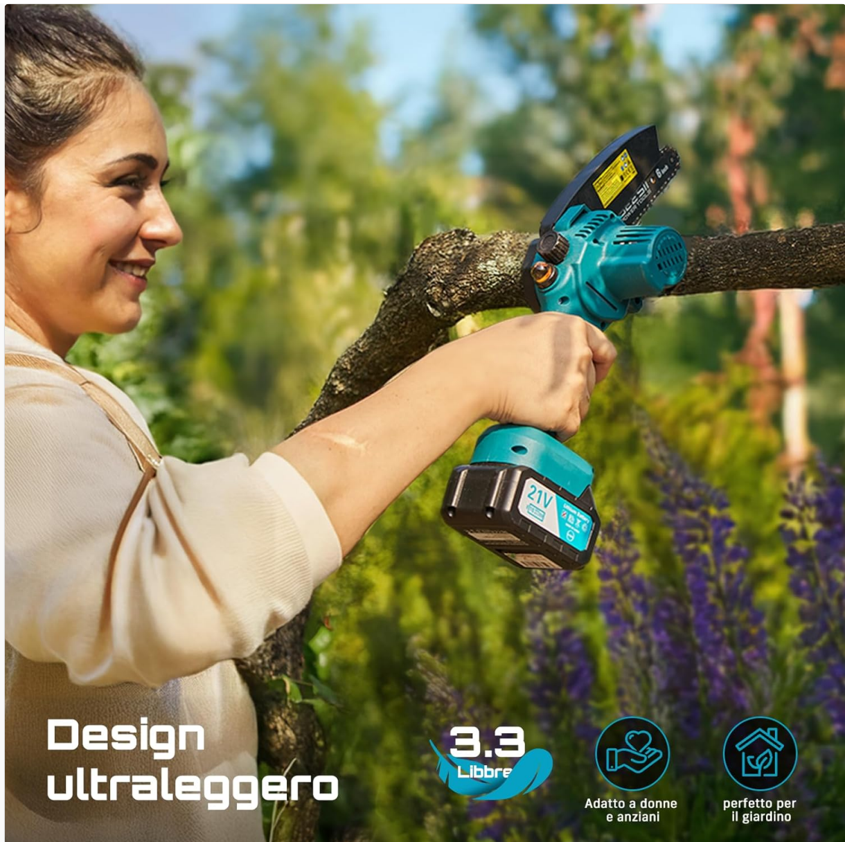
Figure 4.2: Using the mini chainsaw for pruning.