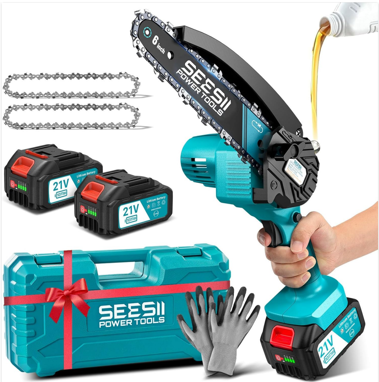
Figure 3.1: Battery installation on the SEESII Mini Chainsaw.